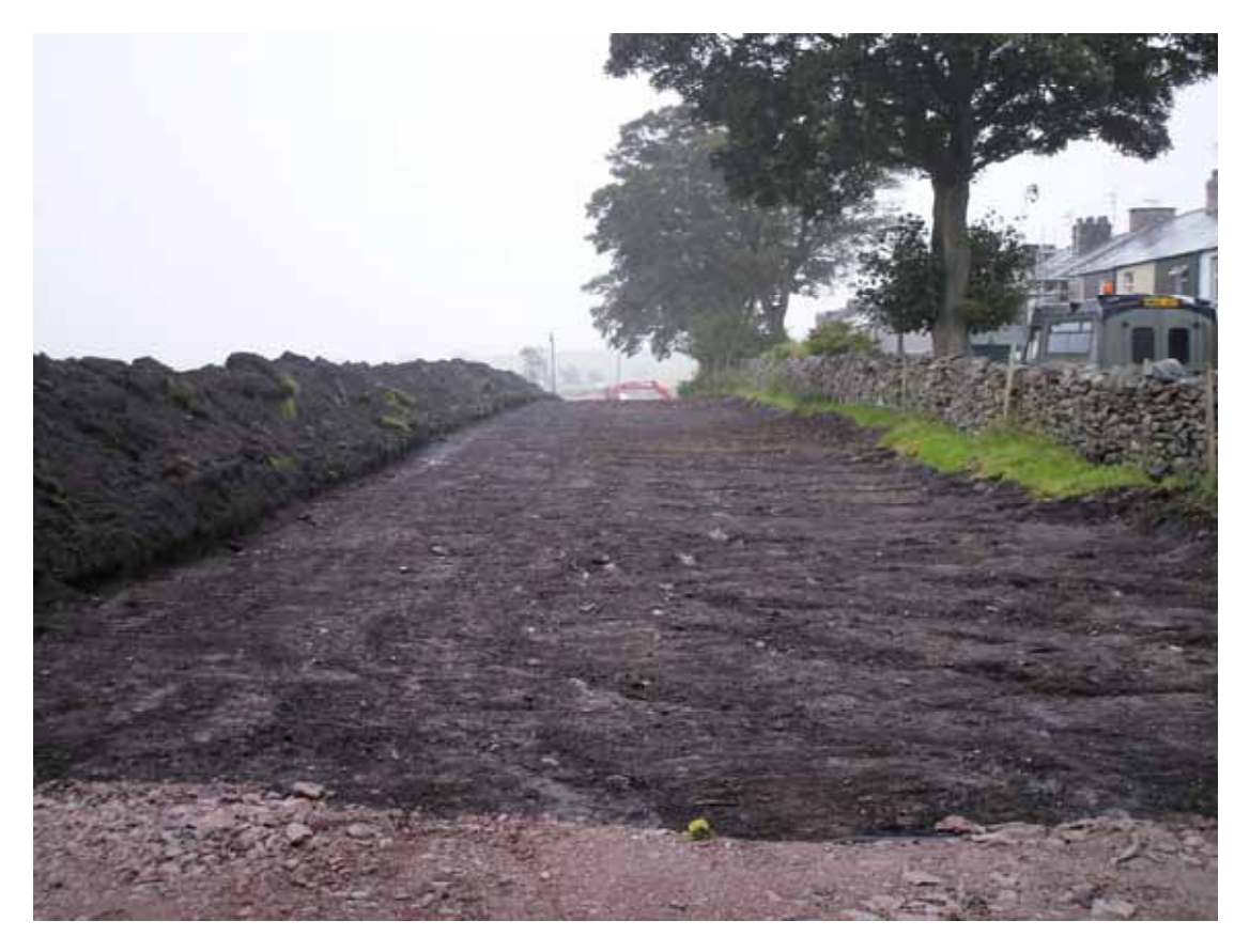
Plate 1: East-facing view of the west end of the east/west easement within Field 1