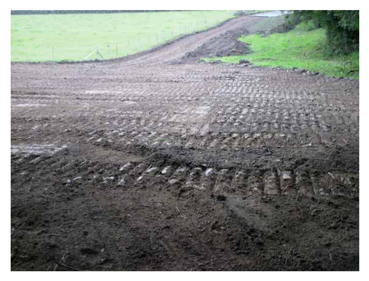
Plate 3: South-facing view of the north-west corner of Field 2