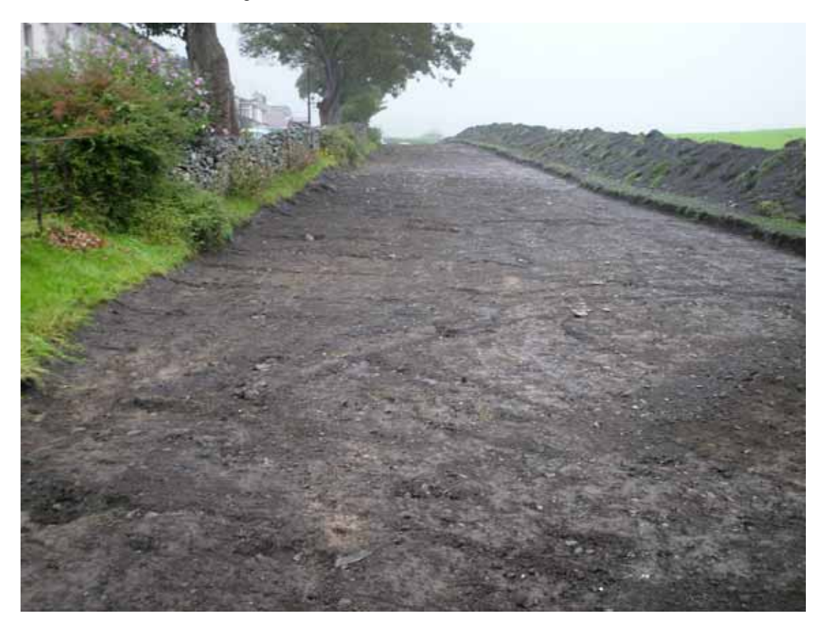
Plate 2: West-facing view of the east end of the east/west easement within Field 1