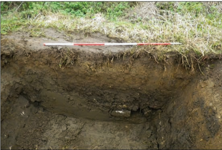
← Plate 4: Trench 3, from the south-west