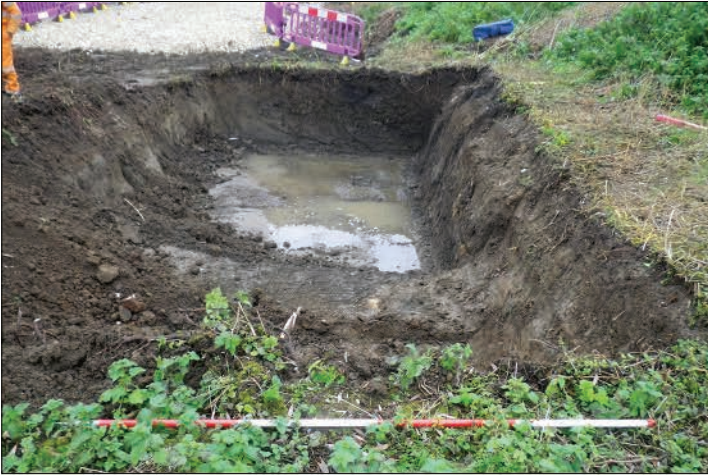
← Plate 3: Trench 2, from the south-east