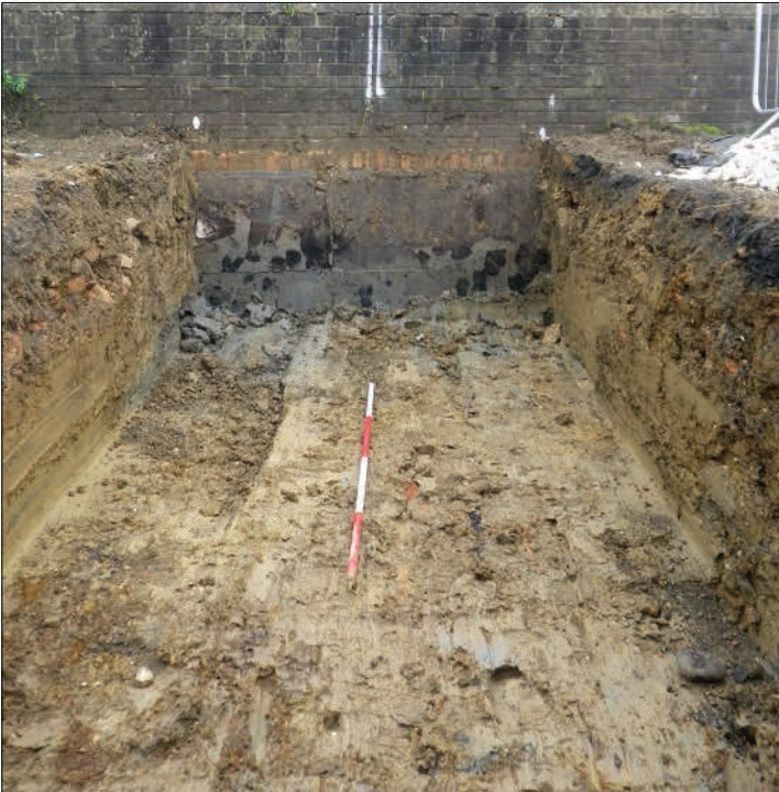
← Plate 2: Trench 1, from the north