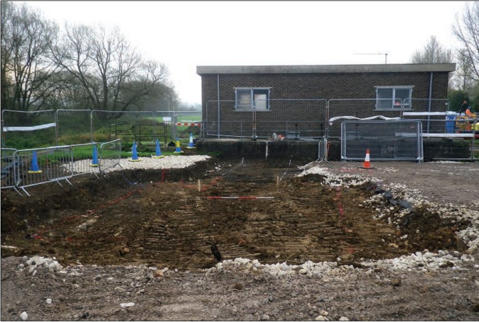
↑ Plate 1: Trench 1, from the north