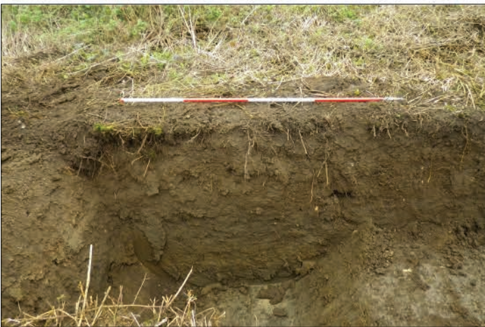
← Plate 5: Trench 4, from the south-west