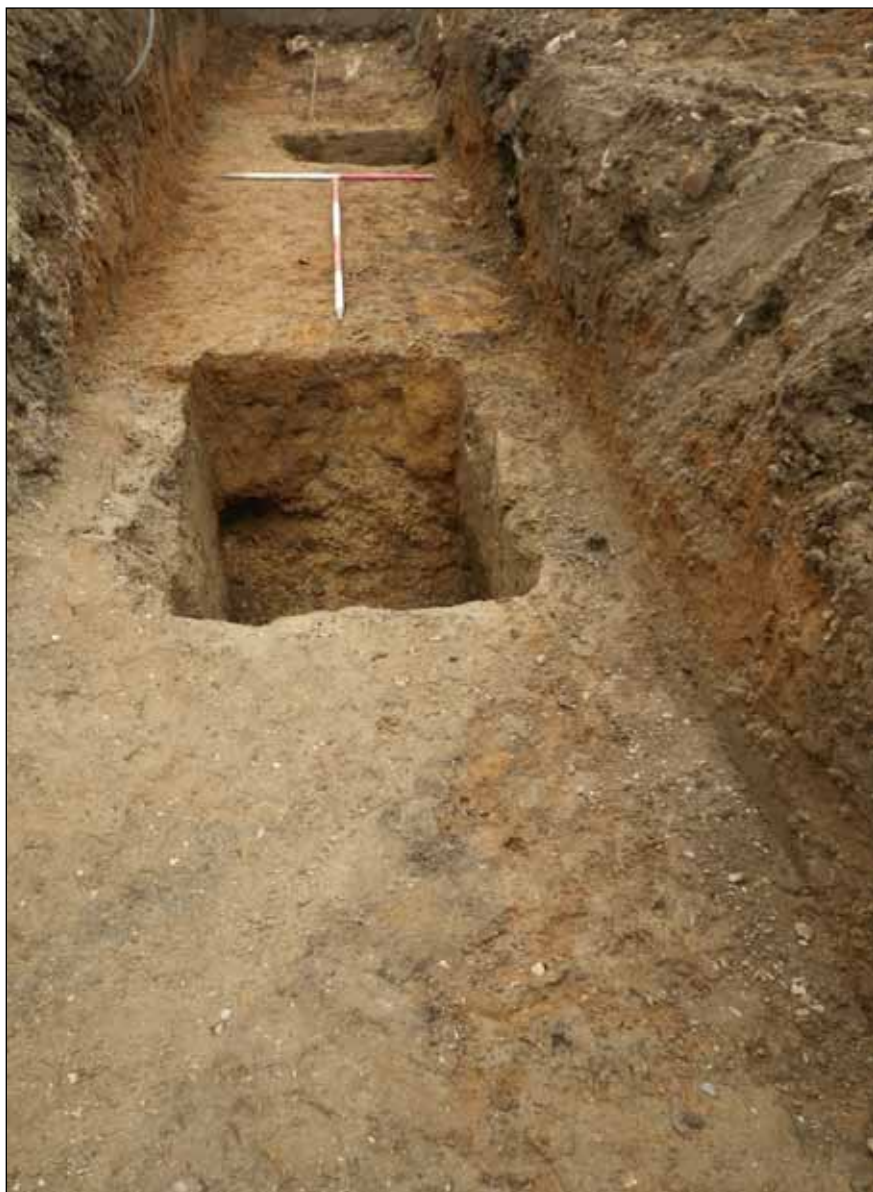
Plate 5: Trench 3 from the north-west