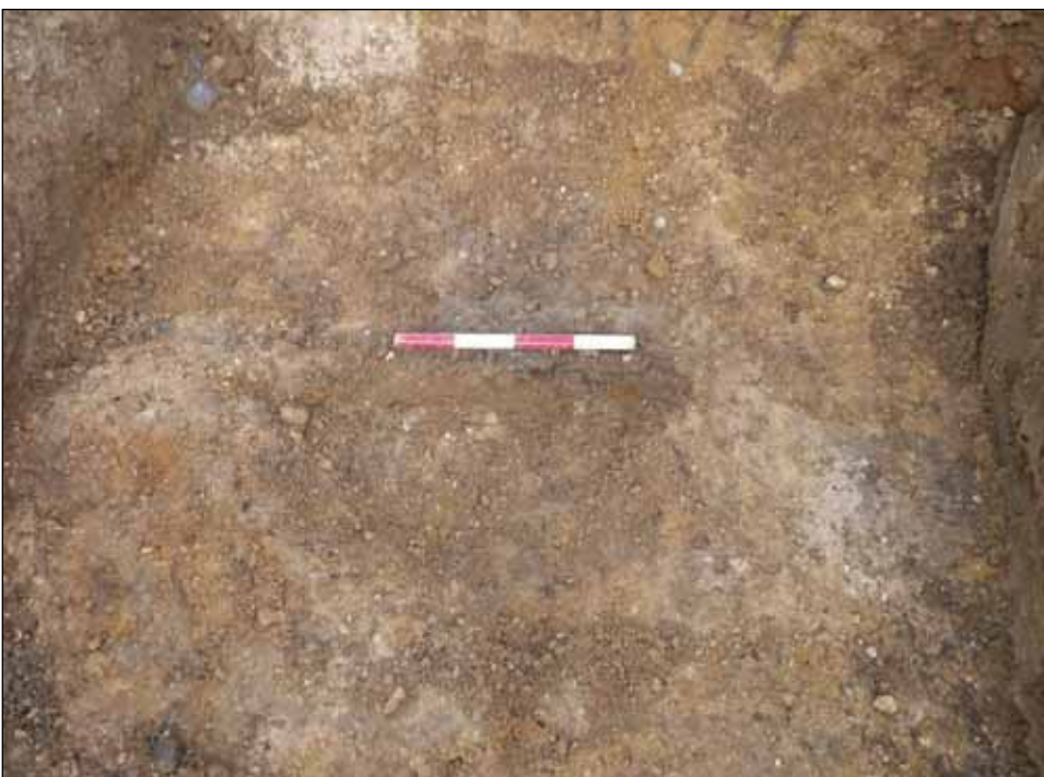
Plate 2: Pit 4 from the east