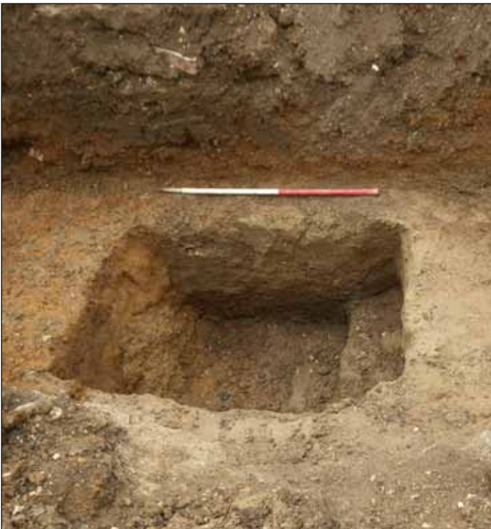
Plate 4: Pit 8 from the north