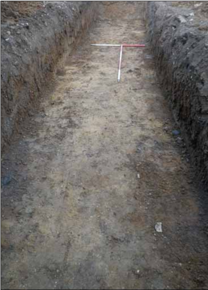
Plate 3: Trench 2 from the north-east