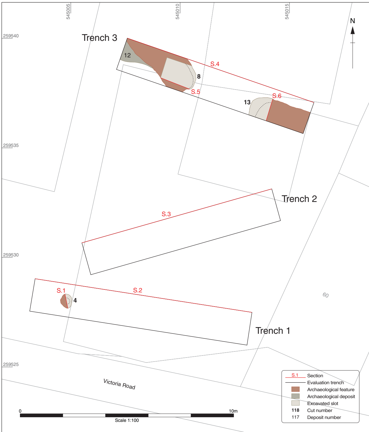
Figure 2: Trench plans