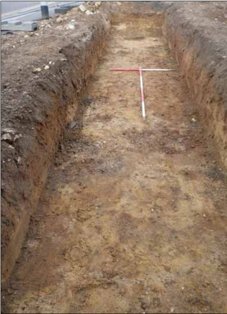
Plate 1: Trench 1 from the east