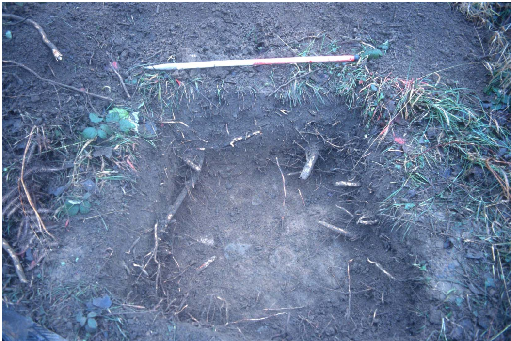
Plate 2: Test Pit 4, post-excavation