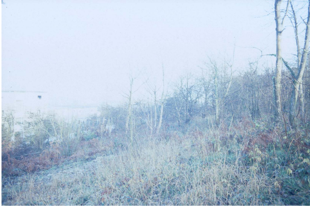
Plate 1: The wooded slope on which the evaluation took place, looking east