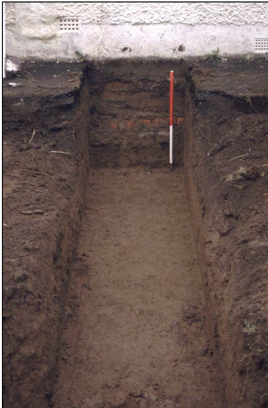
Plate 2: West-facing section of Trench 4, abutting the wall of The Limes