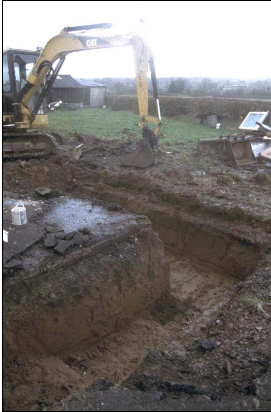
Plate 1: Trenches 1 and 2, looking north-west