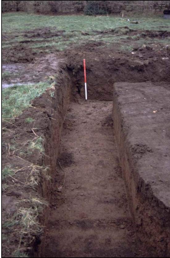
Plate 3: South-facing section of Trench 3, looking north