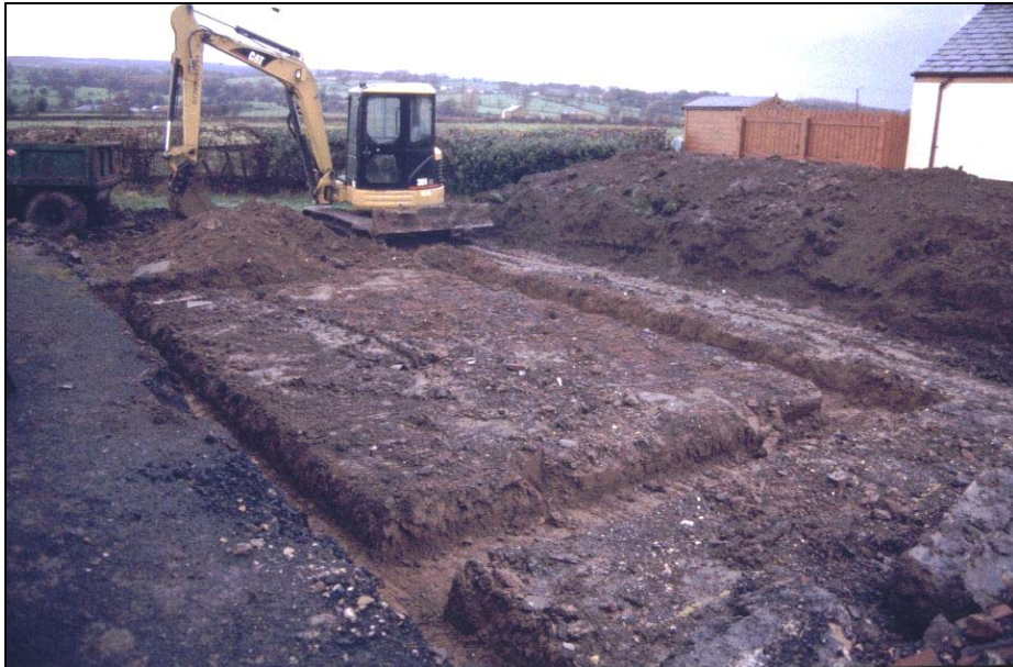
Plate 4: Foundation trench for garage, looking north-east