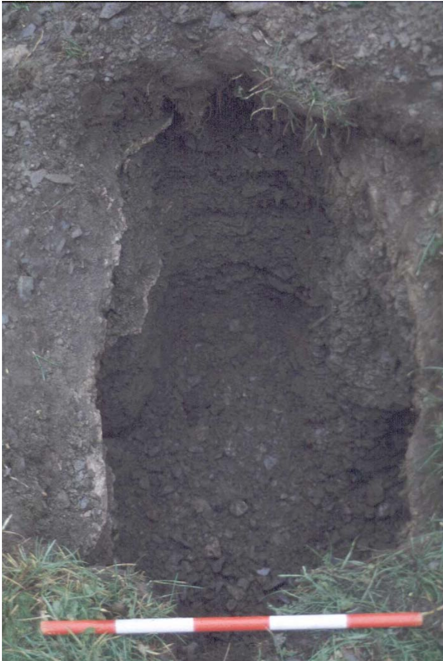
Plate 1: Test pit 1, facing-west