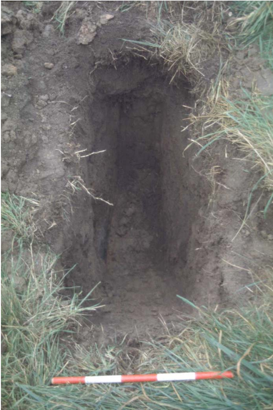
Plate 2: Test pit 2, facing-west