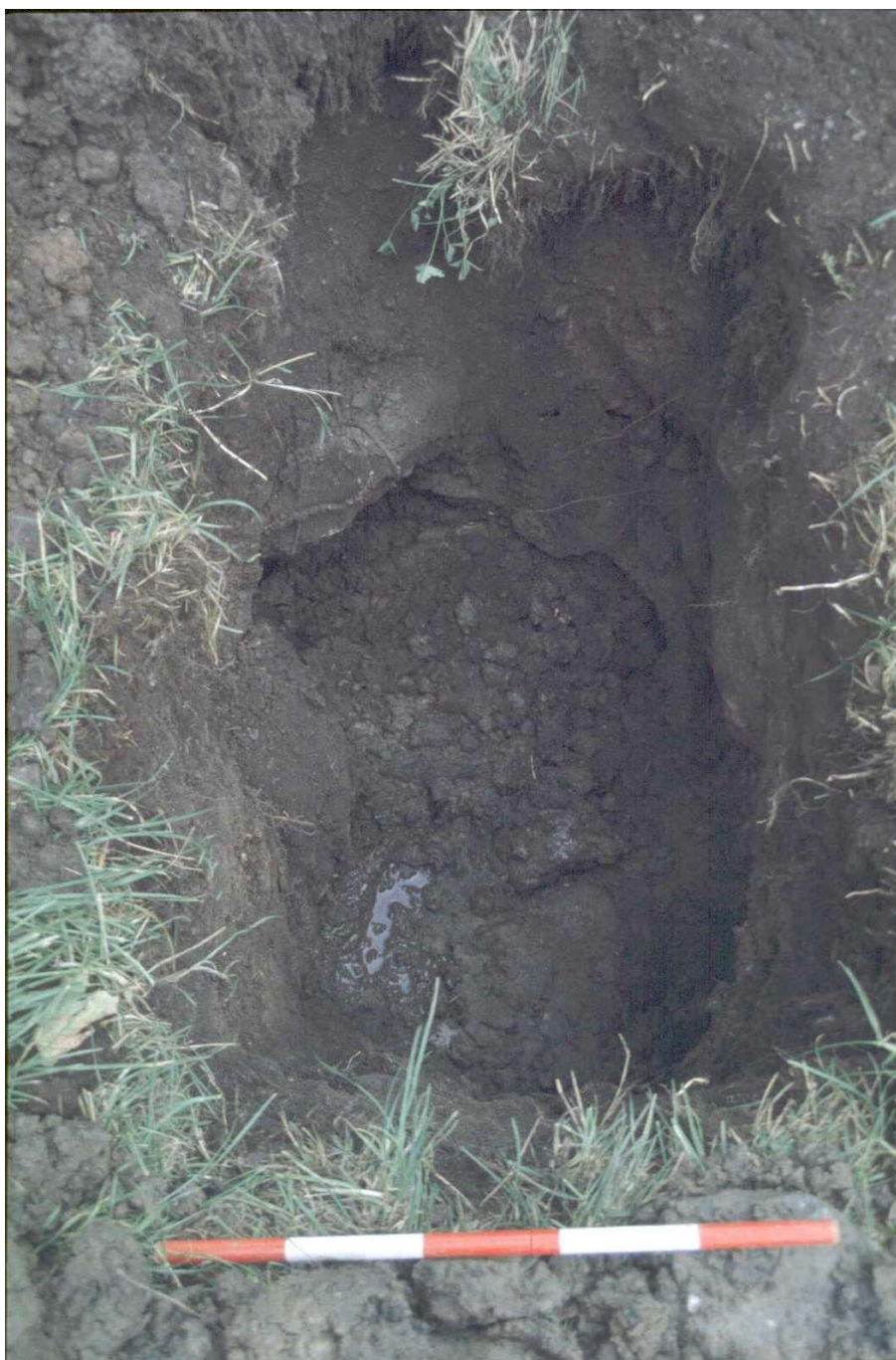
Plate 3: Test pit 3, facing-east.