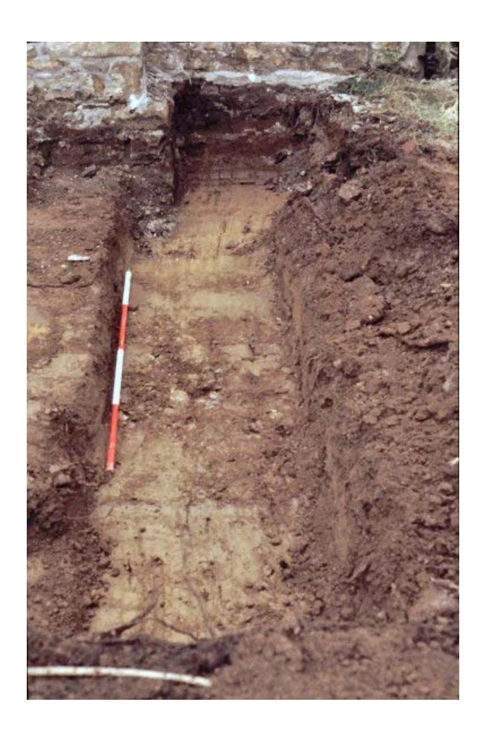
Plate 3: Trench 3 facing east