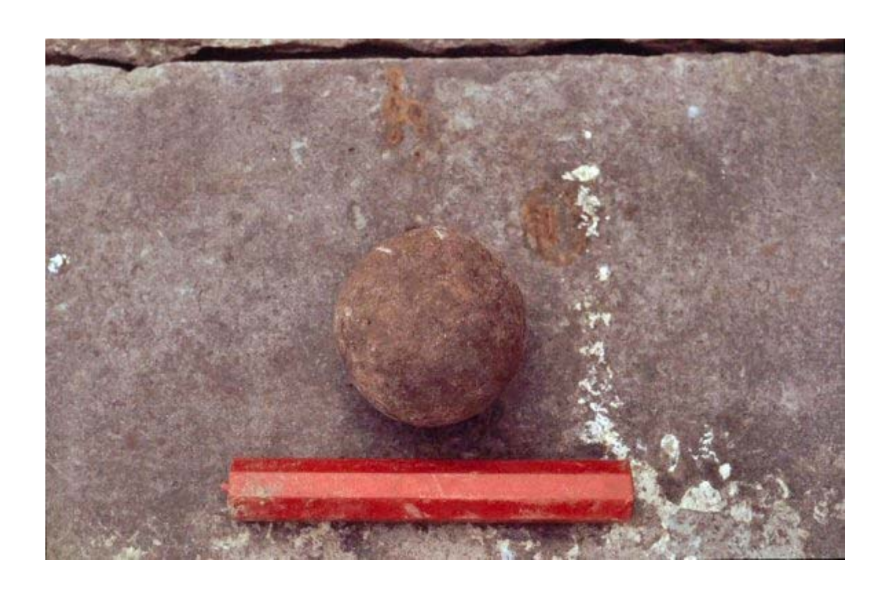
Plate 4 : Stone Sphere, 0.2m scale