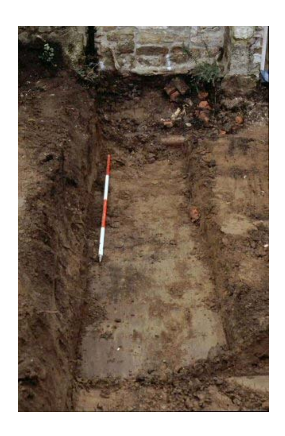
Plate 1 : Trench 1 facing east