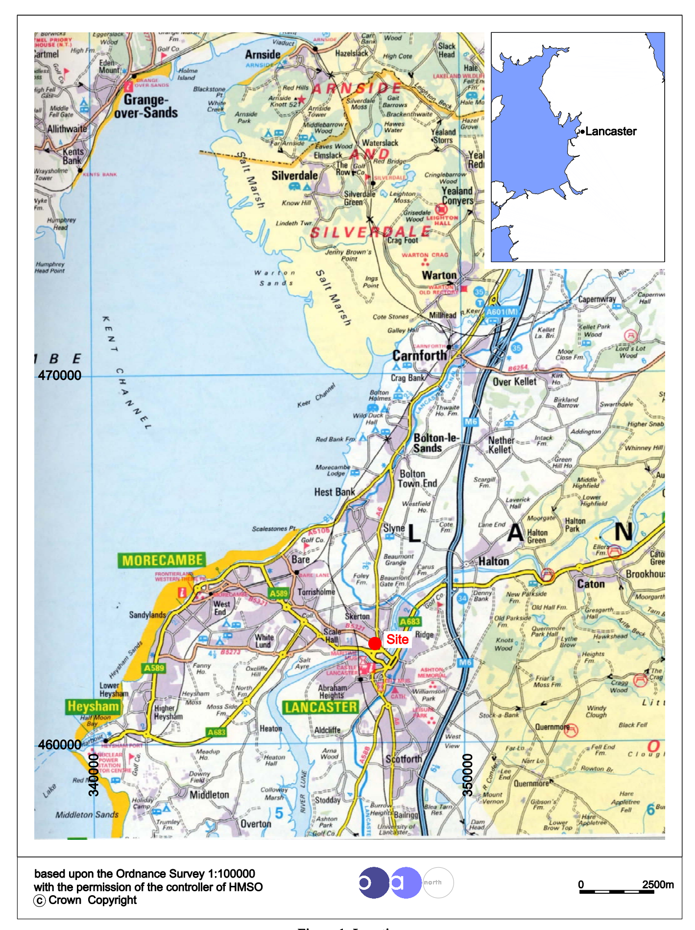
Figure 1: Location map