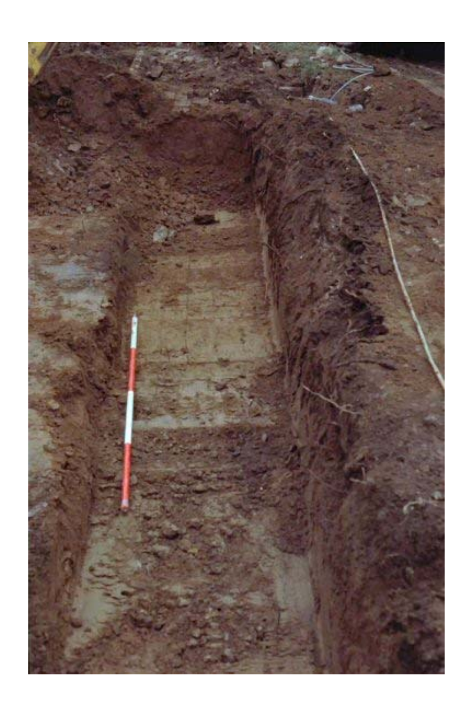
Plate 2: Trench 2 facing south