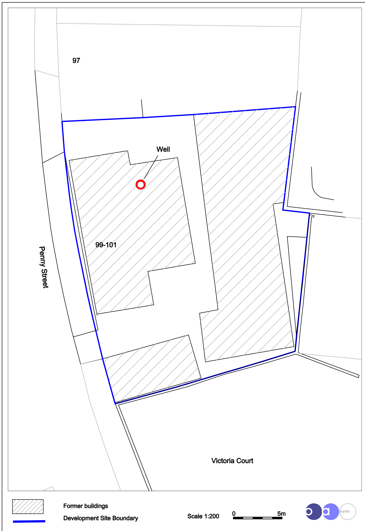
Figure 2 : Location of Watching Brief