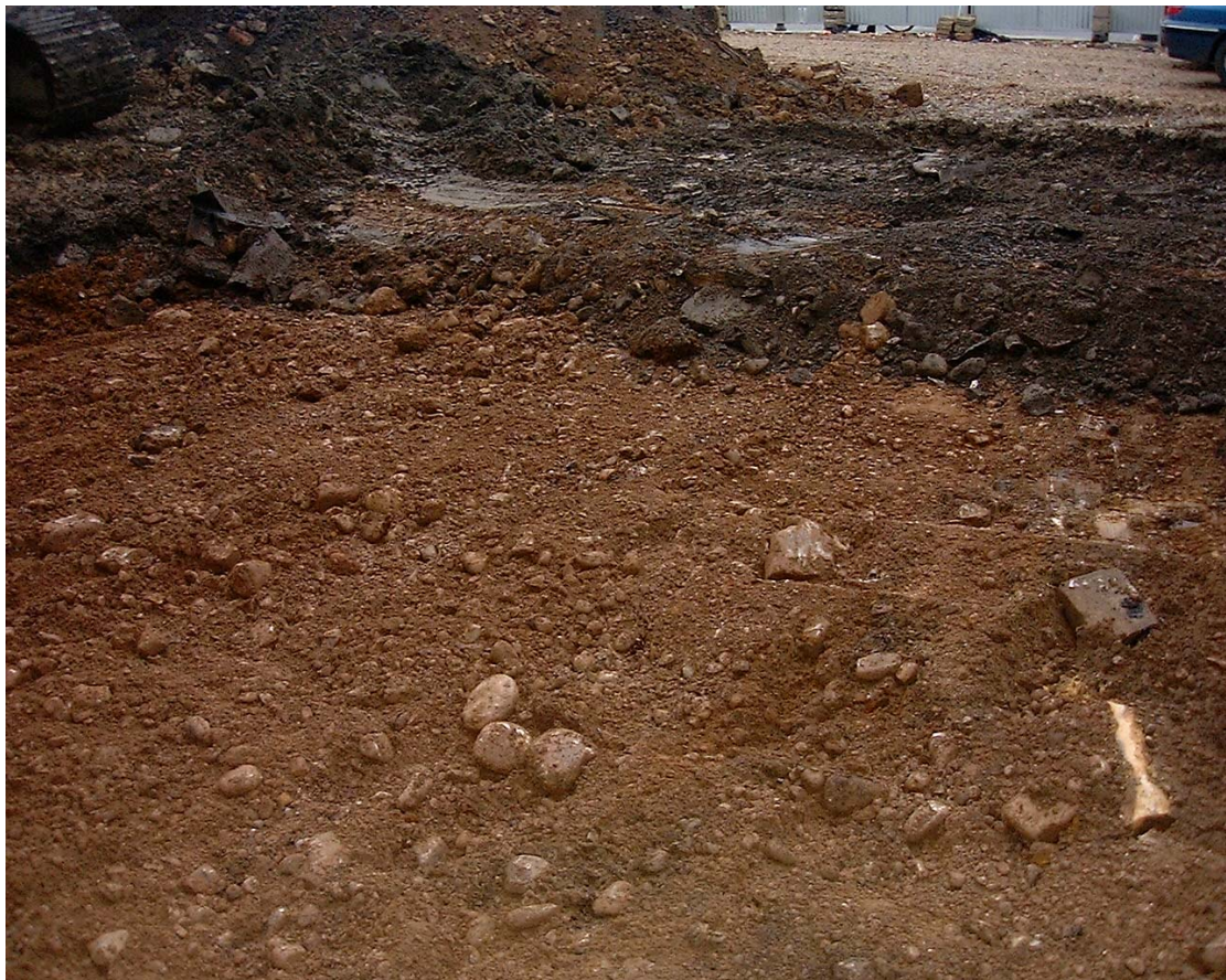
Plate 2: Exposed natural, facing west towards Penny Street