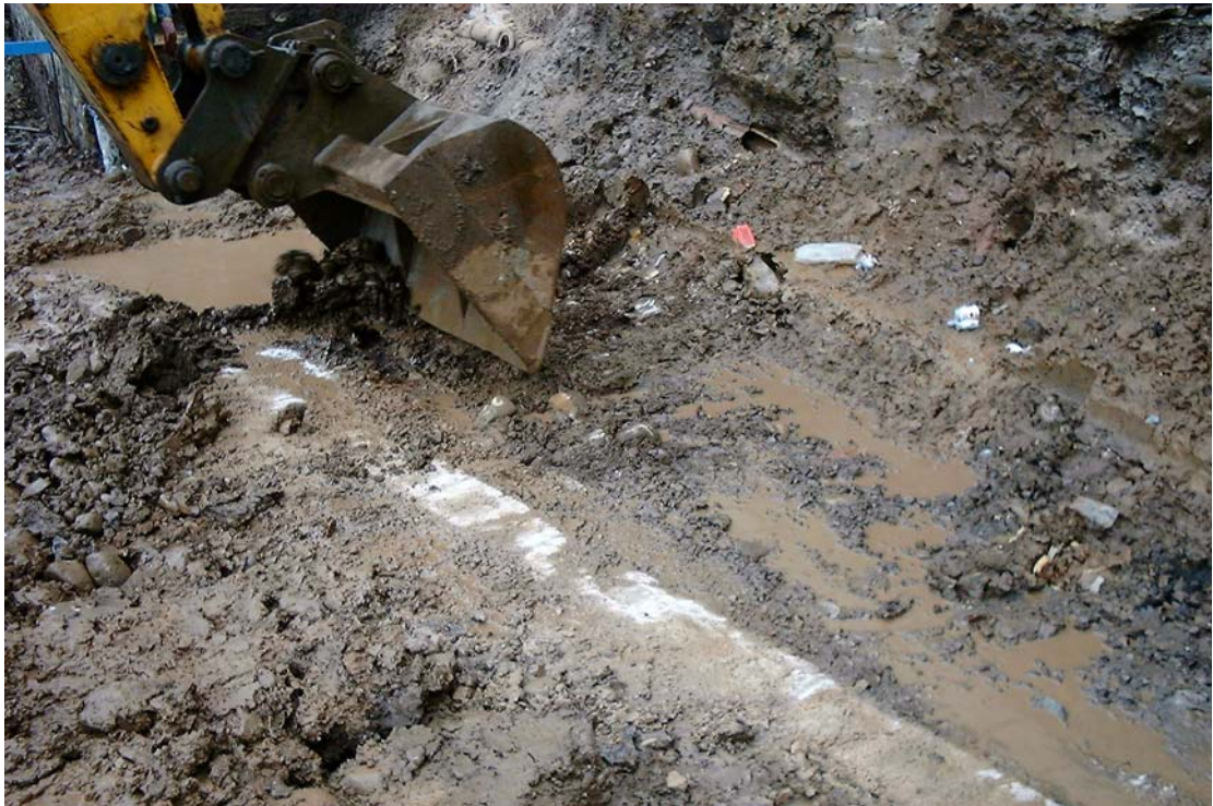
Plate 1: Excavations in progress at the eastern end of the development area