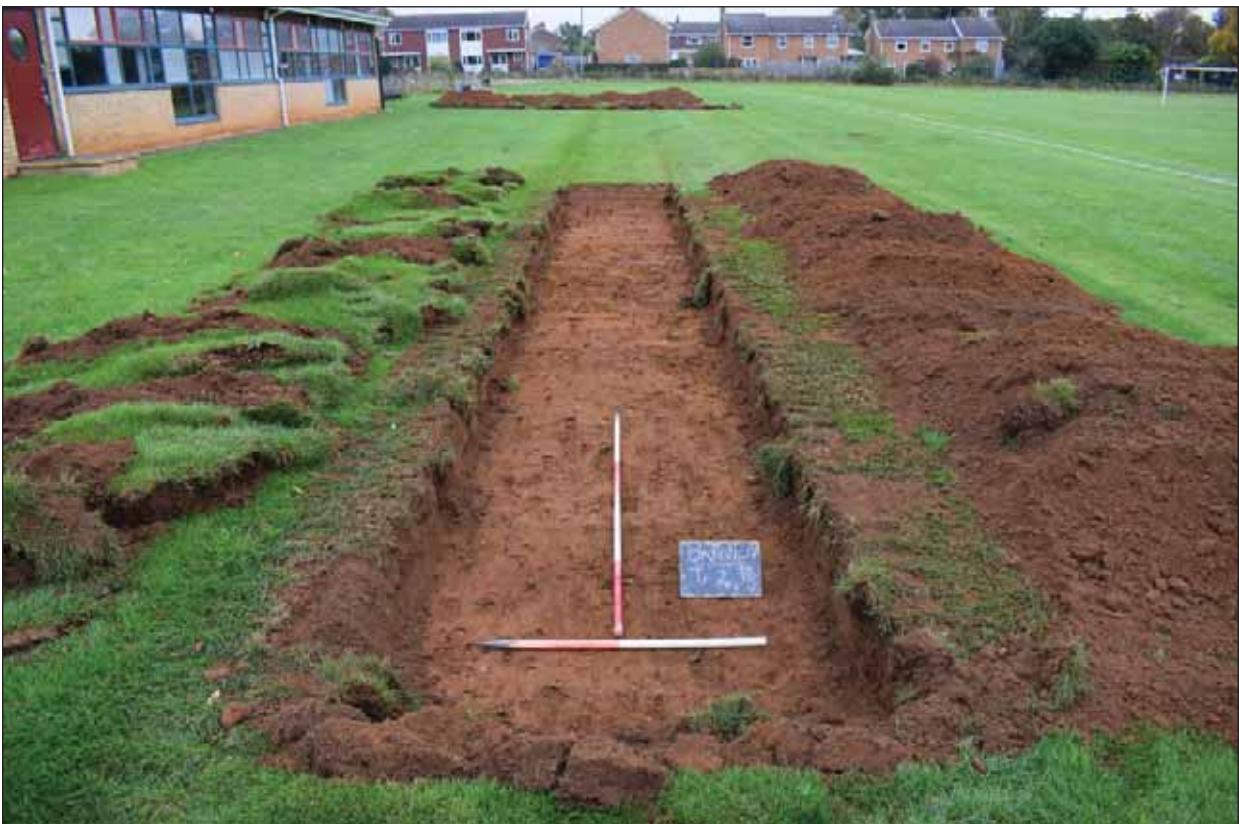
Plate 2: Trench 2 from south