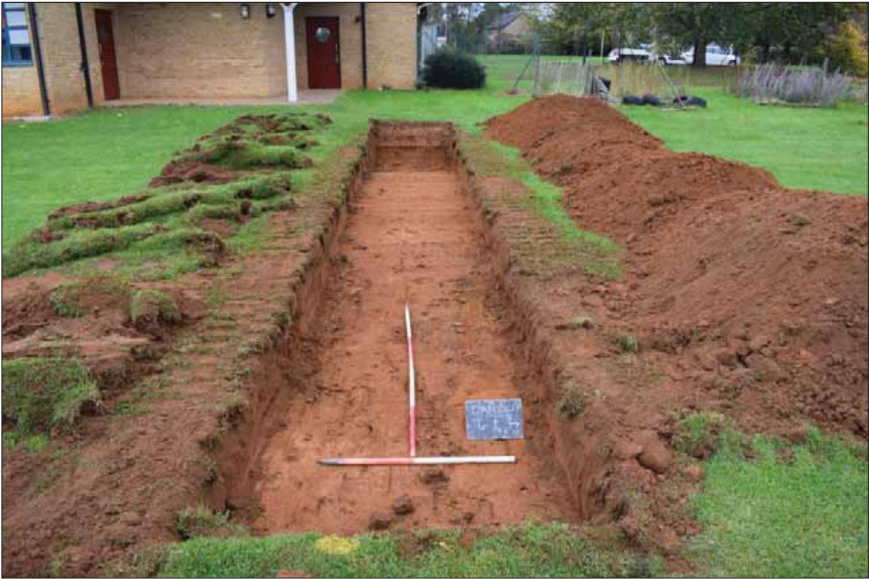
Plate 1: Trench 1 from east