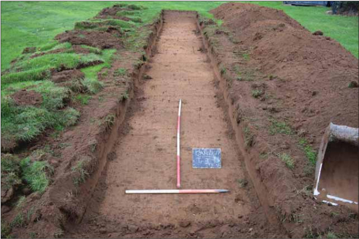
Plate 3: Trench 3 from north-east