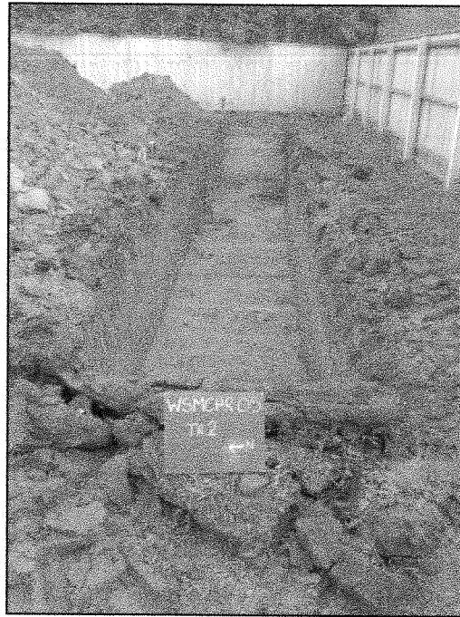
Plate 2 Trench 2 viewed from the west

A possible channel was also noticed (feature 17) aligned south-east to north-west. This feature, however, was not clearly defined and may be natural. It was undated.