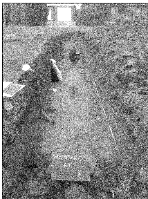
Plate 1 Trench 1 viewed from the south

The only archaeological feature discovered was an irregular channel (feature 19), aligned east to west, cut through all the layers of built up silt. This was dated by finds to the seventeenth century.