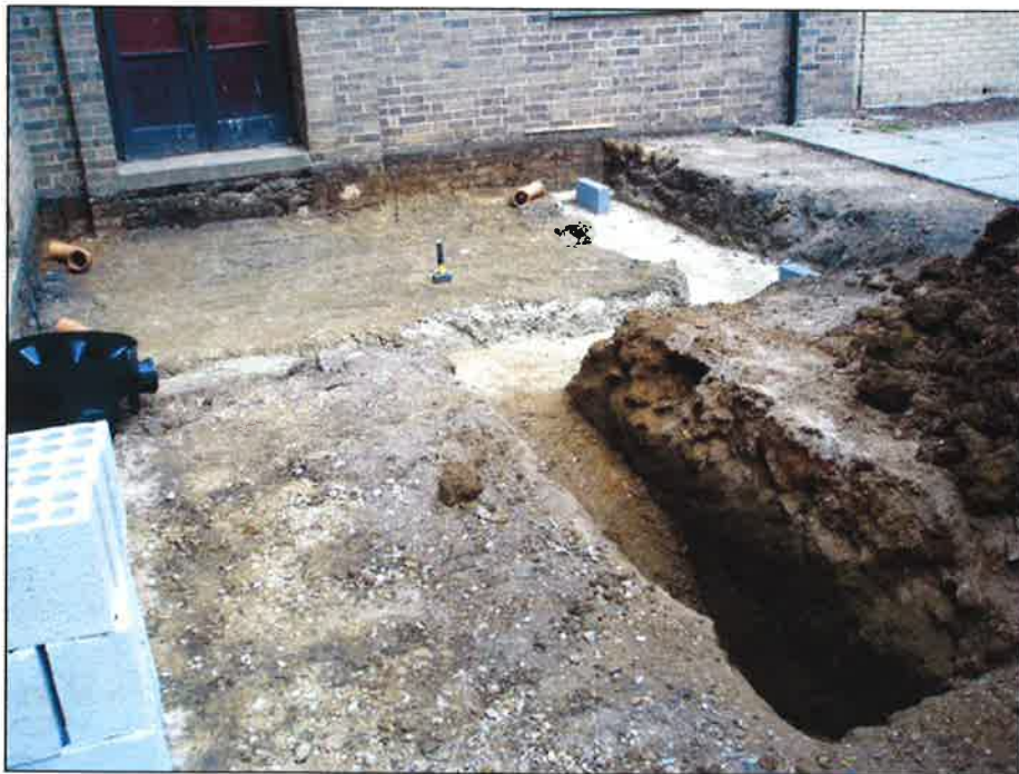
Plate 2: Development area