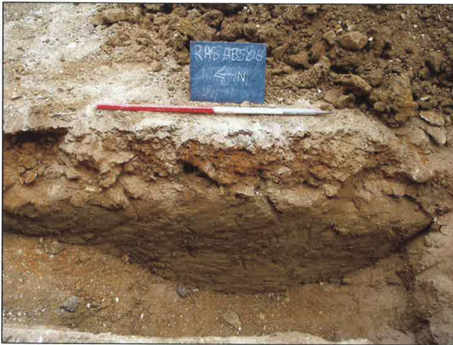
Plate 1: Section of Trench 3

the site. The deep layers that were observed within the trenches were also discovered during the 1998 excavation only 50m away from the current development area. The deep overburden was then interpreted as sub garden soils. Macaulay (1998) also noted an organically rich area in the southern end of the 1998 excavation area which would be relatively close the current area of investigation.