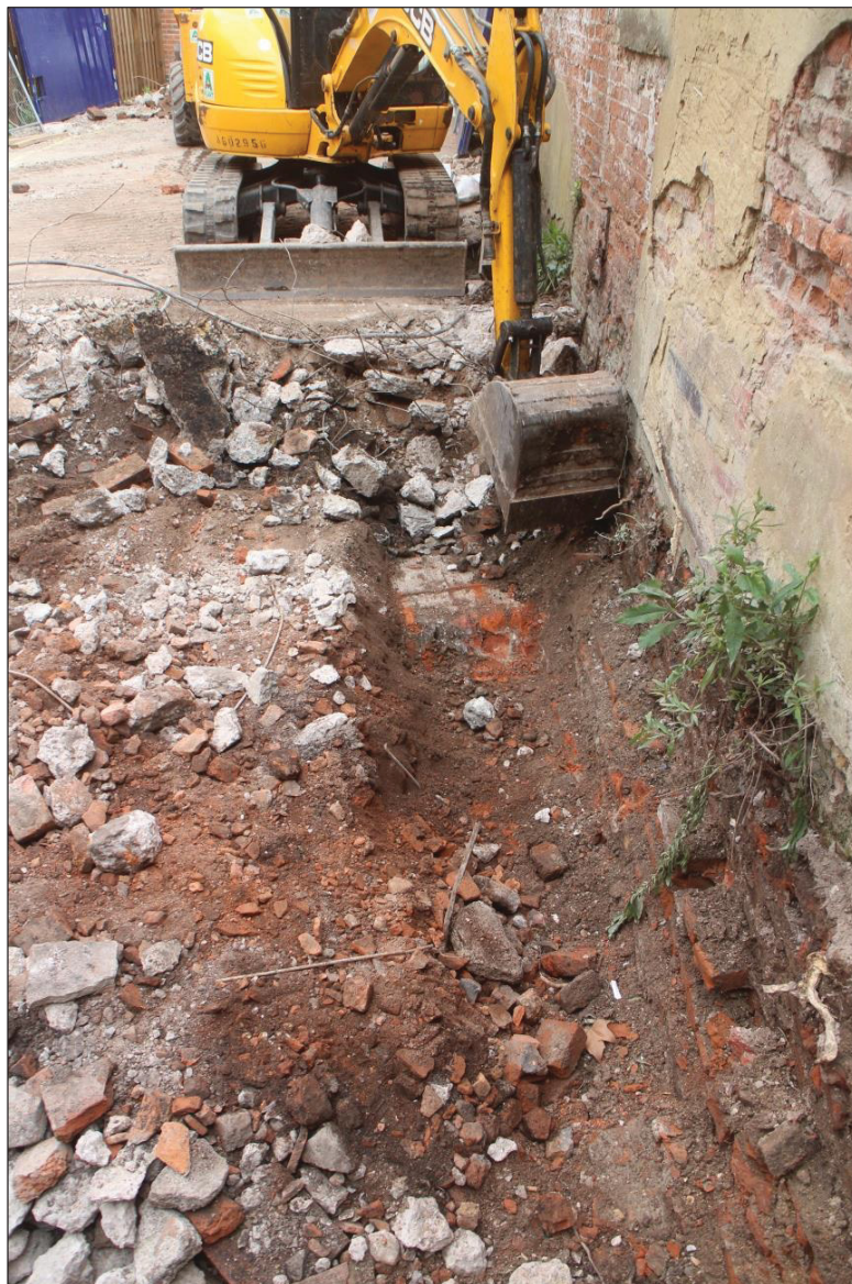
Plate 2: Wall 107 looking north-east