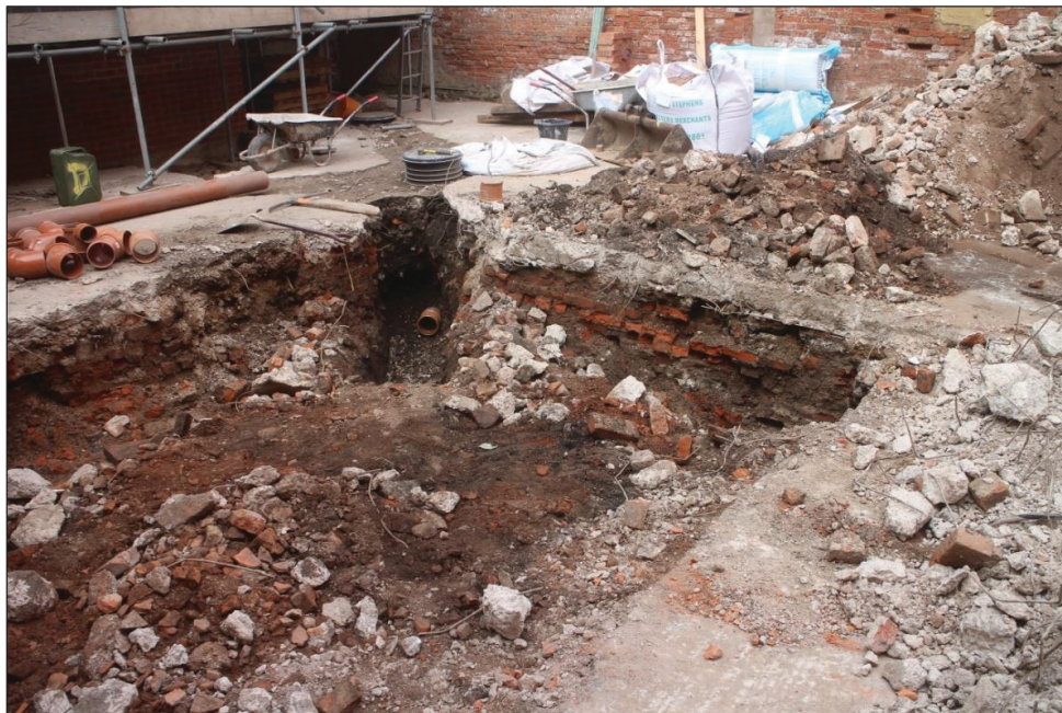
Plate 1: Walls 105 and 106 visible in the north-east and south-west facing sections, looking south-west

3.2.2 Five walls were identified during the monitoring works (Fig 2), all constructed from hand-made bricks and bonded with lime mortar. Four of them, 105 , 106 , 107 , and 108 , potentially forming a building in the southern part of the area, measuring 5.5m long by 5m wide. The building does not appear to correspond particularly well with the historic mapping (Fig 3), however, it is of similar proportions. The full width of walls 105 and 106 (Plate 1) was observed as two and a half bricks wide in the south-western corner of the potential building, where a drainage trench was excavated.