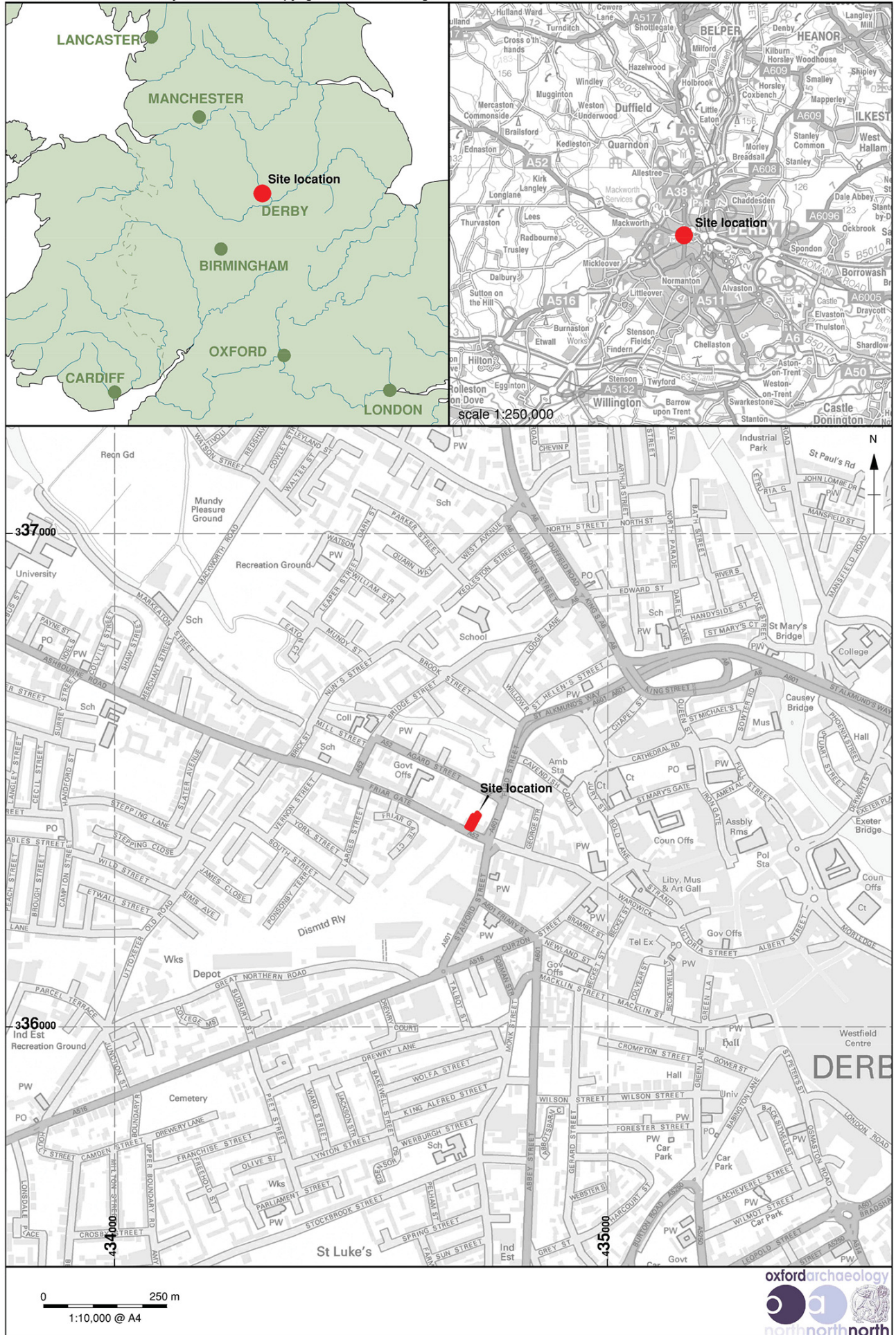
Figure 1: Site location