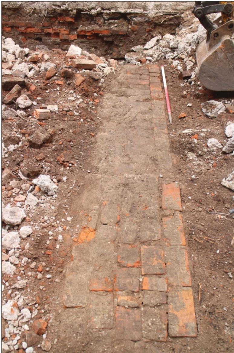
Plate 3: Wall 108 looking south-east

3.2.5 The final wall observed during the course of the watching brief, 109 , was located towards the northern end of the area. The wall extends across the width of the area and was a single brick wide. Wall 109 potentially relates to a building identified on the historic mapping at the northern end of the yard of 30 Friar Gate (Fig 3).