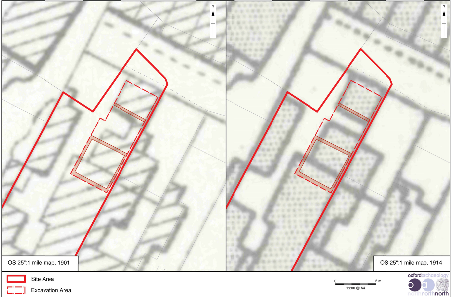
Figure 3: Plan of excavation area, superimposed on historic mapping