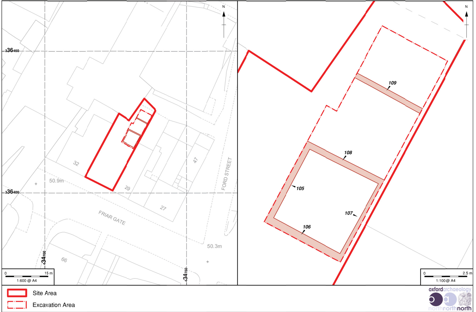
Figure 2: Plan of excavation area