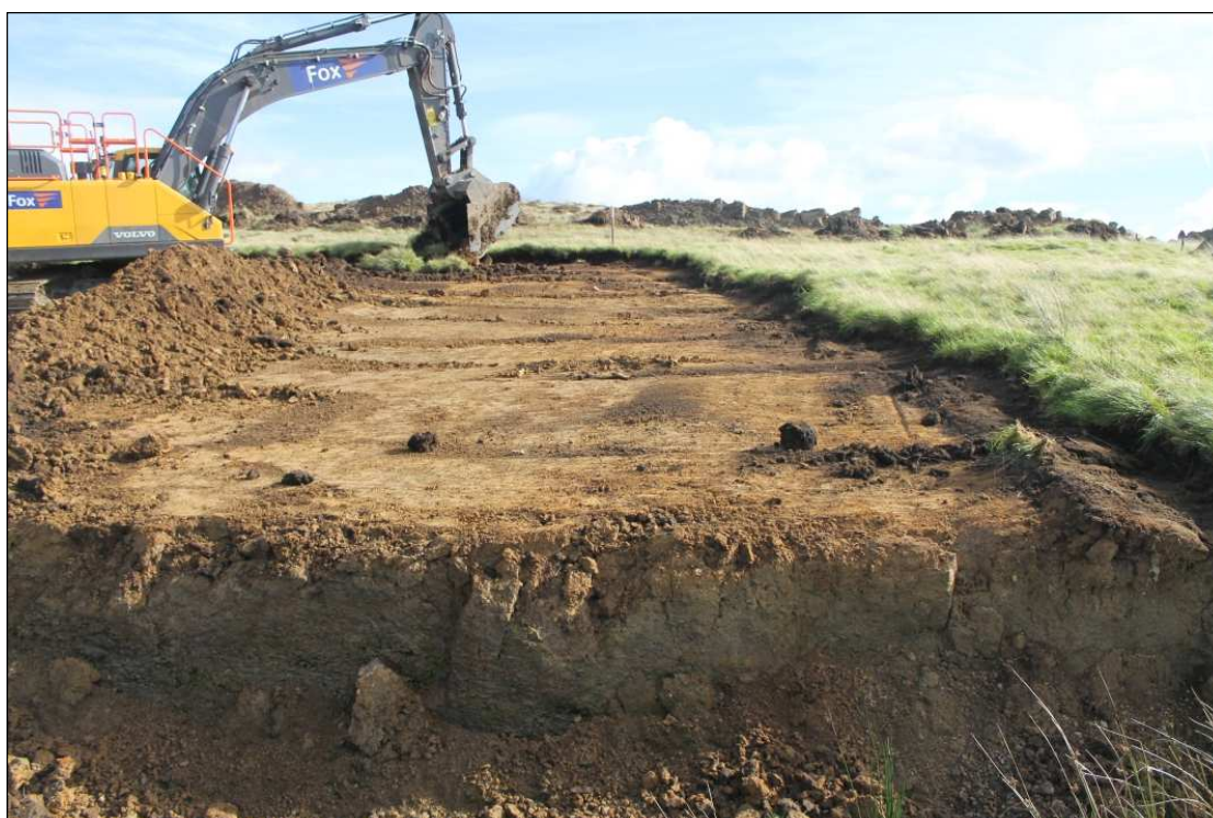
Plate 1: Working Shot of Topsoil Strip, looking north.

3.2.2 A ditch approximately 1m wide and 180m long was excavated parallel with the eastern edge to allow water runoff to divert into the quarry's drainage system. The depth of this ditch varied from 0.4m to a max depth of 1.8m along the highest contour.