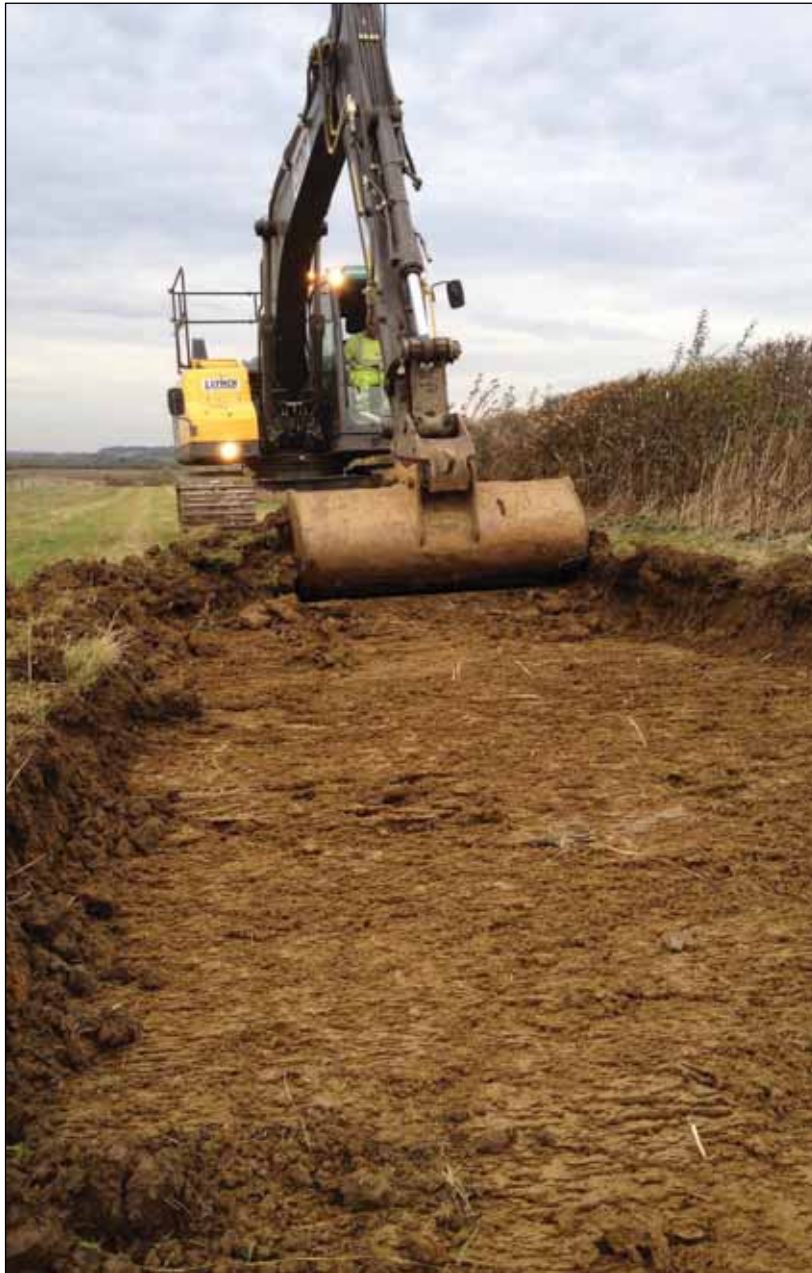
Plate 1: Machine stripping