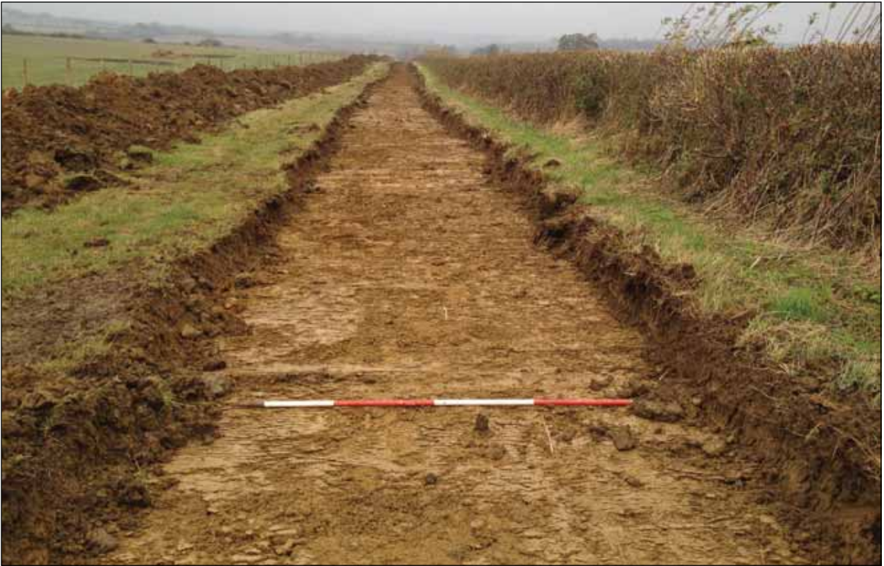
Plate 2: Pipeline route looking north from Halse