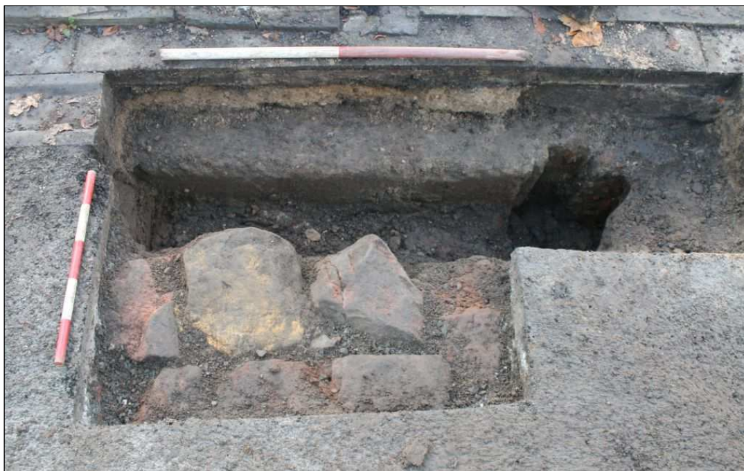
Plate 2: North-facing view of Test Pit 2