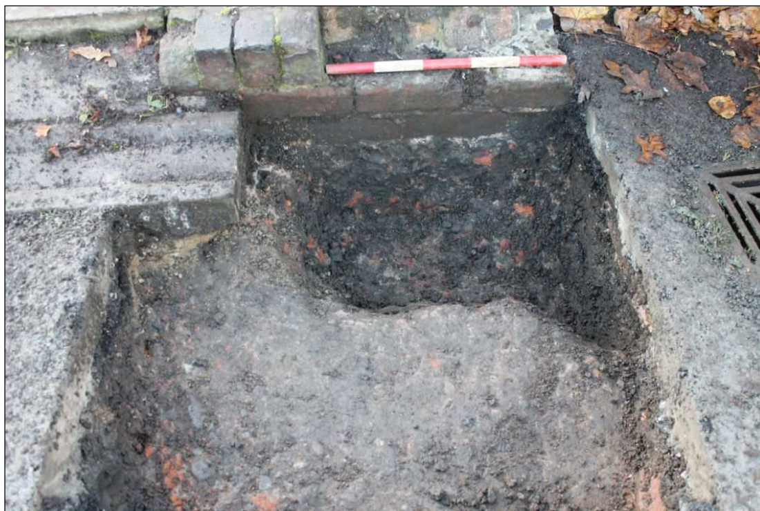
Plate 1: North-facing view of Test Pit 1