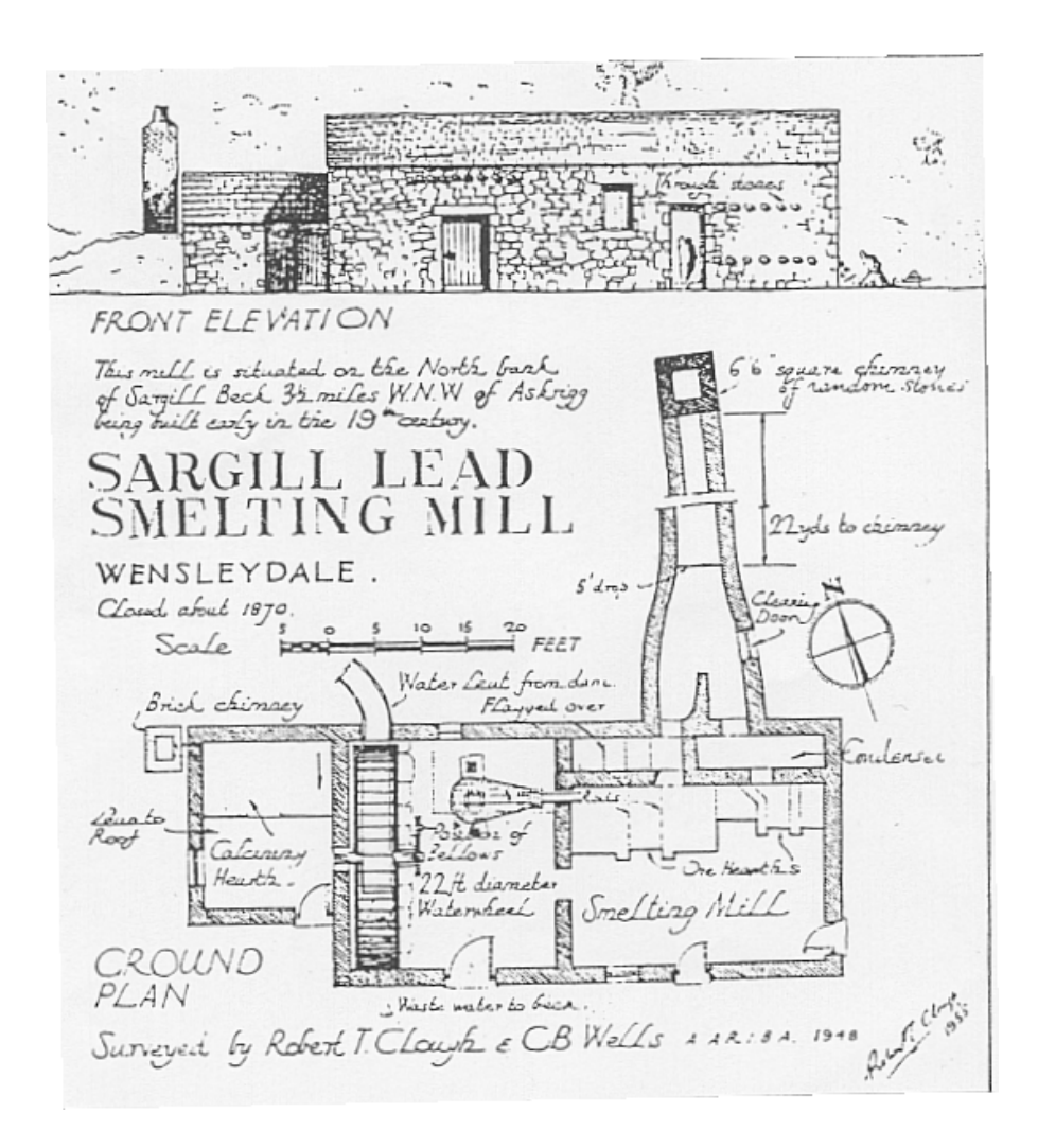
Fig 3 Smelt Mill Plan surveyed 1948 (after Clough 1962)