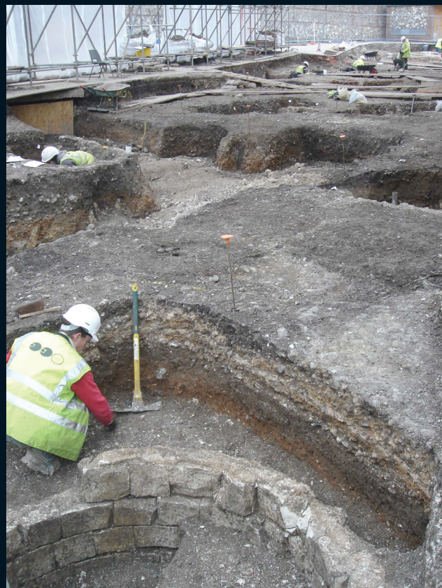
Winchester Discovery Centre: Robin Bashford cleans up a section showing successive layers of the principal N-S Roman street revealed during excavation of a 12th century well.

The adjacent excavations at Northgate House and the Discovery Centre (former Winchester Library) together form one of the largest archaeological investigations in Winchester in the last 20 years. Located in the NW corner of the historic city centre, on the east-facing slope overlooking the river Itchen, the sites revealed evidence of over 2600 years of Winchester's development. Significant structural, artefactual and environmental evidence was recovered from all the major phases of occupation: the Iron Age oppidum of Oram's Arbour, housing, infrastructure and industry from Roman Venta Belgarum , the resettlement of the area under the late Saxons, and the development of the urban manor of the Archdeacons of Winchester in the 13th century. The results from the late Saxon period are particularly significant. A substantial scientific dating programme reported in this volume suggests reoccupation of the area can be dated to the period c AD 840-880 and it was quickly built up into a densely settled artisan quarter. Major studies of the associated finds and remains of plants, fish and animals are summarised in this volume and reported in full on the accompanying CD-Rom.