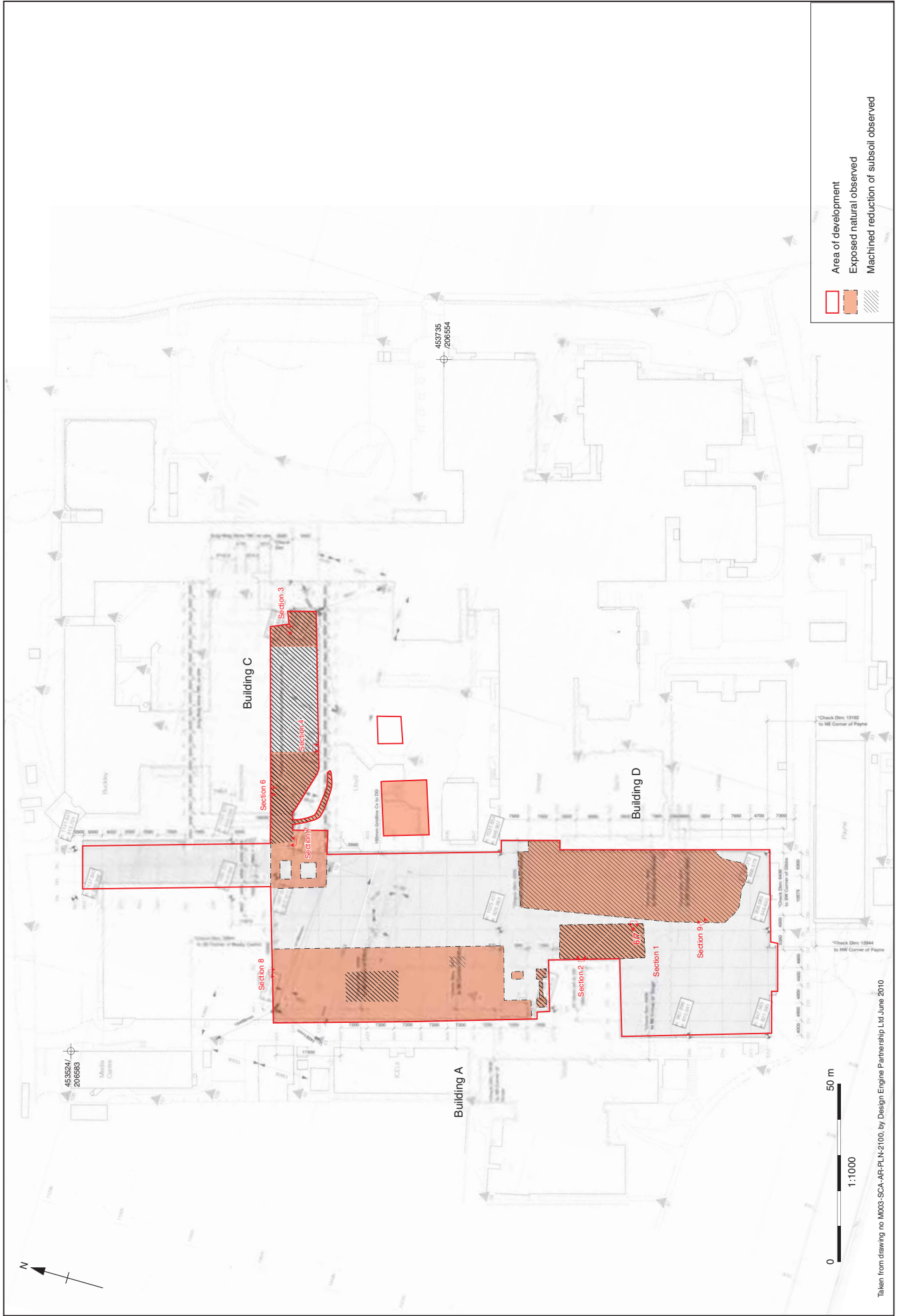
Figure 2: Plan of Monitoring Location