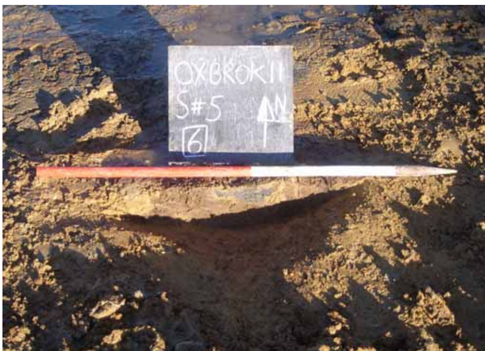
'Soil anomaly' context 6 and 7.