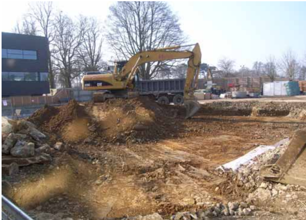
Brackley Sands being exposed