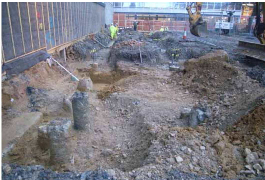
Building C: subsoil being mechanically reduced – natural sands exposed in ground beam and pile cap excavations, as well as profiles of both natural and subsoil being revealed