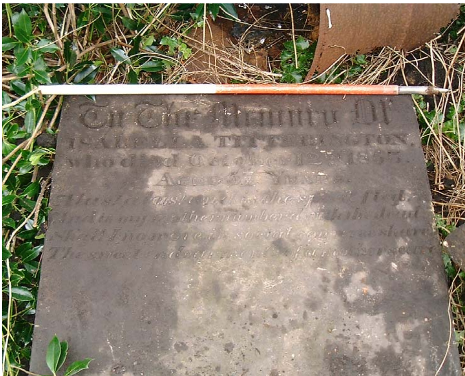
Plate 2: Grave slab 1