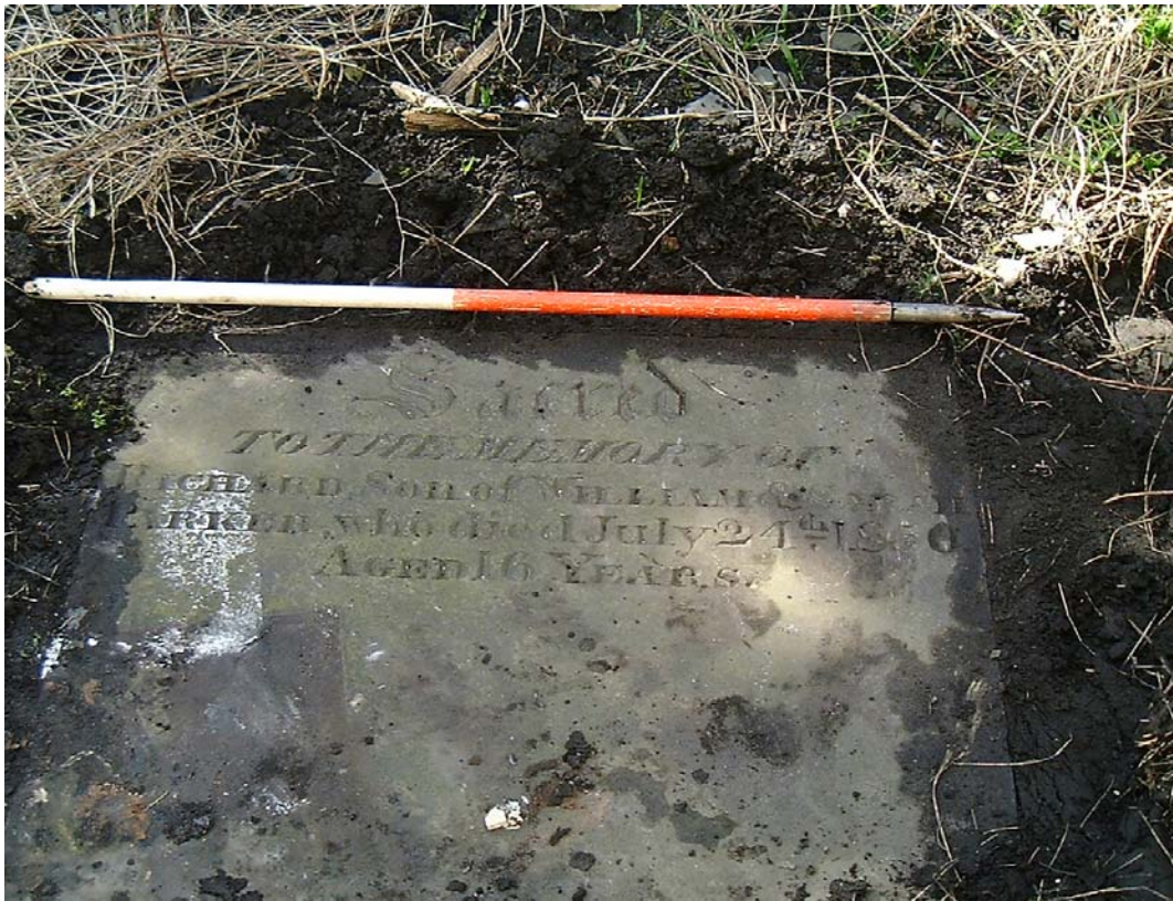
Plate 5: Grave slab 4