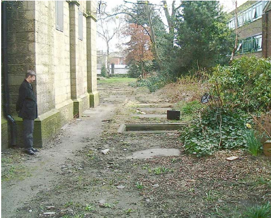
Plate 1: The area of the grave excavation, looking south