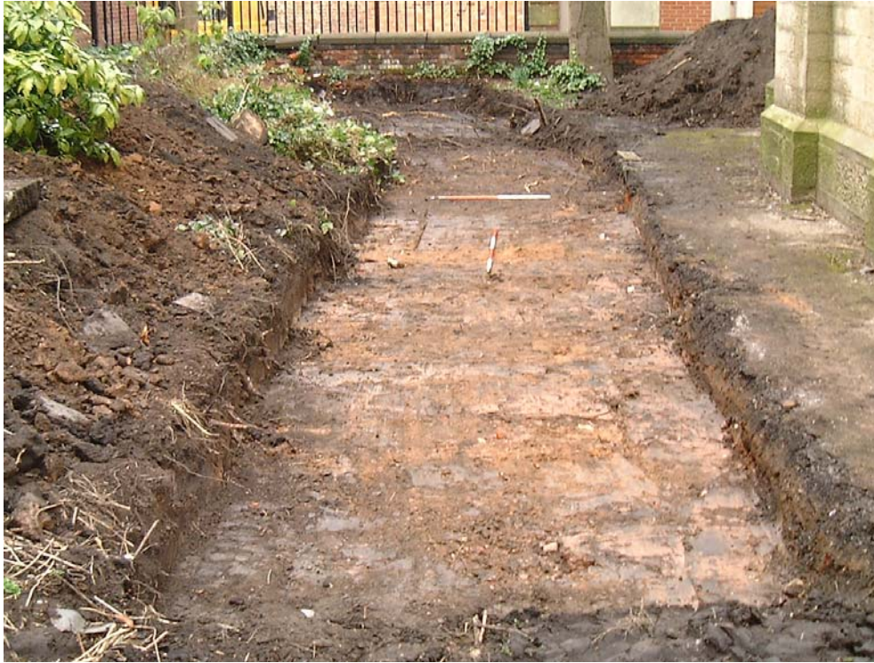
Plate 7: Study area, looking north, after the topsoil strip