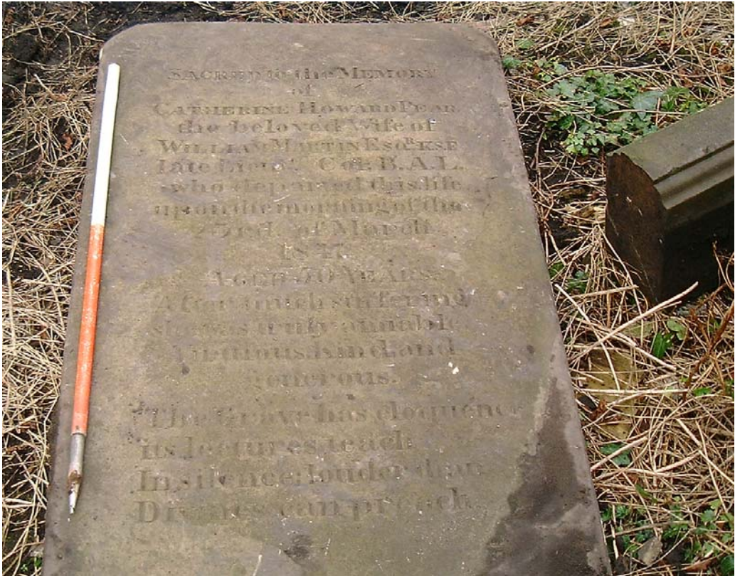
Plate 3: Grave slab 2