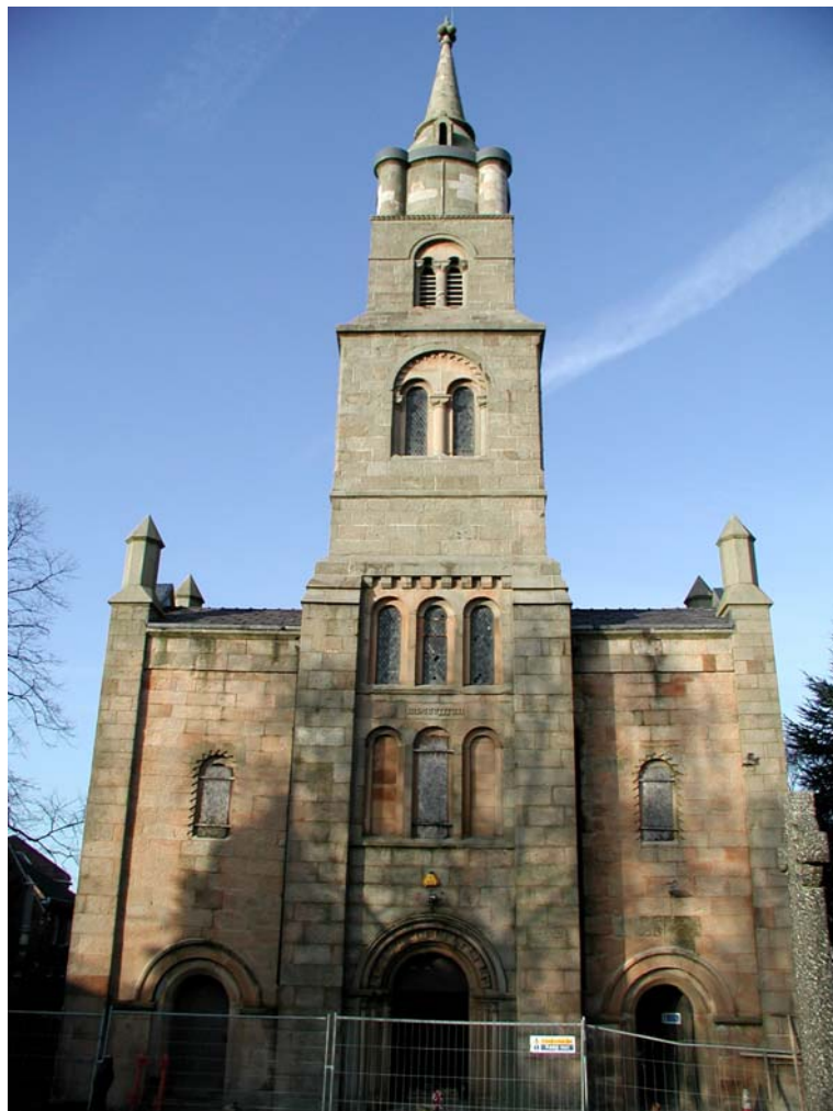
Plate 8: Front façade of St Mary's Church, facing south