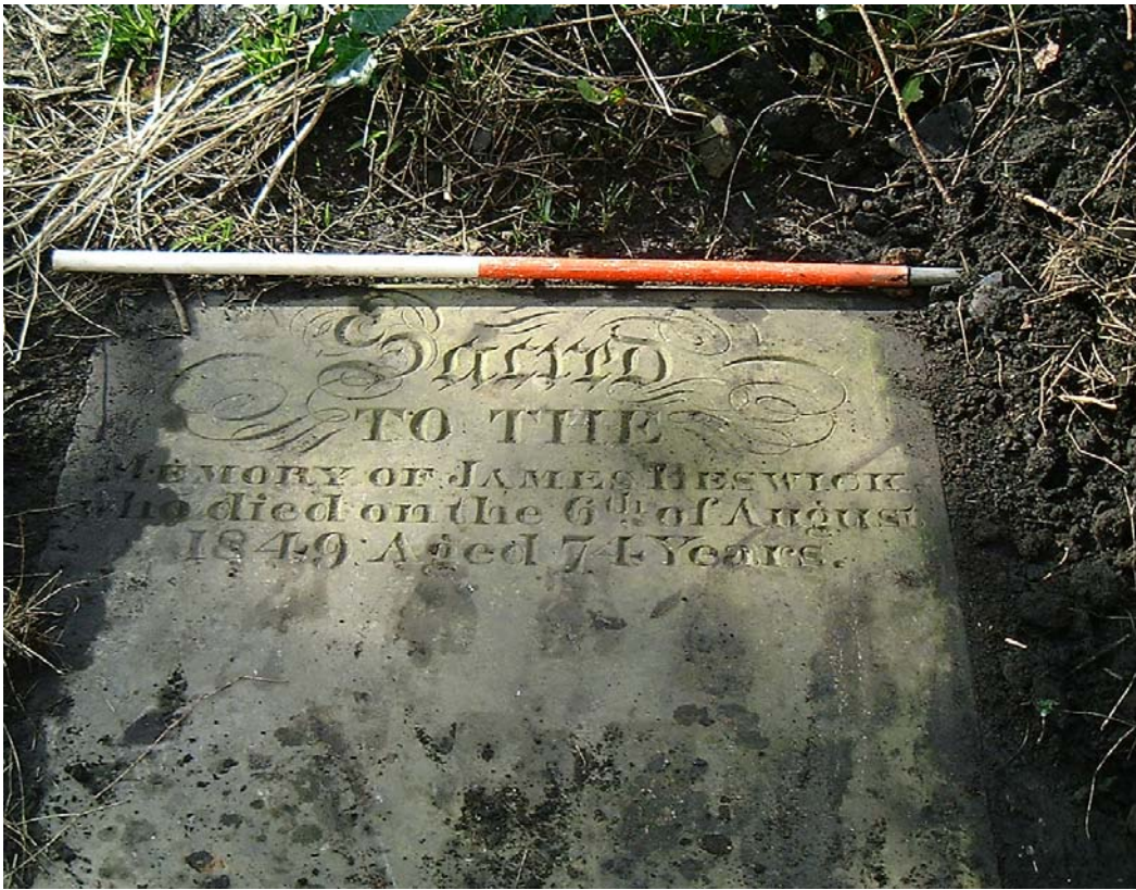
Plate 4: Grave slab 3