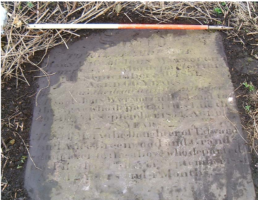
Plate 6: Grave slab 5