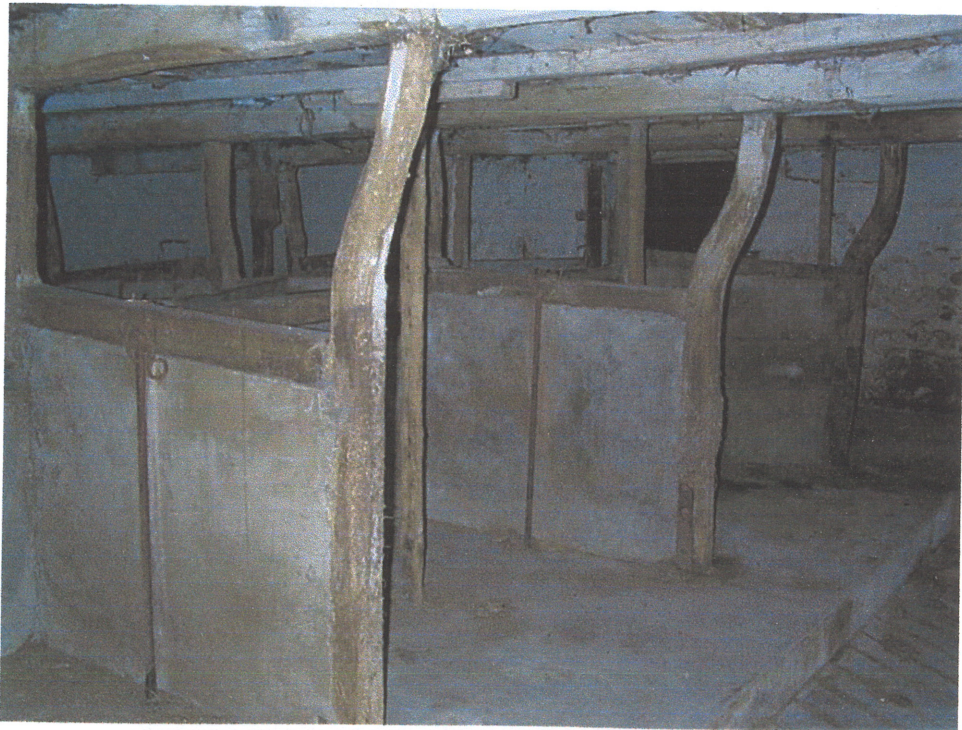
Plate 2 Cattle stalls within the western end of the barn