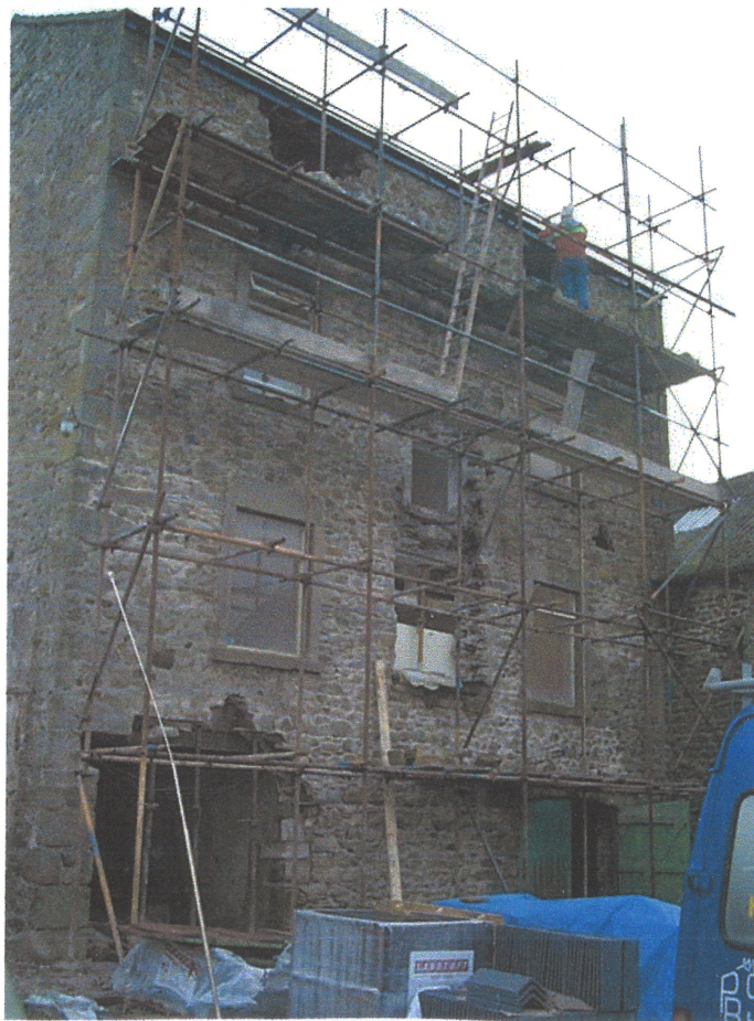
Plate 4 Western external elevation of the farmhouse