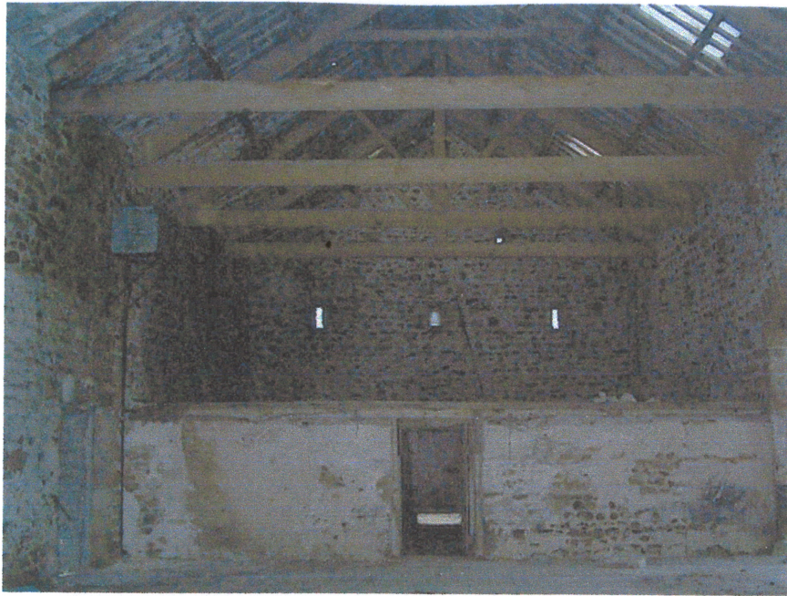
Plate 3 Eastern interior of the barn