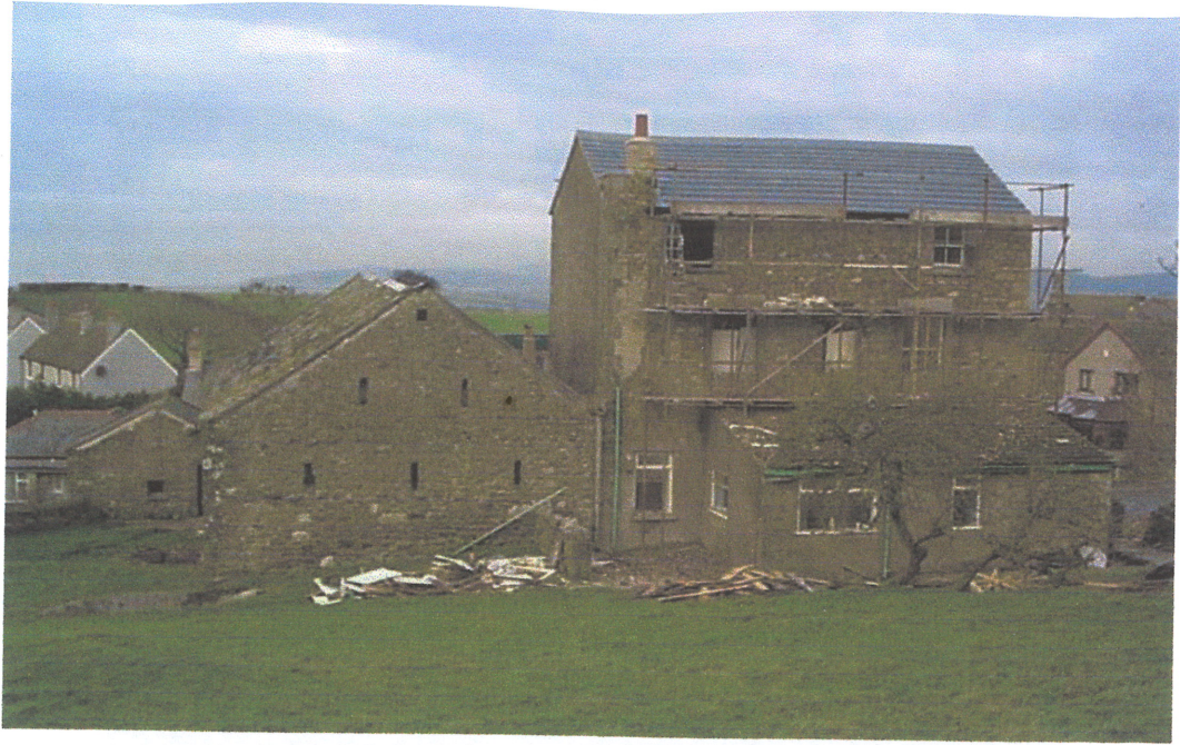
Plate 1 Cottage and Barn exteriors looking north-west