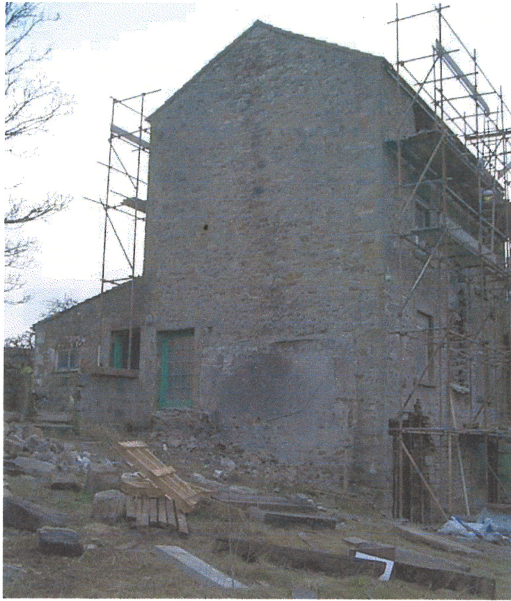
Plate 5 Northern external gable elevation of the farmhouse