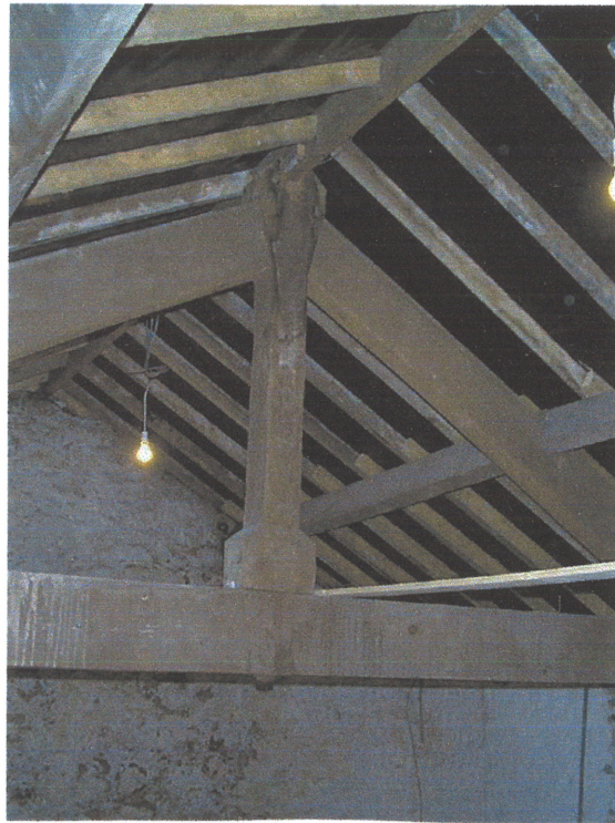
Plate 6 Kingpost truss within the farmhouse