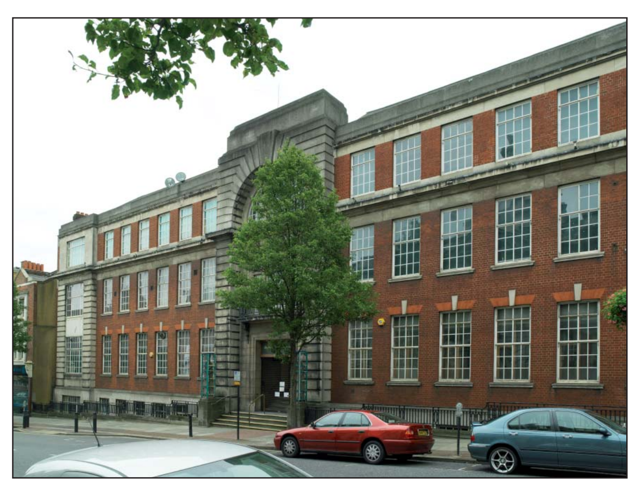
Plate 5: Block B