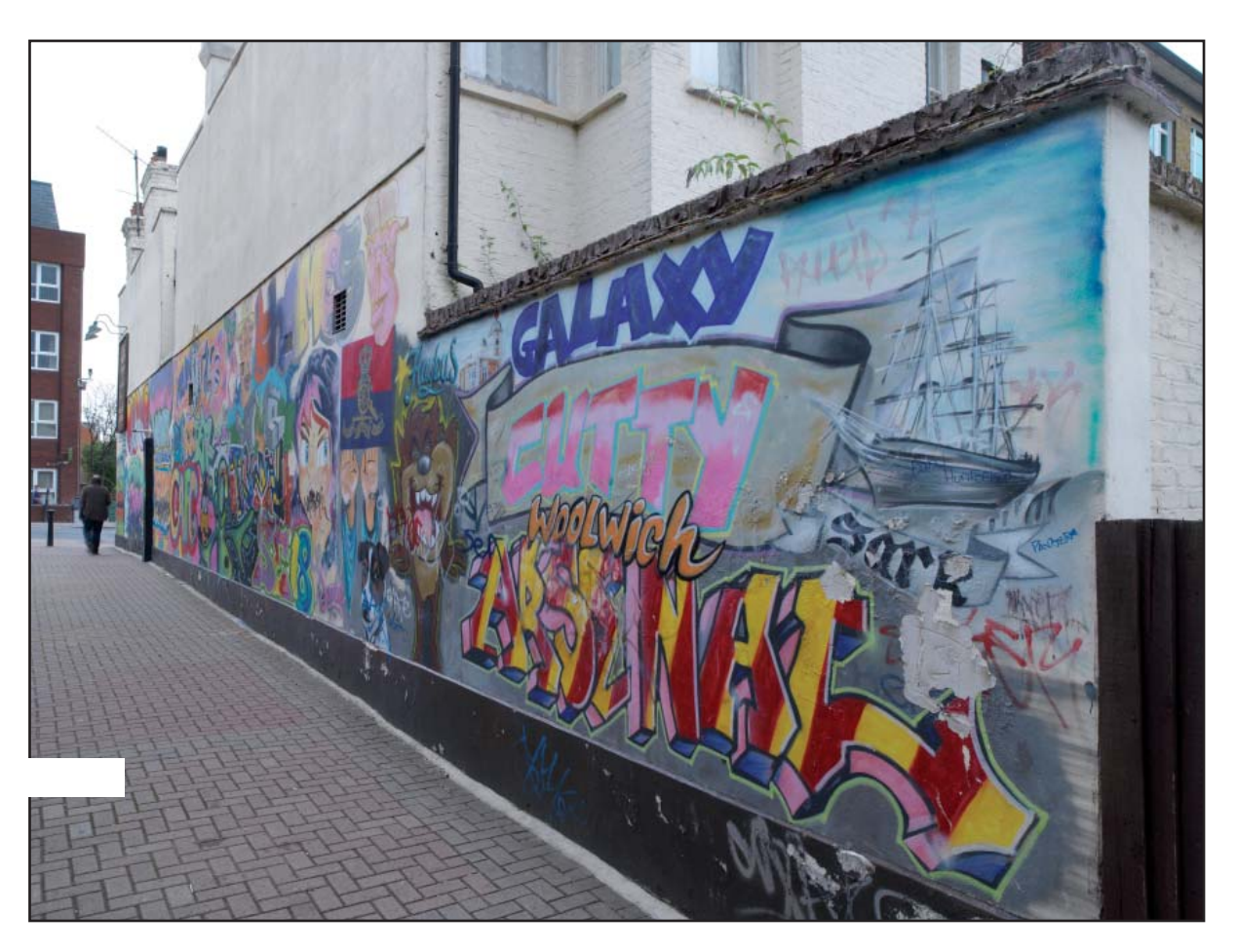
Plate 4: Street art to alleyway on west side of Block A