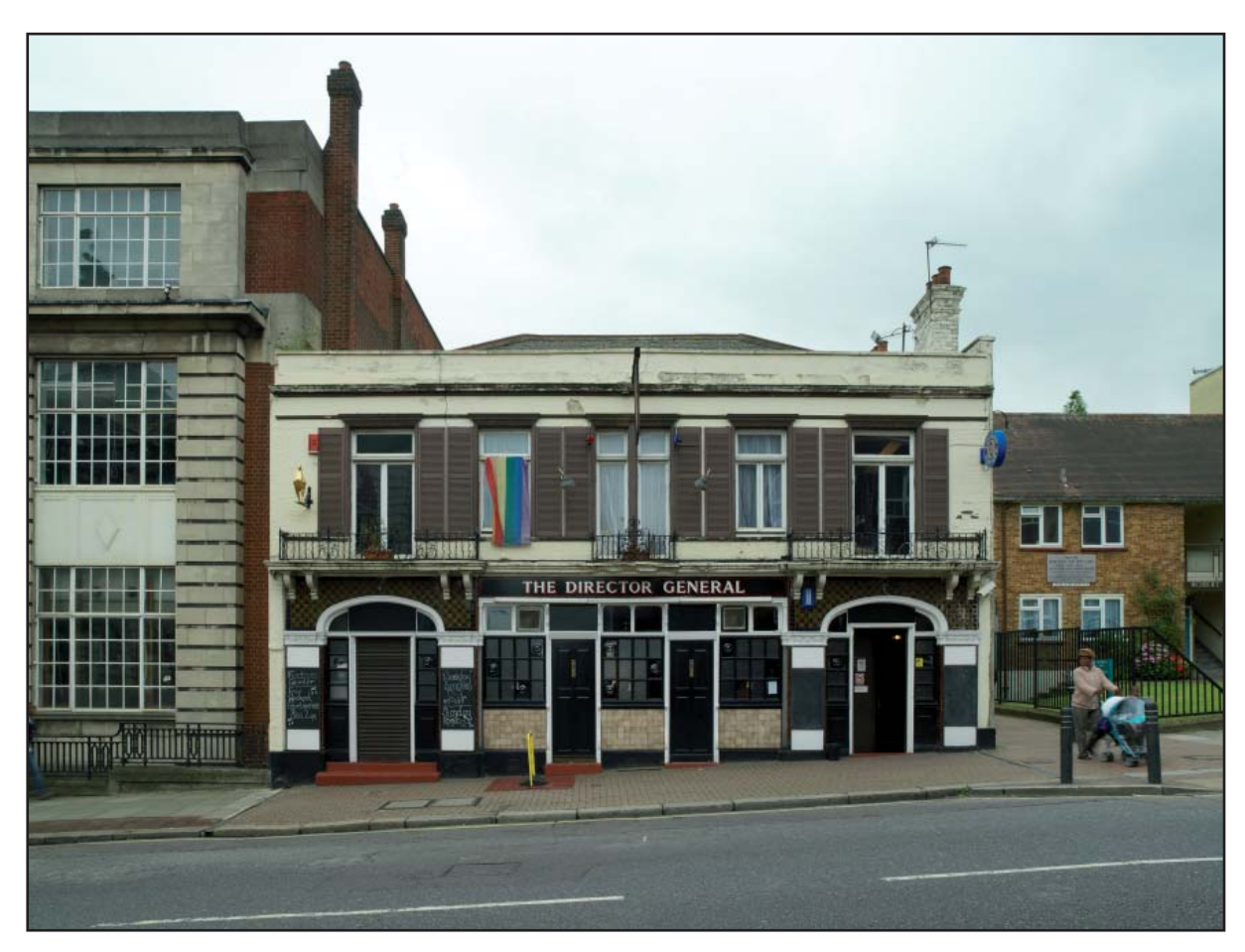
Plate 3: Front elevation of Director General (Block A)