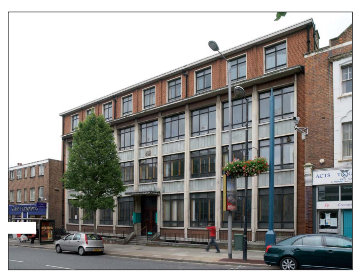
Plate 8: Block D and Block E (to left side)