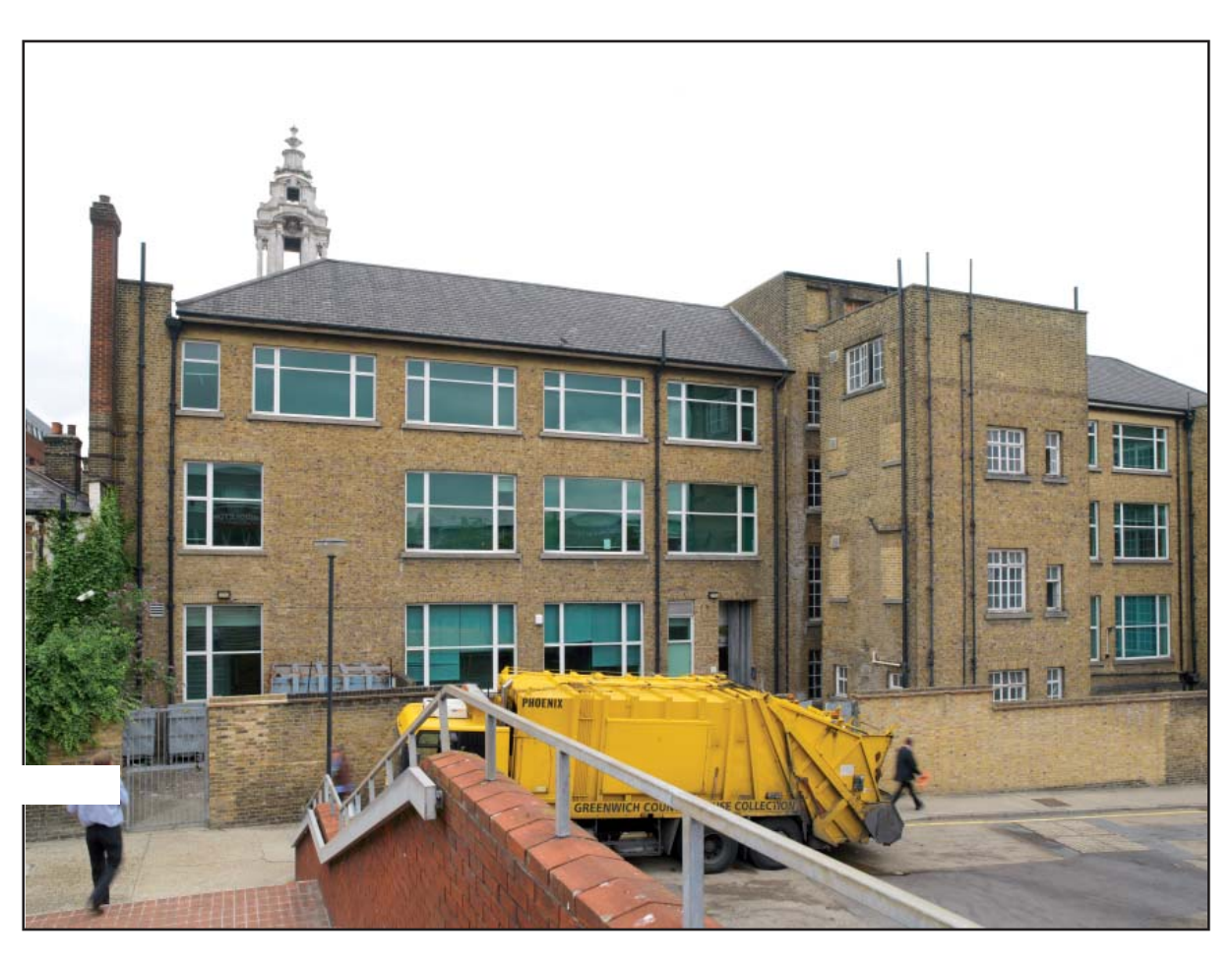
Plate 6: Rear of Block B