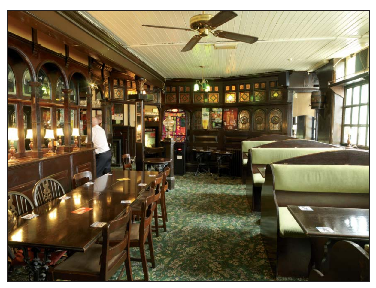
Plate 9: Interior of Director General Pub