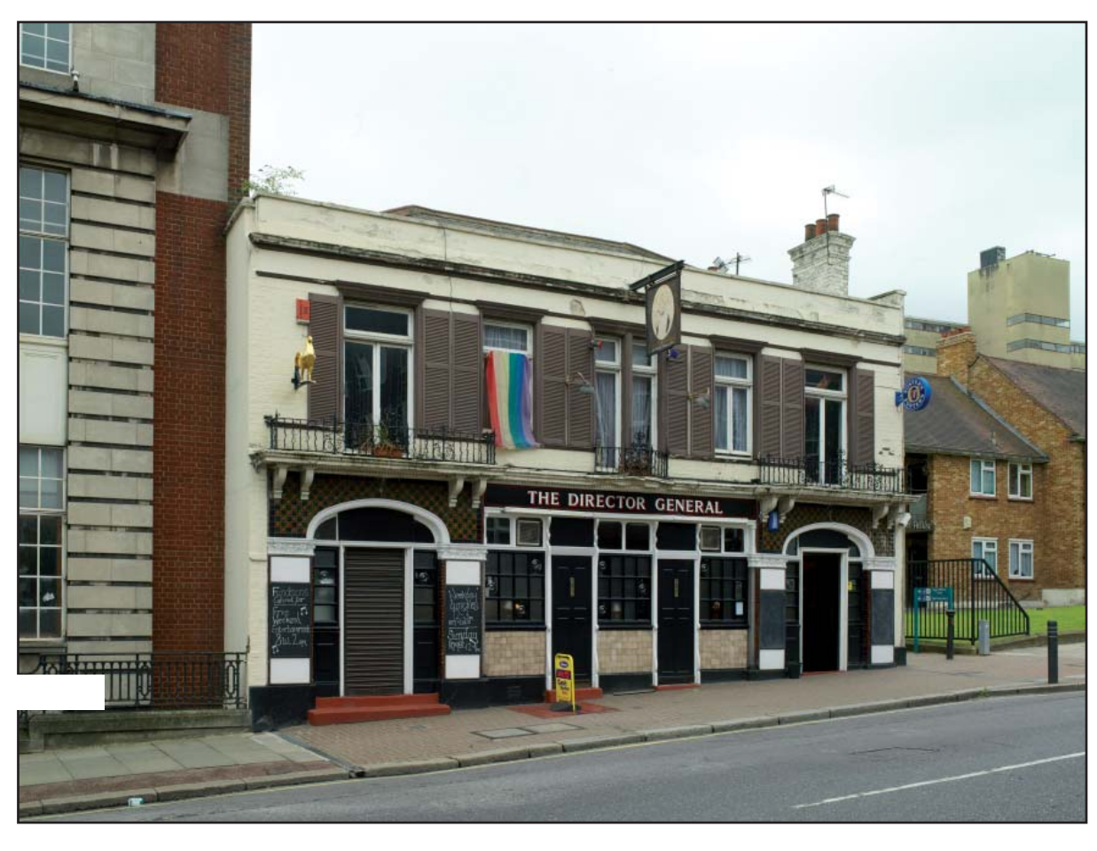
Plate 2: Director General pub (Block A)