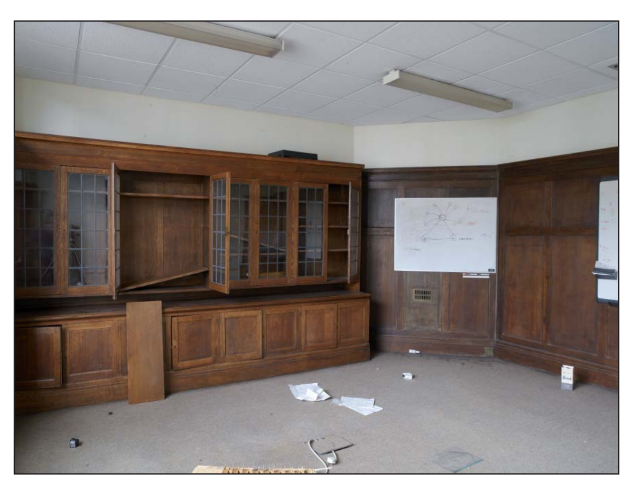
Plate 10: Office within Block B