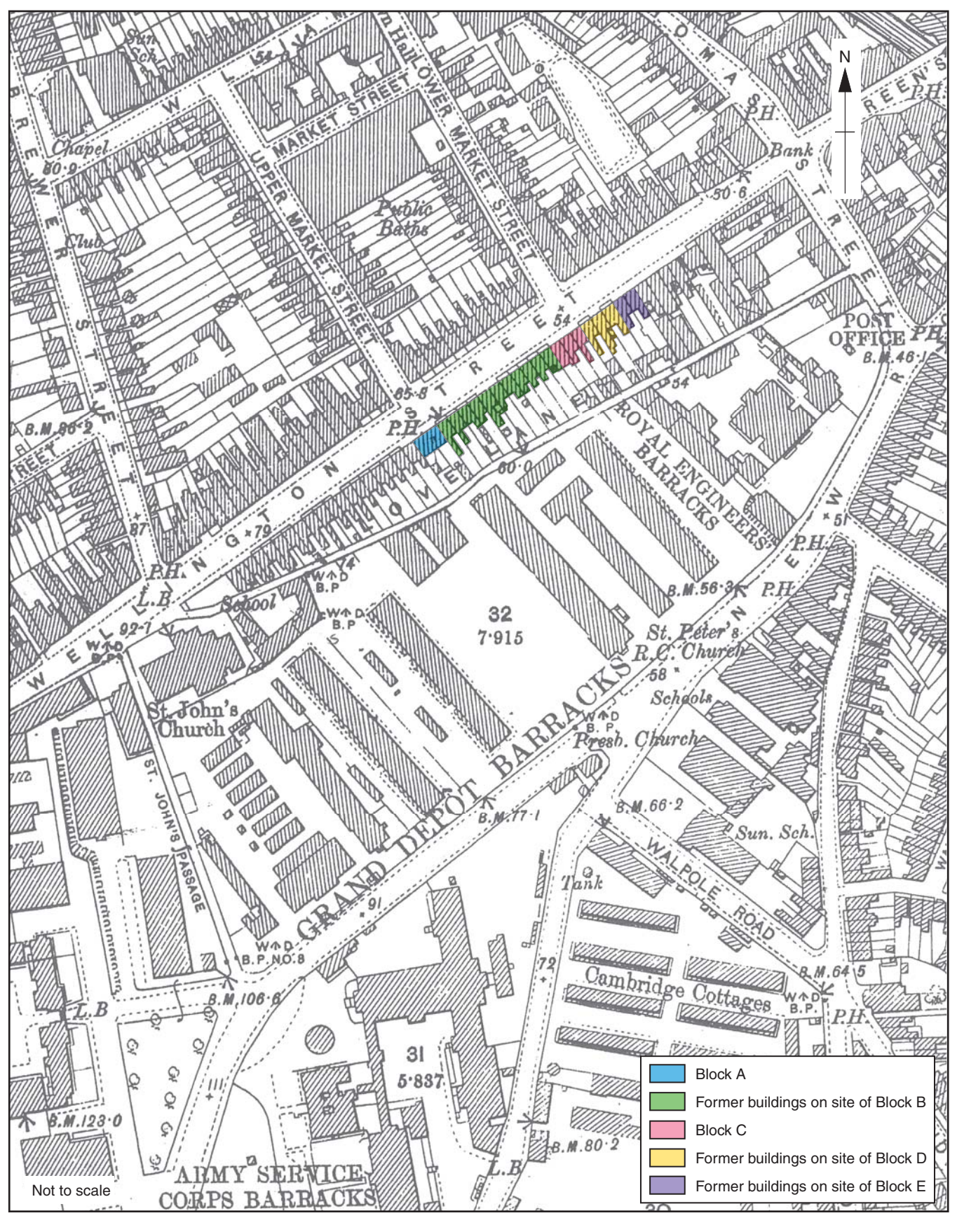
Figure 3: 1894 Ordnance Survey map