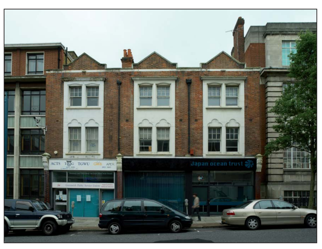
Plate 7: Front of Block C