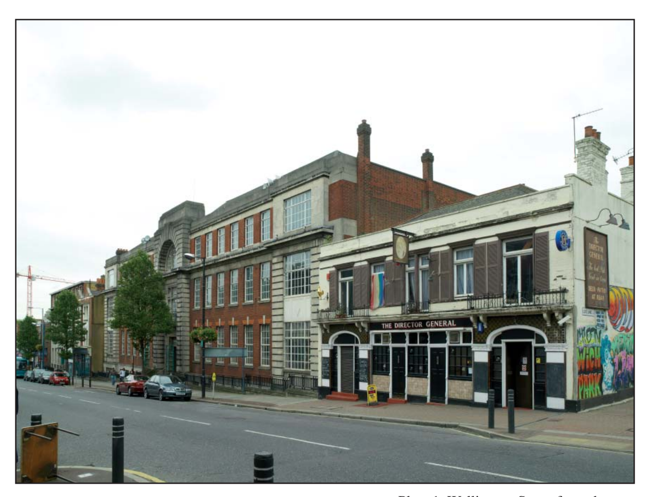
Plate 1: Wellington Street from the west