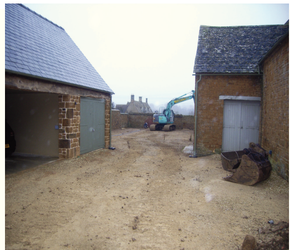
Plate 1: Swimming pool location looking west