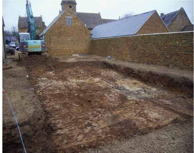
Plate 2: Footprint of swimming pool fully excavated to natural geology

3.1.1 Natural clay (4) was recorded at between 100.97 m OD to the south and 101.24 m OD to the north within the footprint of the excavation, with a seam of ragstone present at the northern end. A 0.3m yellow orange clay subsoil (3) was observed overlying the natural clay in the southern part of the footprint. The subsoil extended 5 m into the excavated area. A levelling deposit 0.3-0.35m thick covered the entire area. This consisted of mid brown grey silt clay containing 20% large ragstone rubble <500mm diameter (2) and was capped with the stone chipped yard surface (1) which was 0.12-0.15m thick.