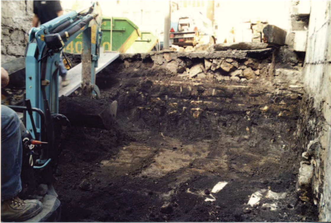
Plate 1: View westwards towards section. The ochre earth at the base is the medieval pit group fill.