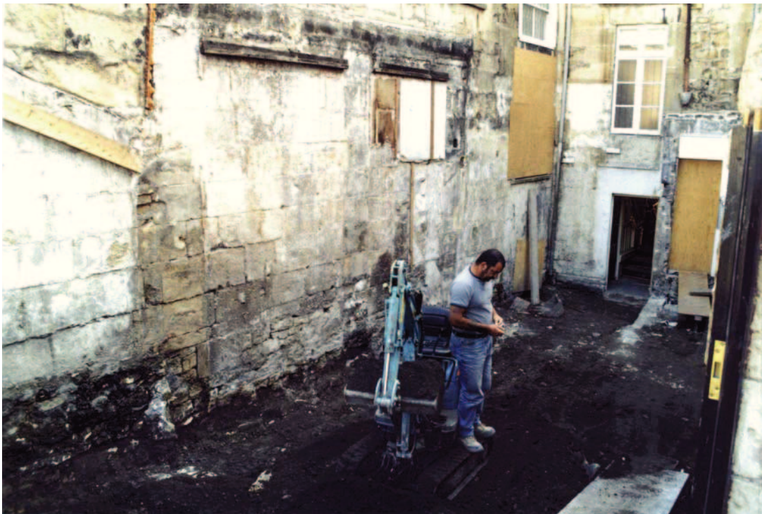
Plate 2: Looking eastwards during clearance of the post-medieval garden soil, before the discovery of pit 11, near the back door.