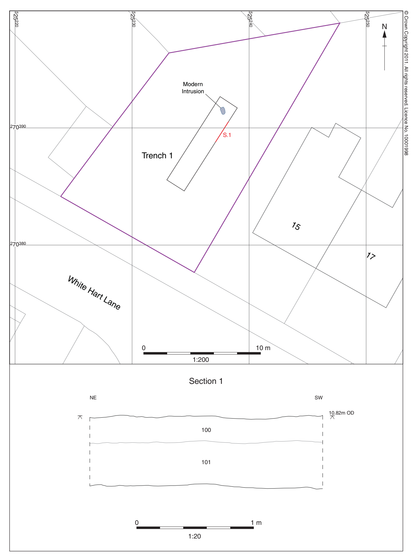
Figure 2: Trench plan (section location red, development area purple) and section drawing

© Oxford Archaeology East Report Number 1260