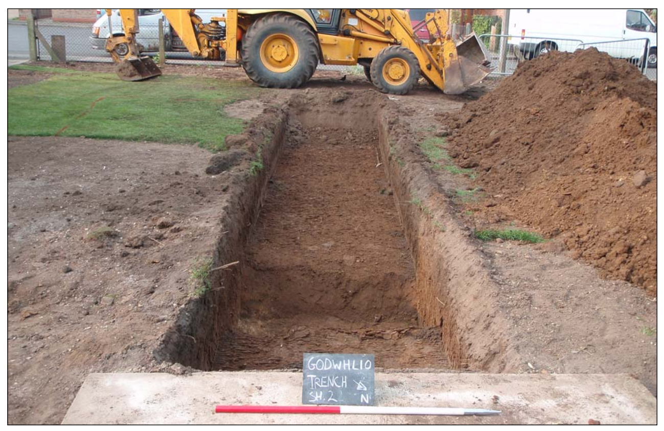
Plate 1: Trench shot, photo taken from the north-east