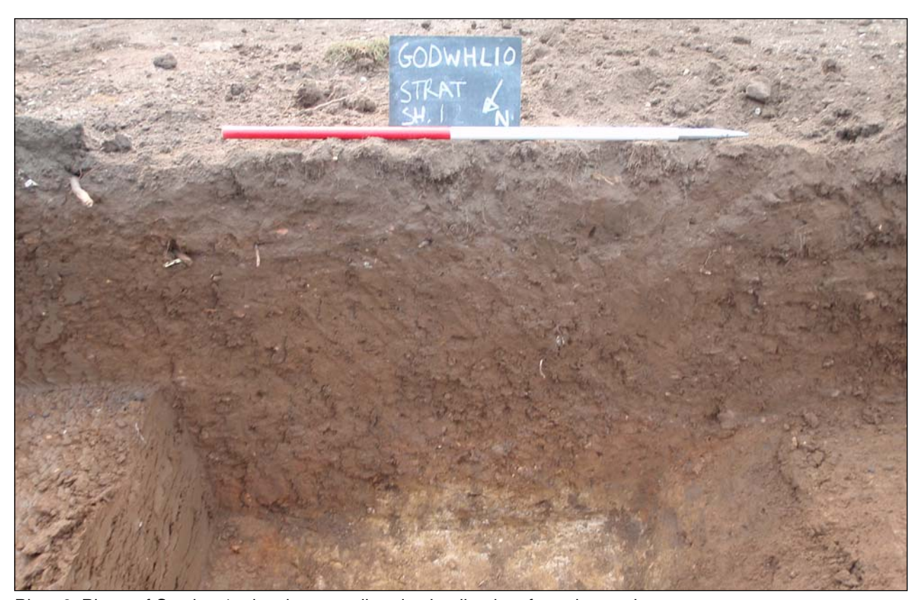
Plate 2: Photo of Section 1, showing topsoil and subsoil, taken from the north-west

© Oxford Archaeology East Report Number 1260