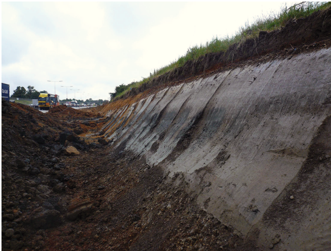
Plate 2: A close-up shot of the main organic rich interglacial channel sequence