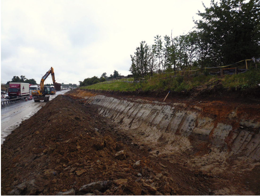
Plate 1: An interglacial (stage 9) channel sequence identified within the Lynch Hill gravels