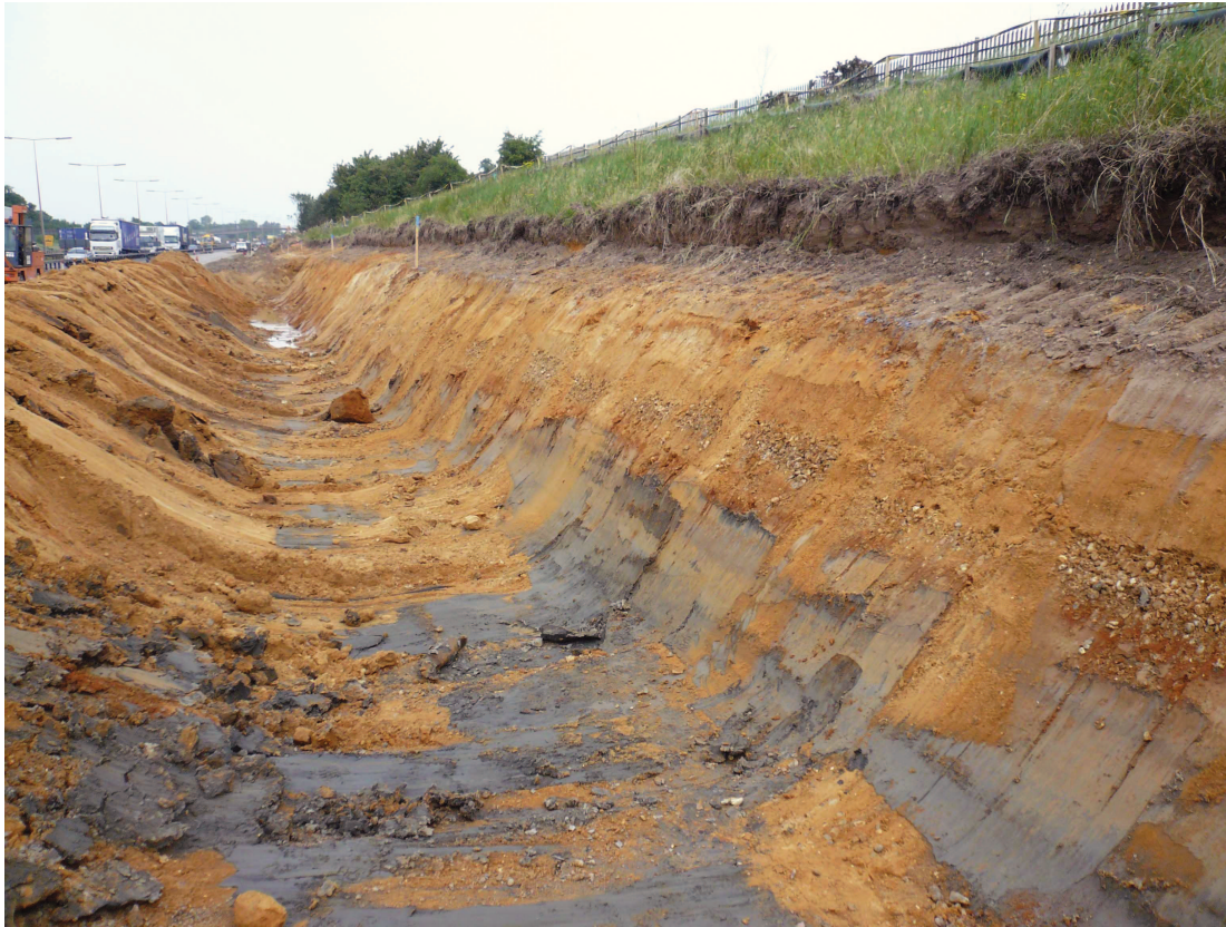
Plate 4: The organic channel deposits disappearing into the base of the section