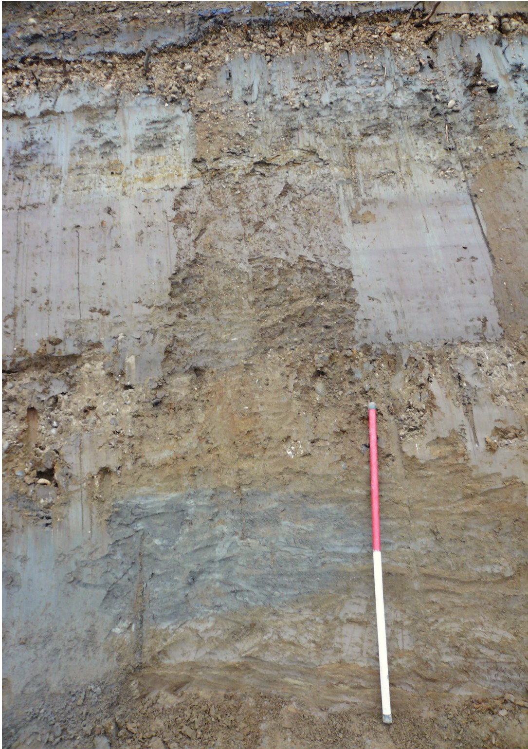
Plate 3: Section (CH 184295) showing the complexity of the channel sequence