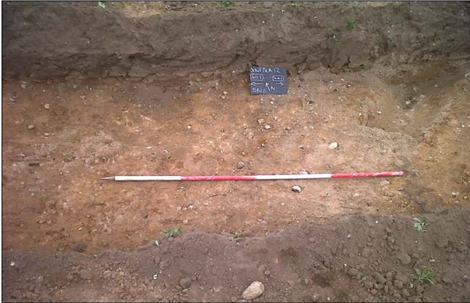
Plate 1: 401 and 403 taken from the south-west, 2m scale