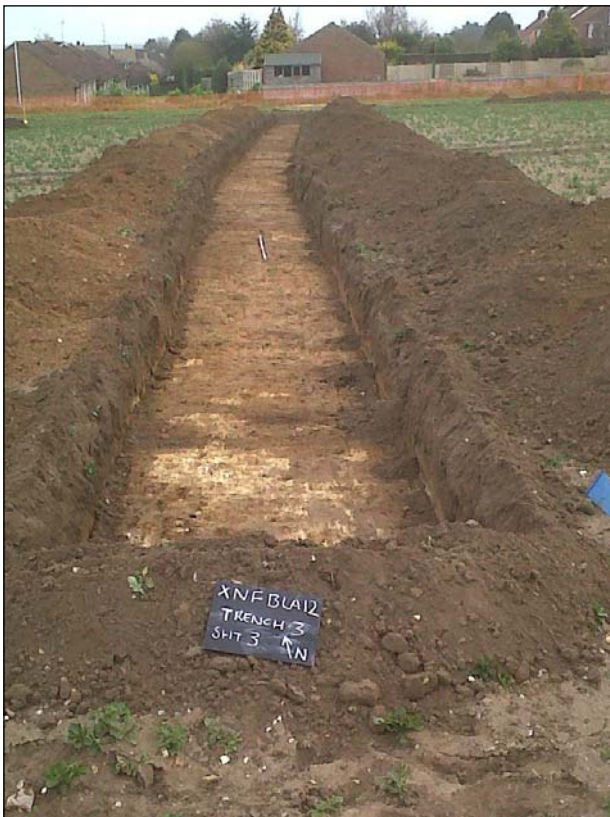
Plate 2: Trench 3 taken from the south