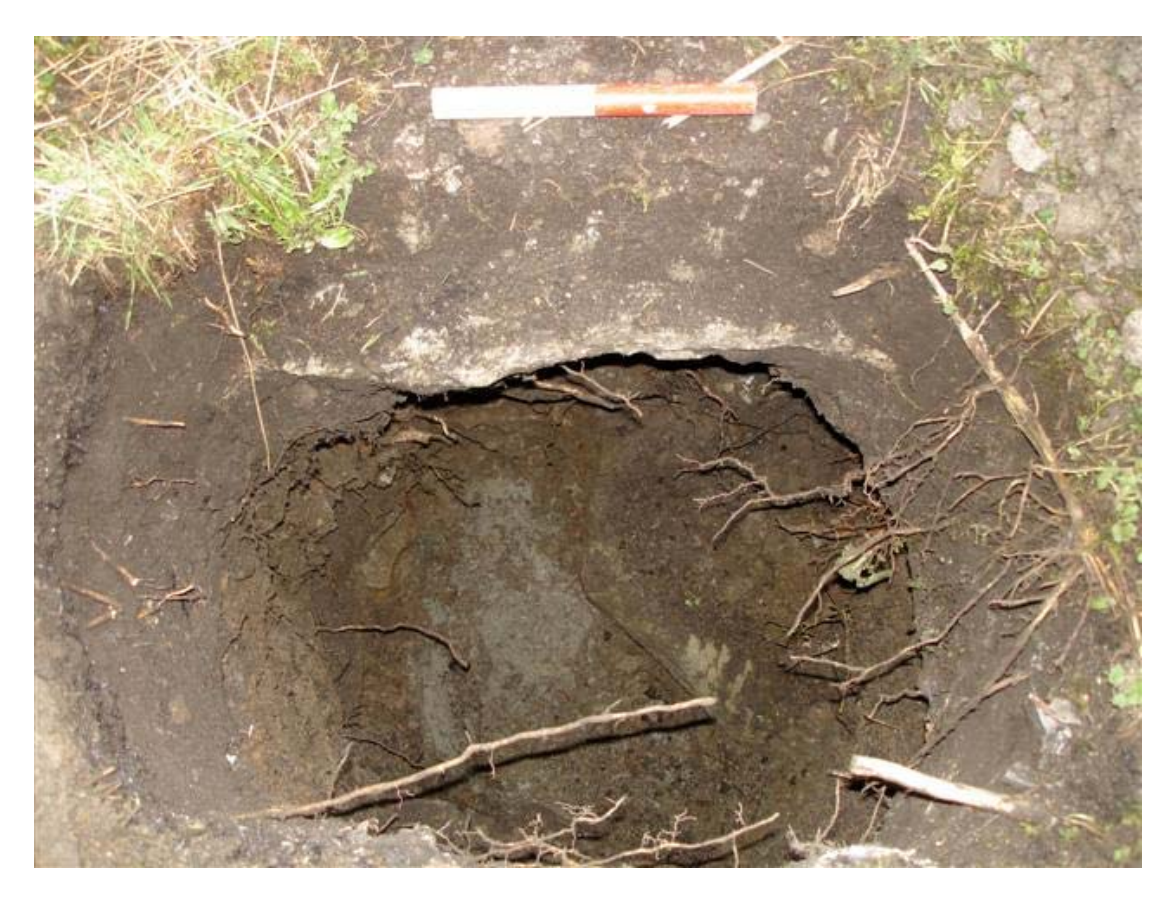
Plate 3: HDTP 2 showing natural, 203