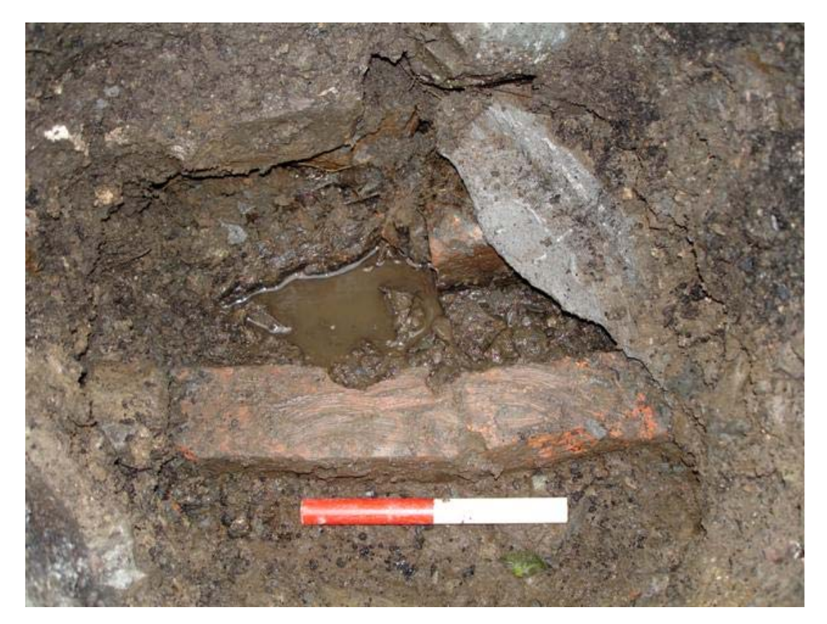
Plate 2: Exposed brick-lining to culvert 103