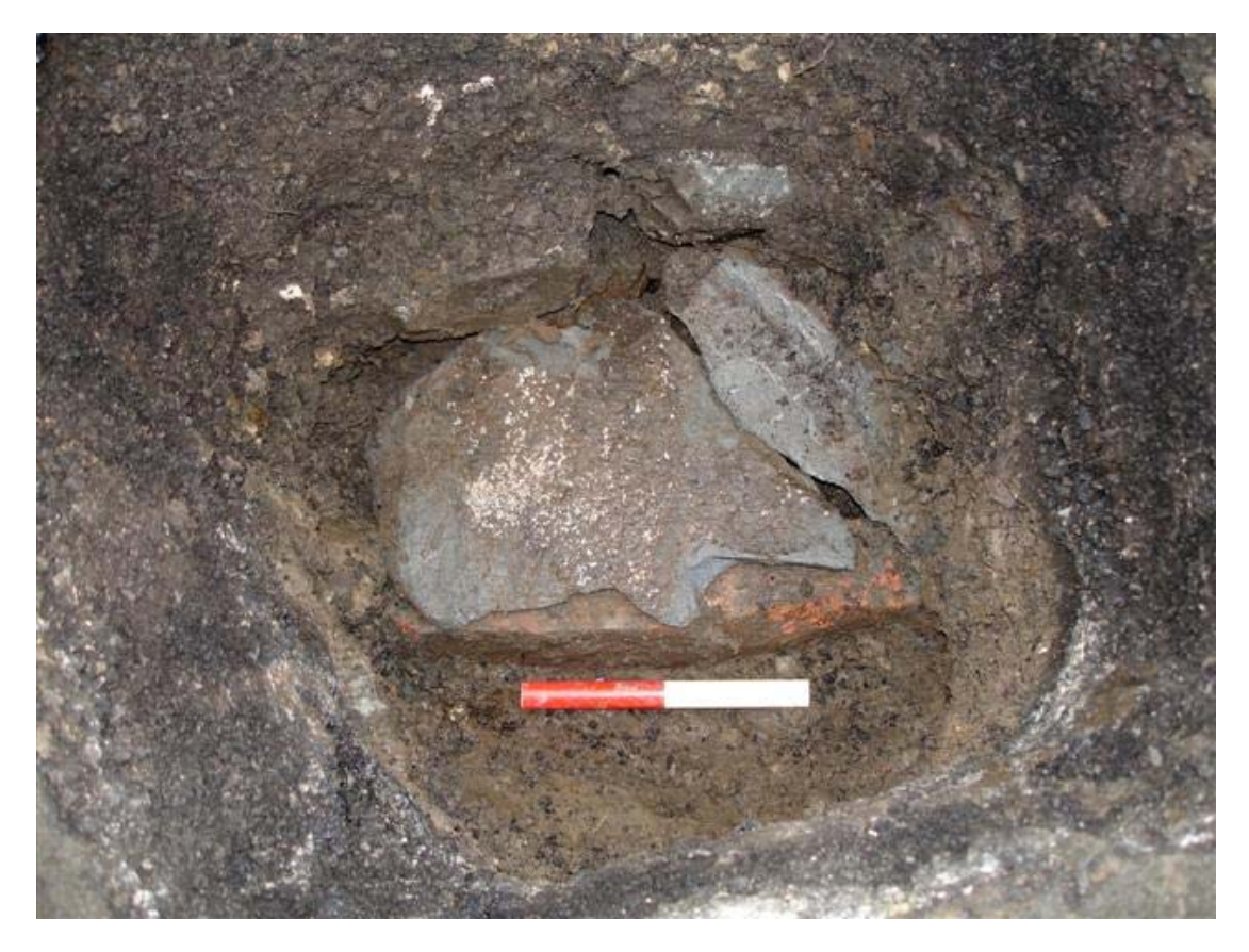
Plate 1: Brick-lined culvert with slate cap, 103