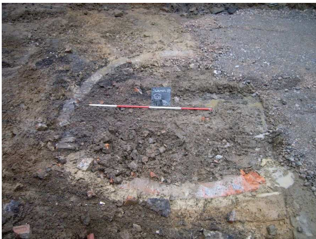
Plate 4: Foundation, Fountain 106