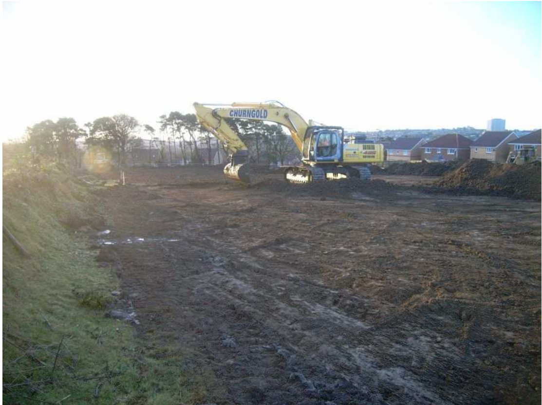
Plate 1: General view across Area 1 during stripping