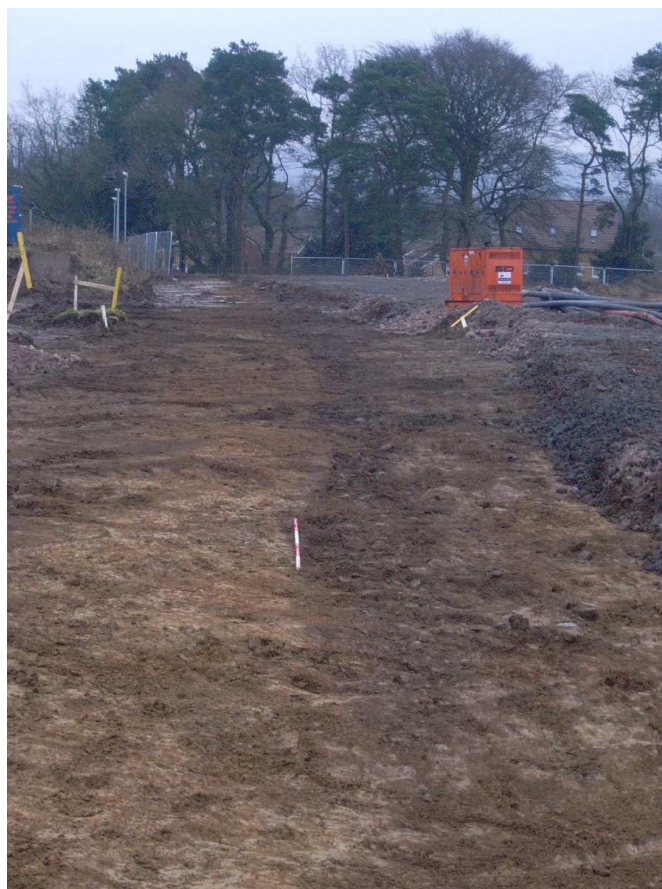
Plate 2: Area 1, Field boundary 104