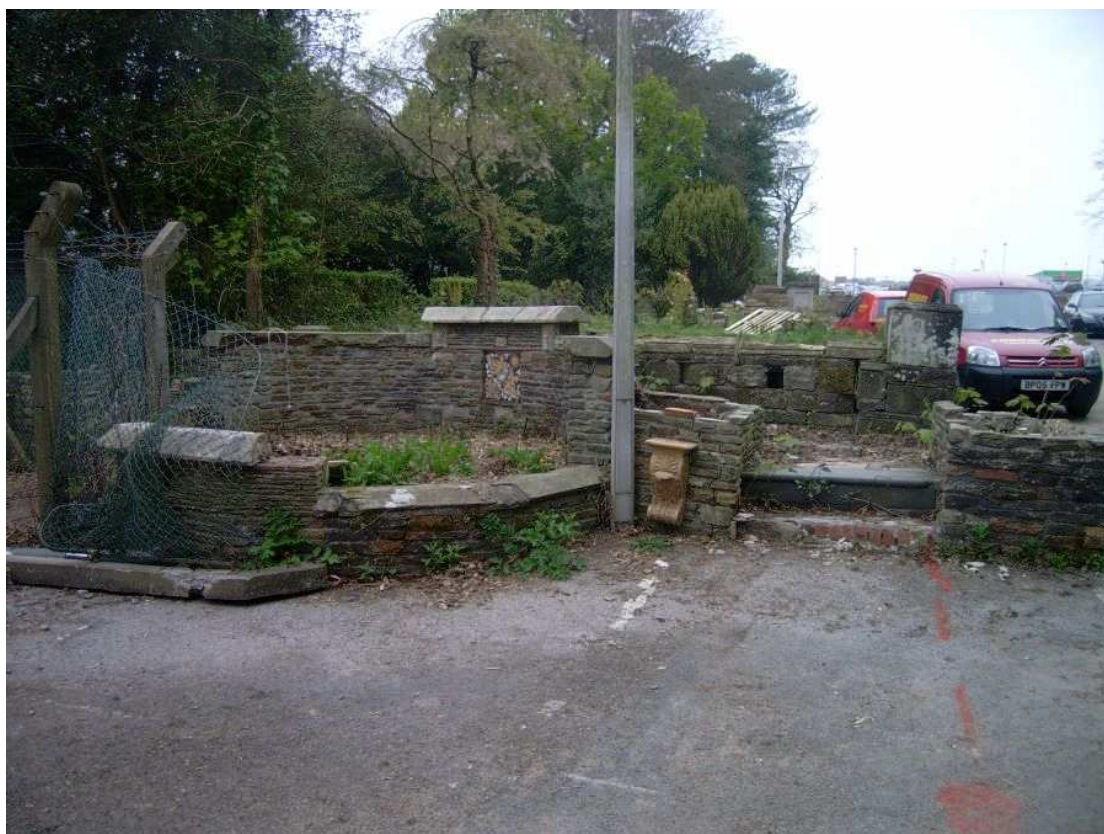
Plate 3: View across the extant garden features