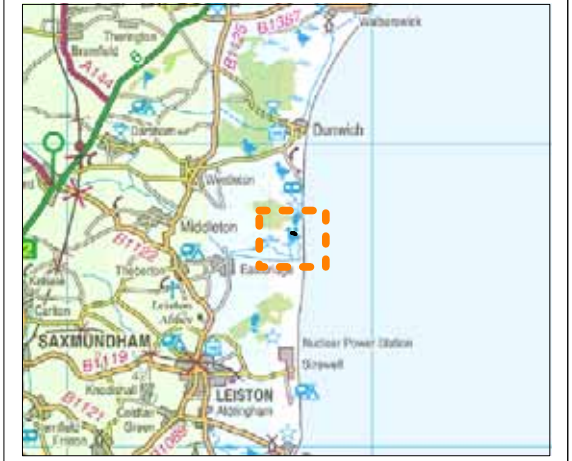
Overview Map 1- 250,000

Minsmere Site Location boundary and access routes