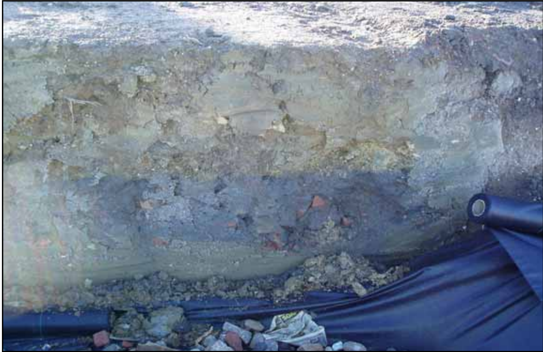
Plate 1: Typical section through Area A