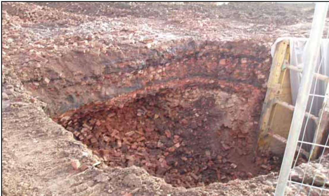
Plate 2: Typical section through Area D