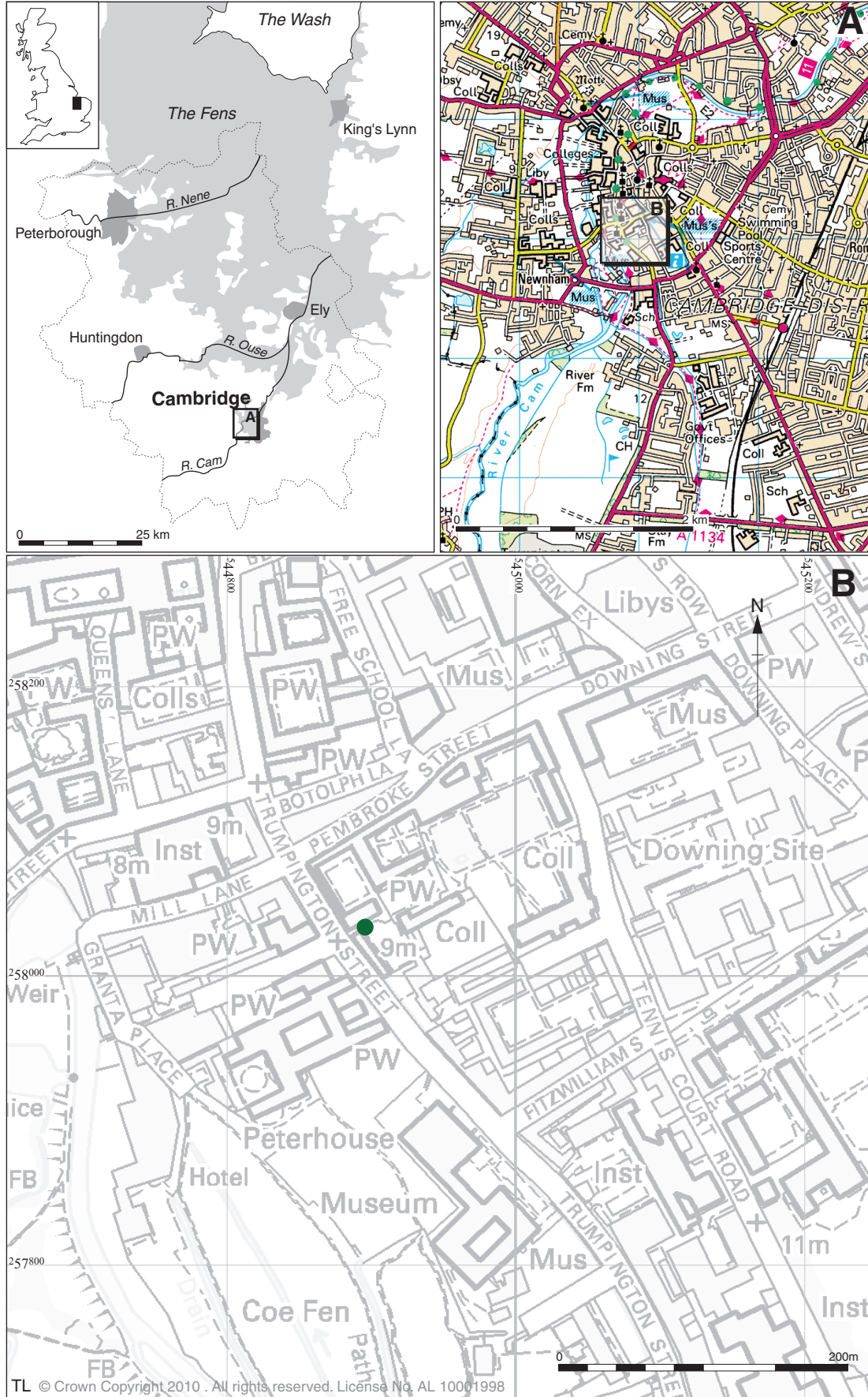
Figure 1: Location of works (green)