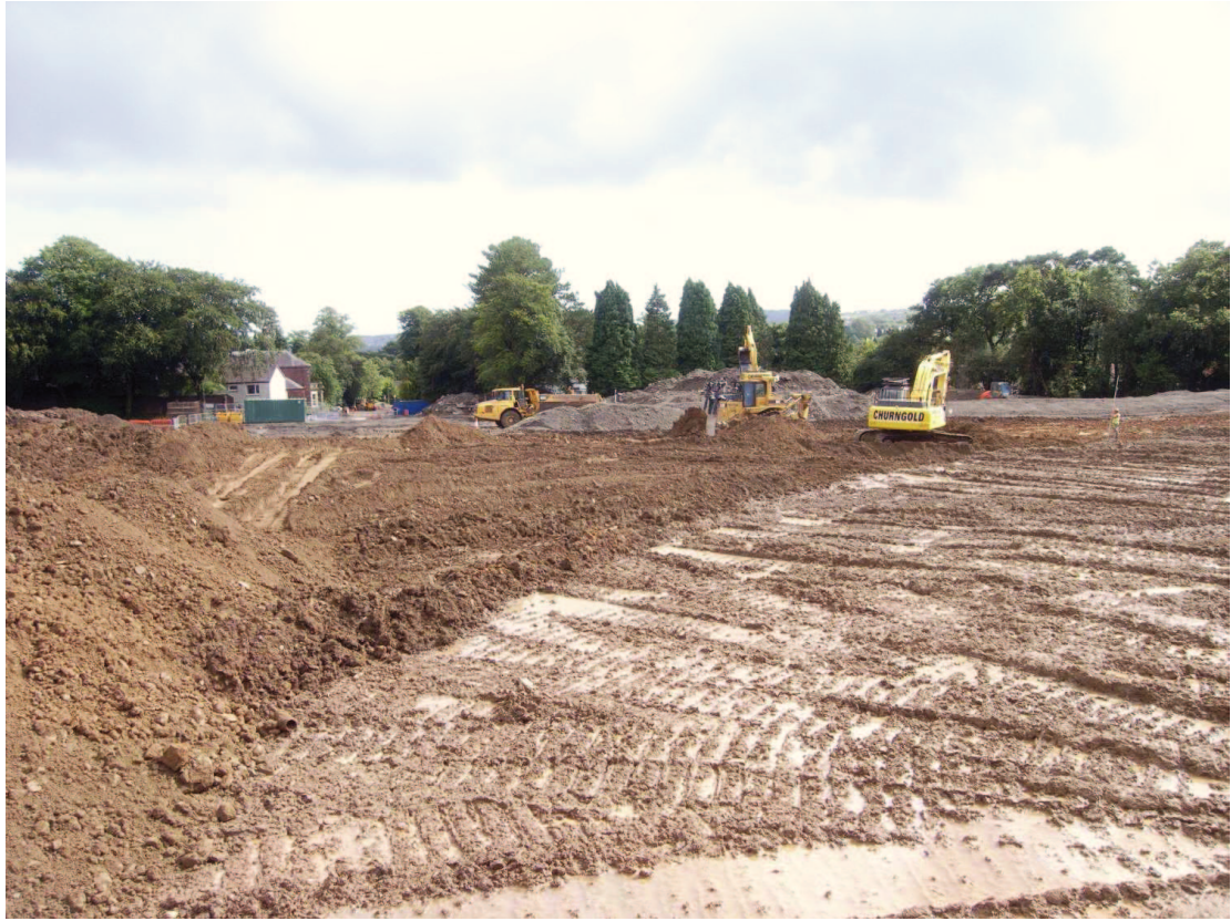
Plate 5: Area 3, General view