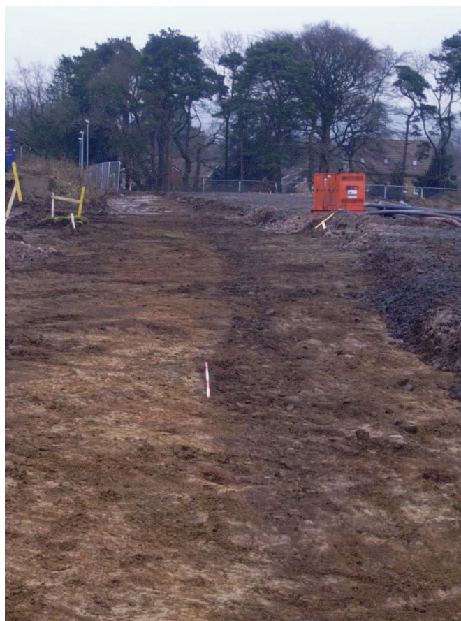
Plate 2: Area 1, Field boundary 104