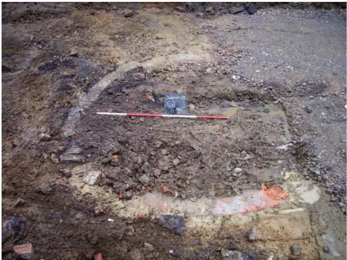
Plate 4: Foundation, Fountain 106