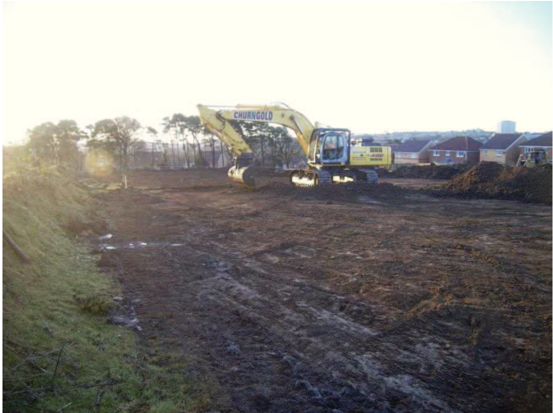
Plate 1: General view across Area 1 during stripping