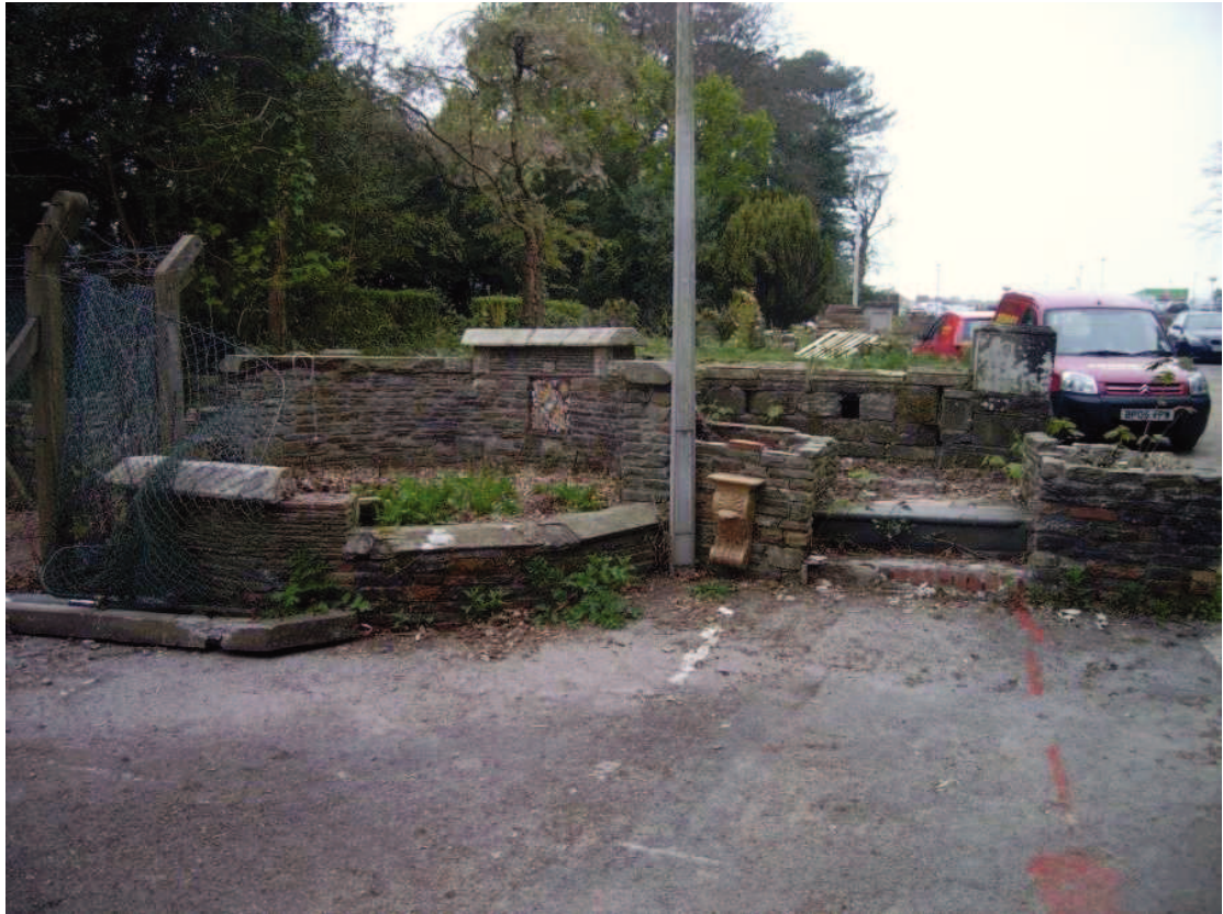
Plate 3: View across the extant garden features