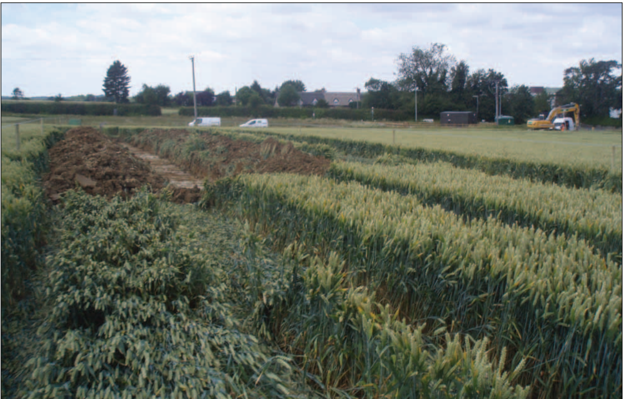
Plate 3: Working shot of site looking north with Trench 1