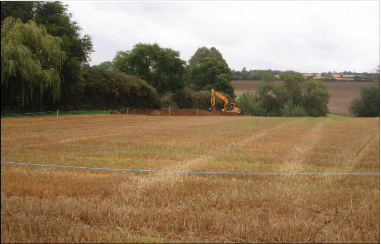
Plate 4: Working shot of site looking east towards the River Stour with Trench 5