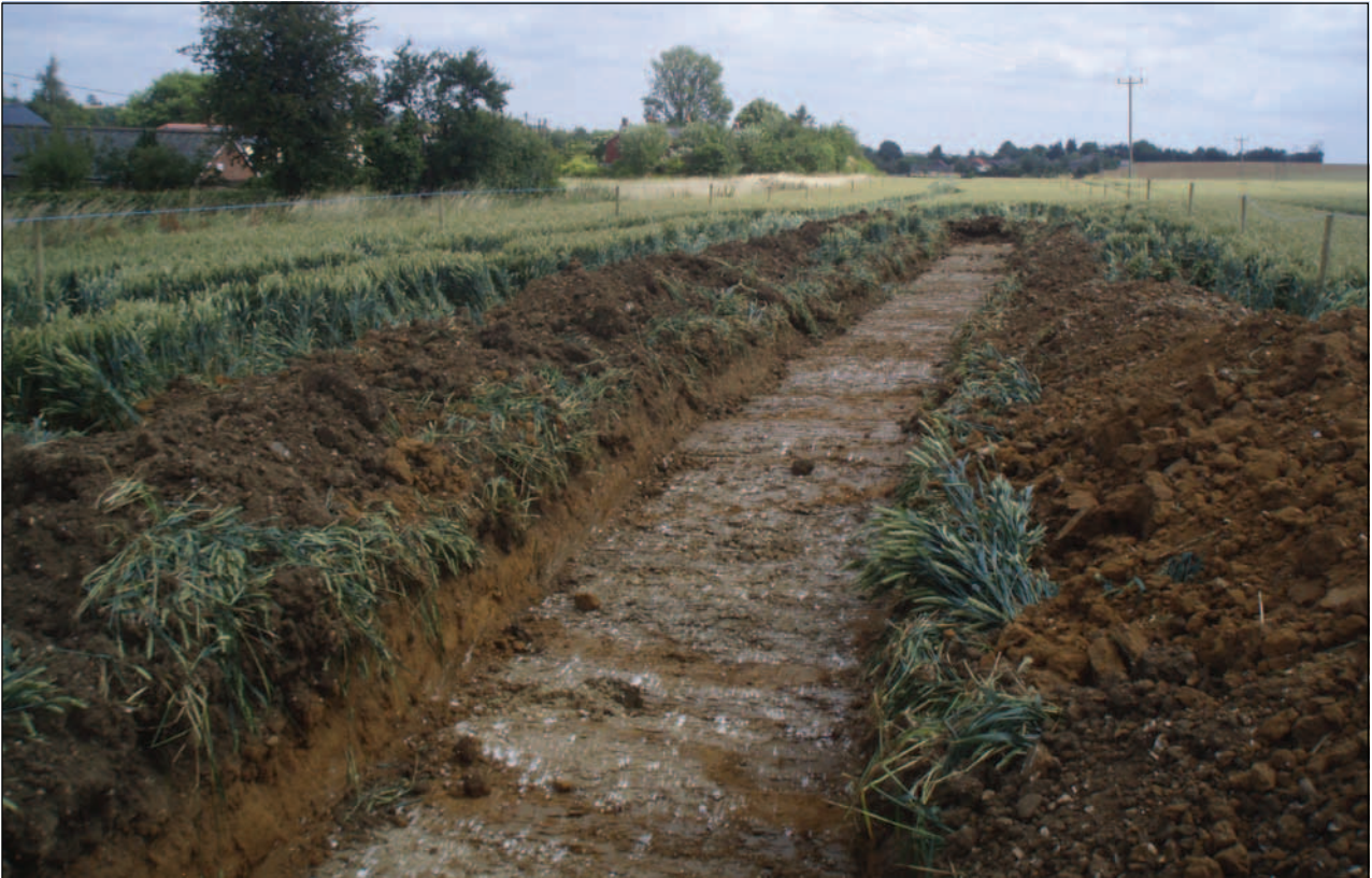
Plate 2: Trench 3 looking southeast