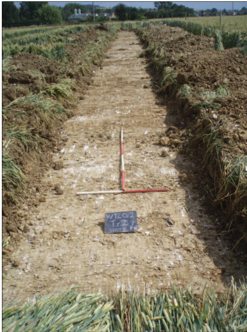
Plate 1: Trench 2 looking southeast