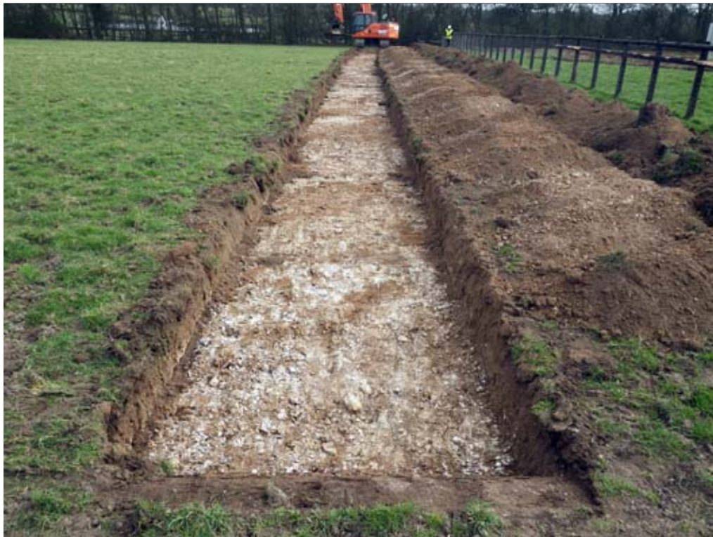
Plate 2: Trench 4, looking east south-east