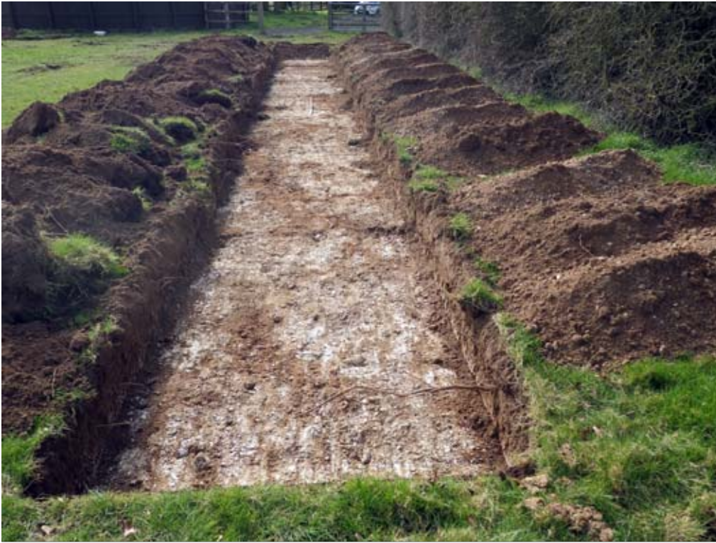
Plate 1 : Trench 1, looking north north-east