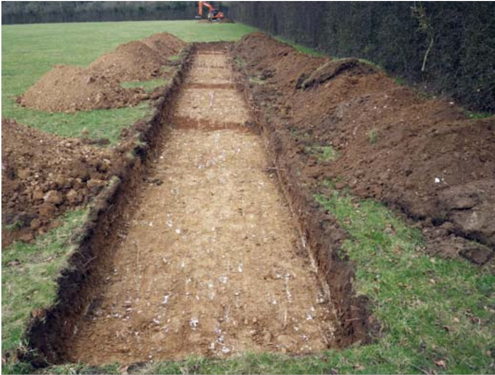
Plate 3 : Trench 6 looking north north-east