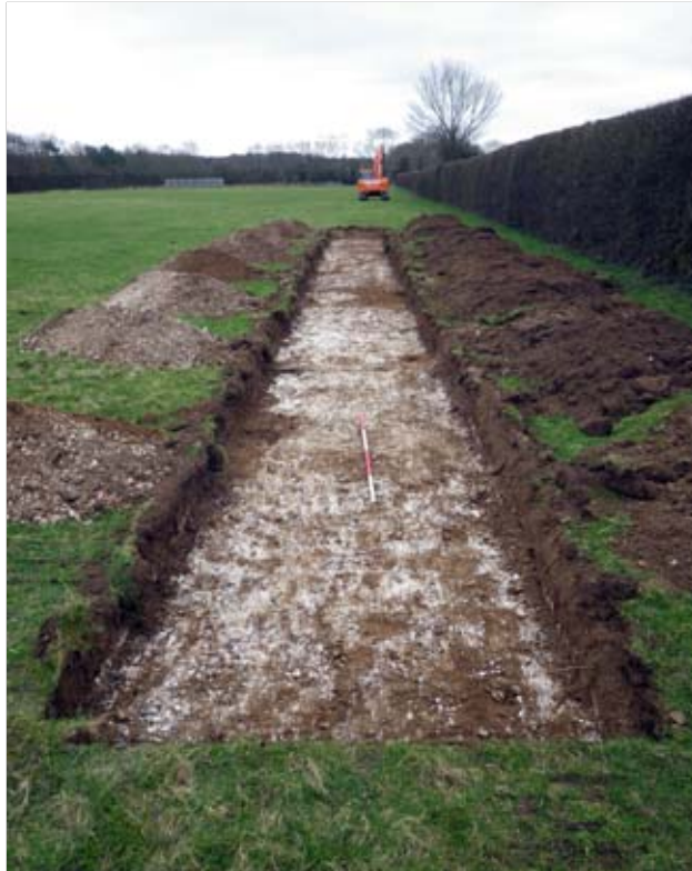
Plate 4:Trench 9 looking south south-west