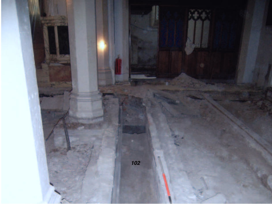
Plate 11: Brick heating duct 102, looking east