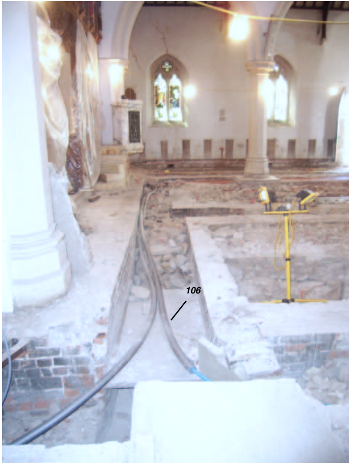
Plate 12: Brick heating duct 106, looking west