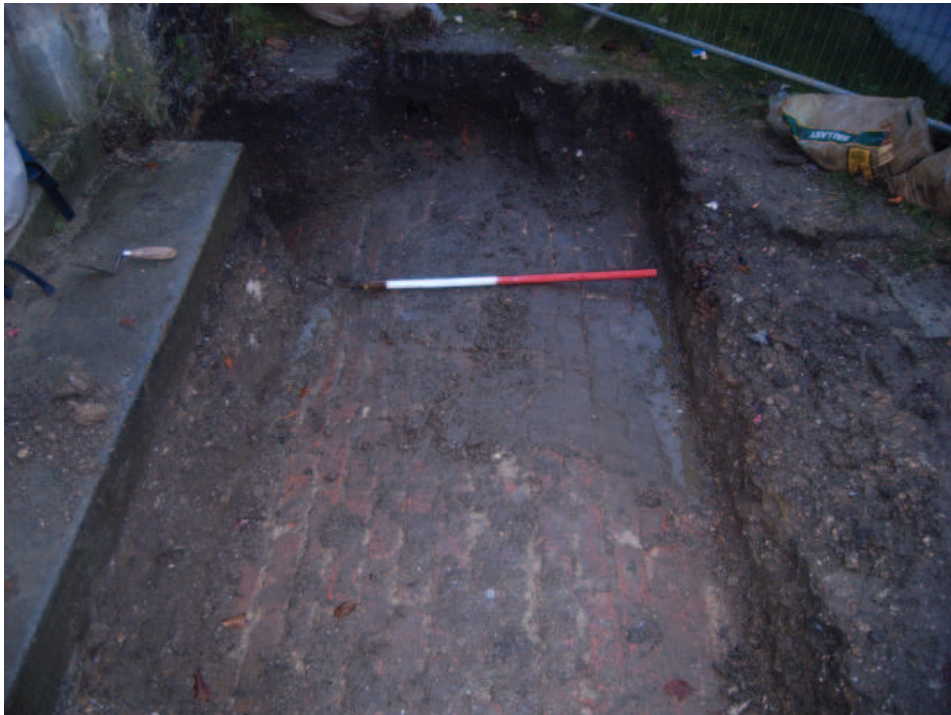
Plate 10: Brick vault 124, looking west