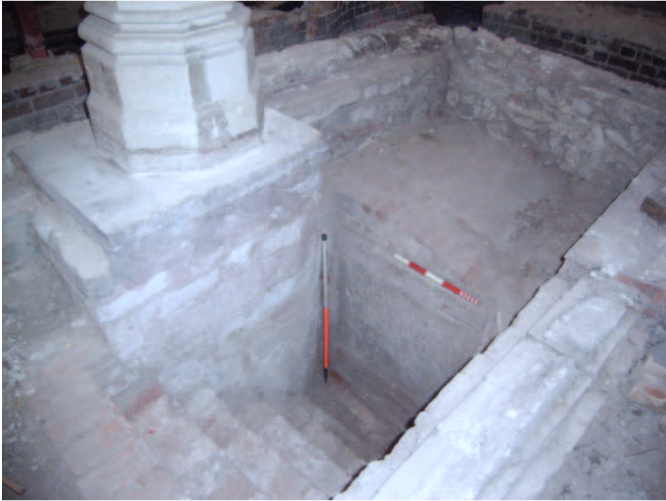
Plate 5: Brick vault 105, looking north-east