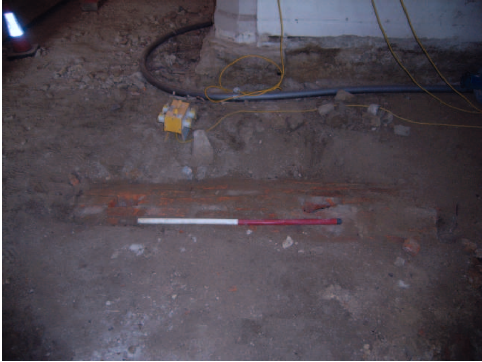
Plate 7: Brick vault 122, looking south