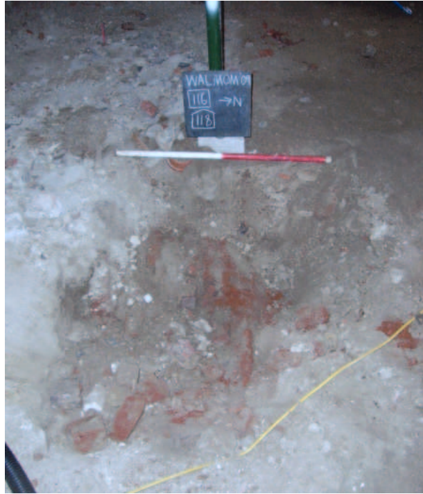
Plate 9: Brick vault 118, looking west