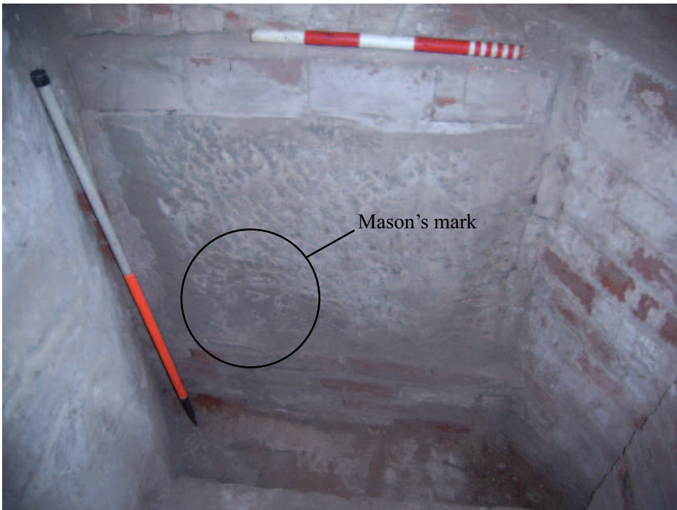
Plate 6: Brick vault 105 Mason's mark