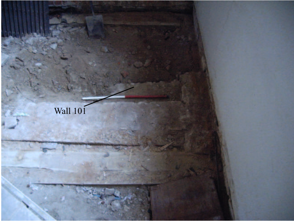
Plate 1: Medieval church wall 101, western section looking south