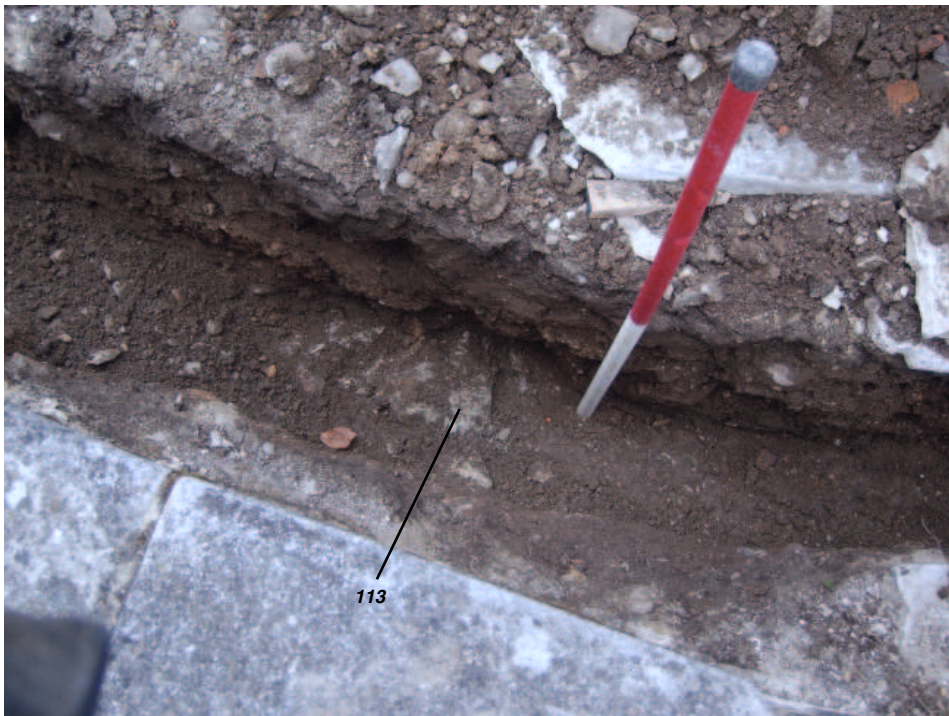
Plate 14: Wall footing 113, looking south