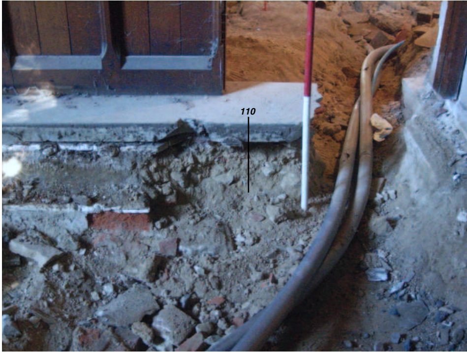
Plate 13: Vestry wall foundation 110, looking west