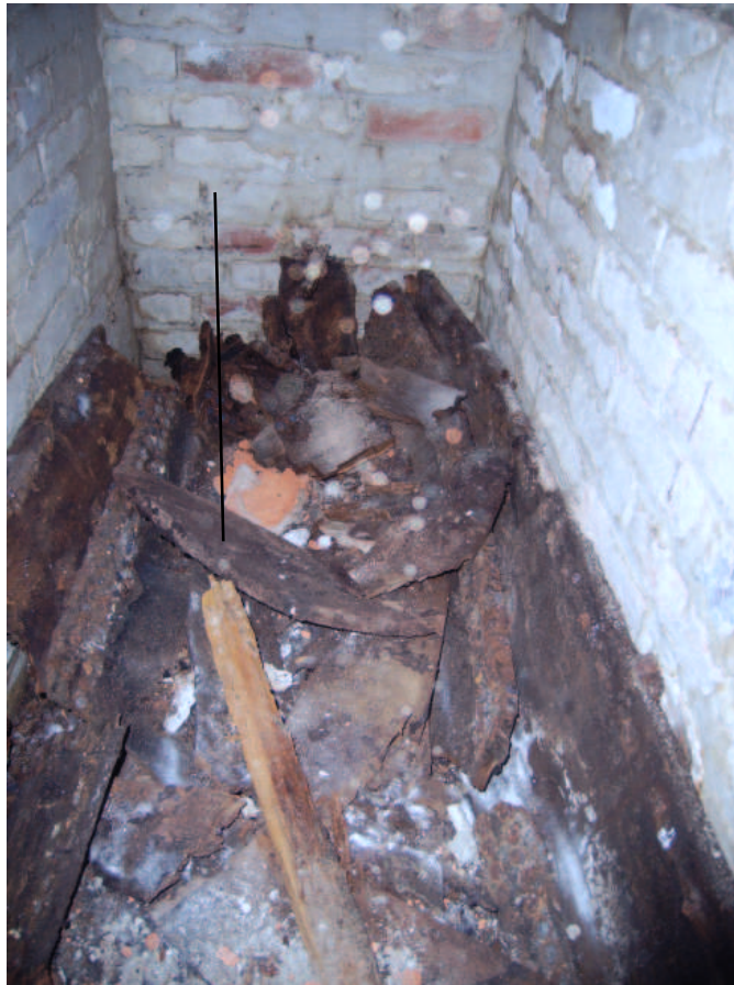
Plate 8: Brick vault 122, internal view