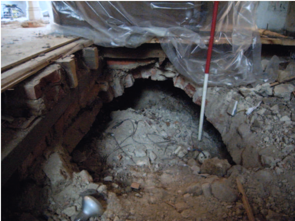
Plate 4: Vault 121, looking north