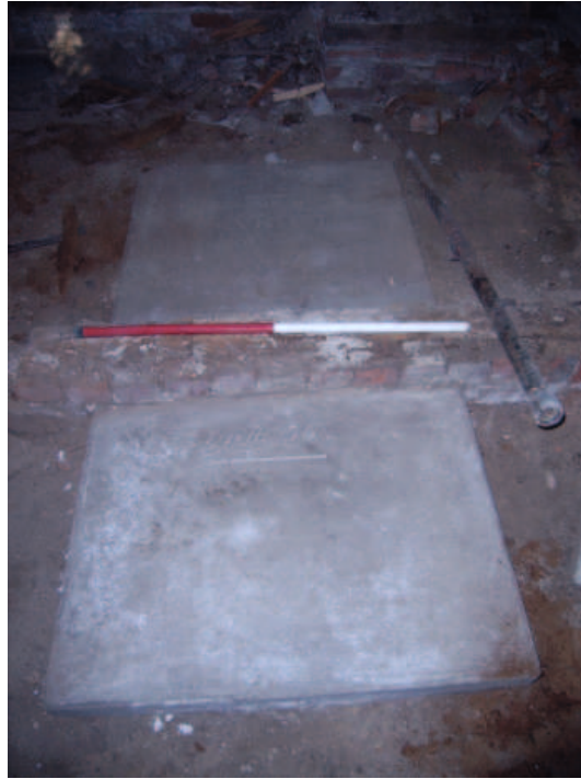
Plate 3: Grave marker 100