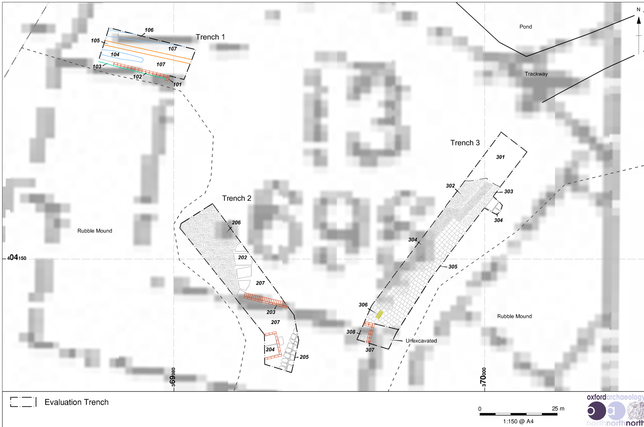
Figure 3: The evaluation trenches superimposed on the Ordnance Survey 25":1 mile map of 1893