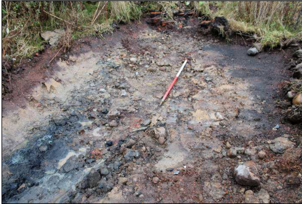
Plate 6: Metalled surface 206 , looking west