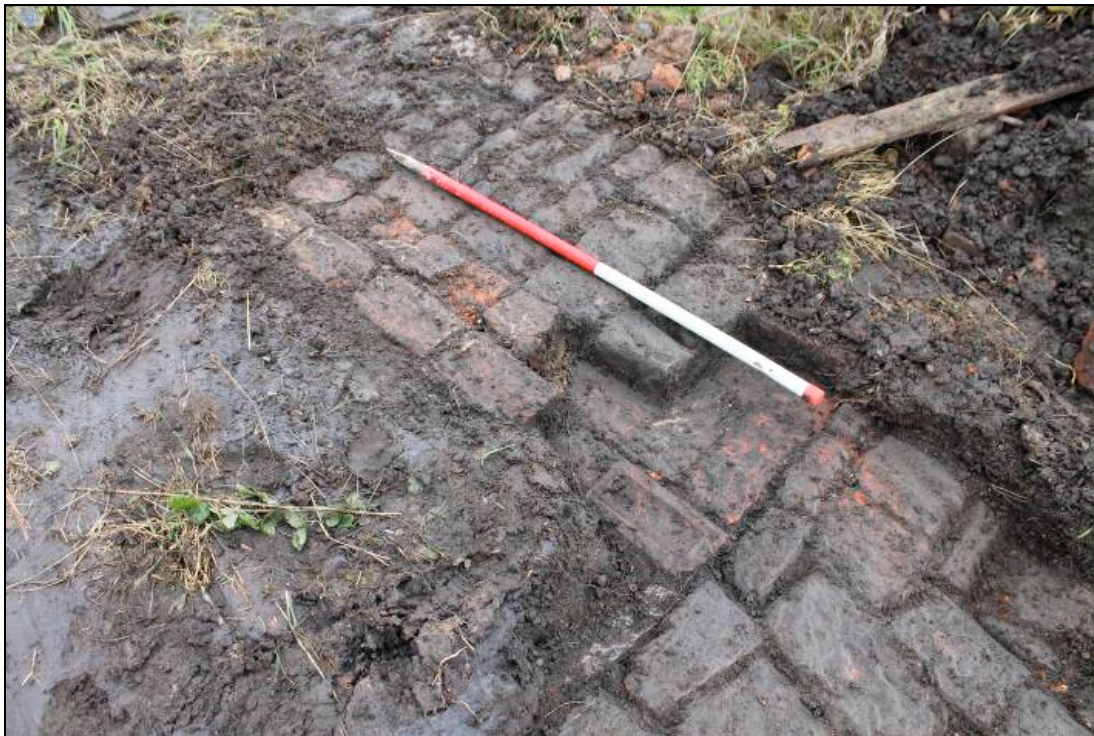
Plate 11: Brick wall 307 with set surface 308 in background, looking north-west