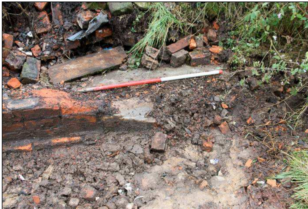
Plate 5: Stone block 103, looking south