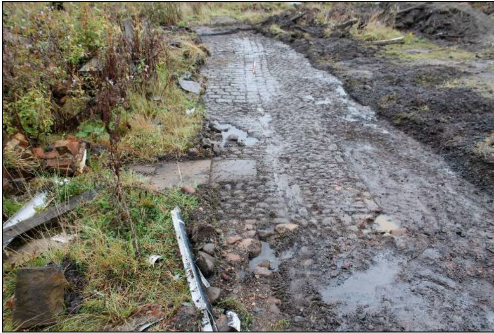
Plate 9: Cobbled surfaces 302 , 303 and 304 , with flags to left, looking south-west