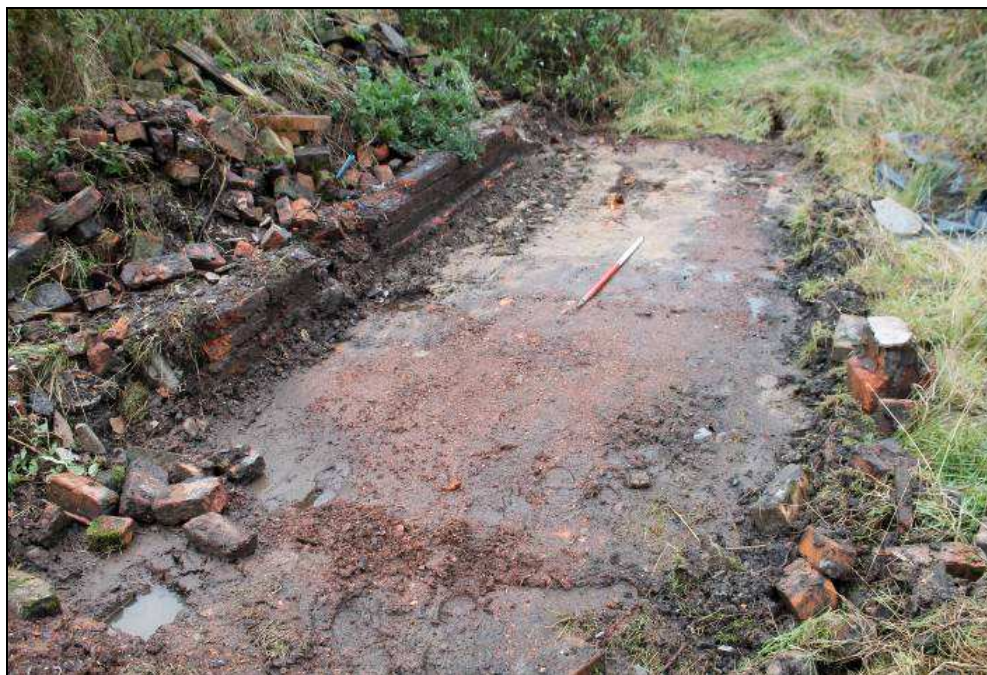
Plate 4: Trench 6 general view, wall 101 on left, looking south-west

3.2.2 At the southern edge of the trench a machine-made brick wall ( 101 ) bonded with white mortar, was evident (Plate 4), which probably dates to the late nineteenth or early twentieth century. This wall was aligned east/west, extending for a distance of 3.8m, with a southerly return at its eastern end.