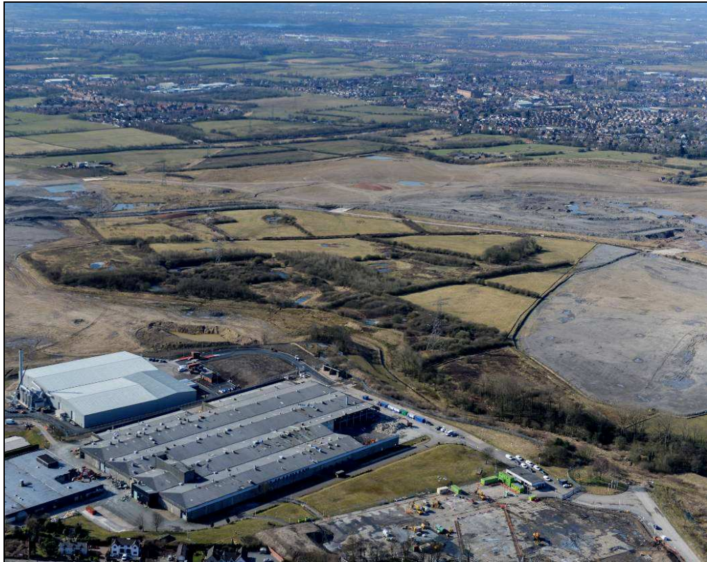
Plate 1: Aerial view across the study area