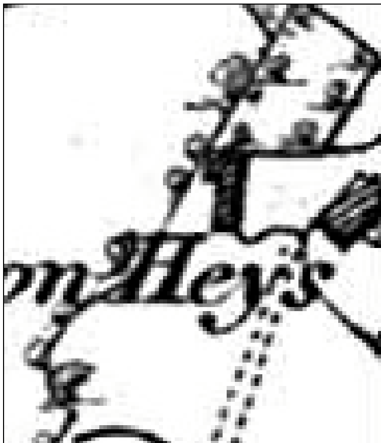
Plate 2: Hulton Heys as depicted on the 1849 OS 6":1mile map (Lancashire sheet 94)