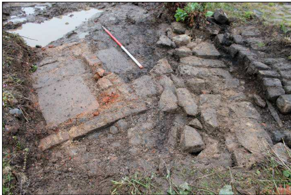
Plate 7: Stone wall 205 (right) with brick structure 204 (left), looking north