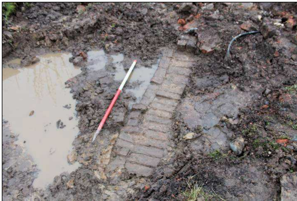
Plate 8: Hand-made brick, wall 203, looking west