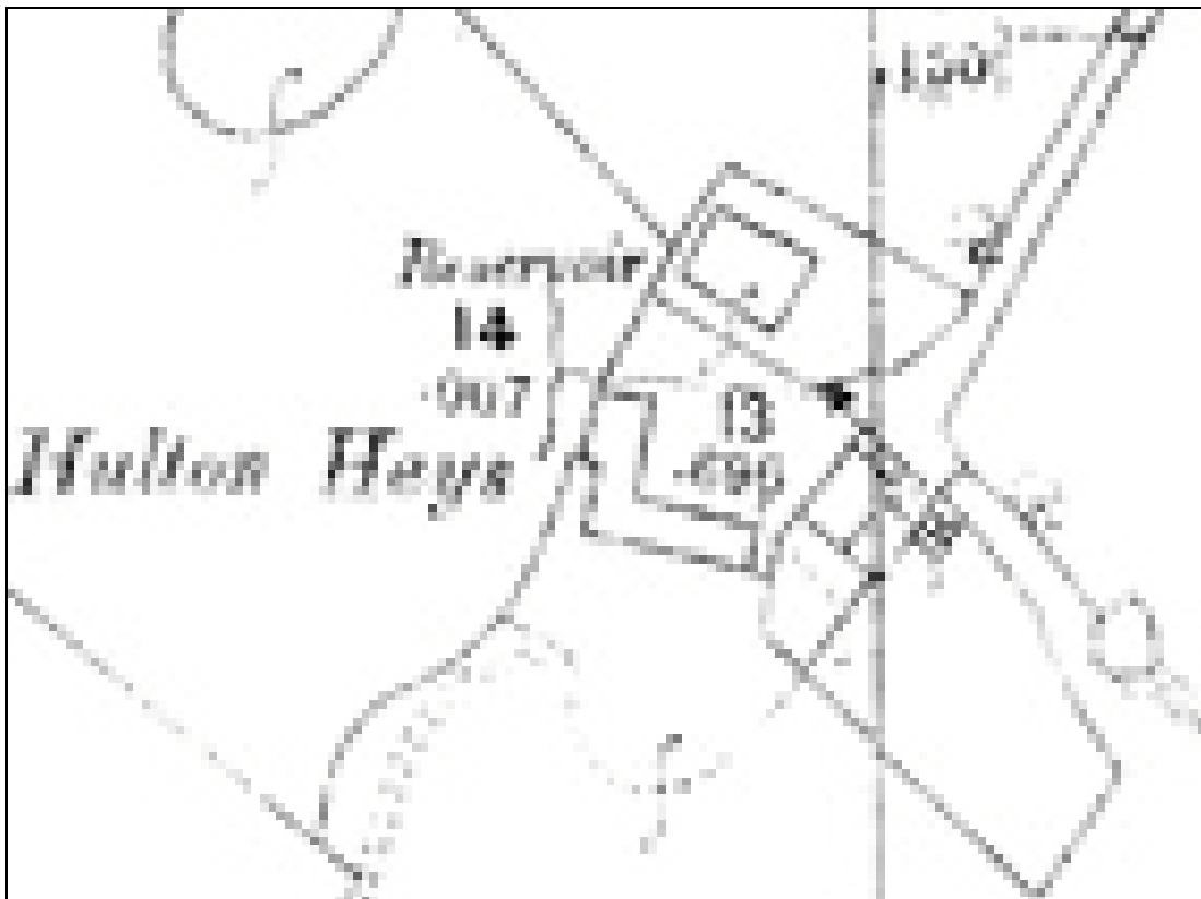
Plate 3: Hulton Heys as depicted on the 1893 OS 25":1mile map