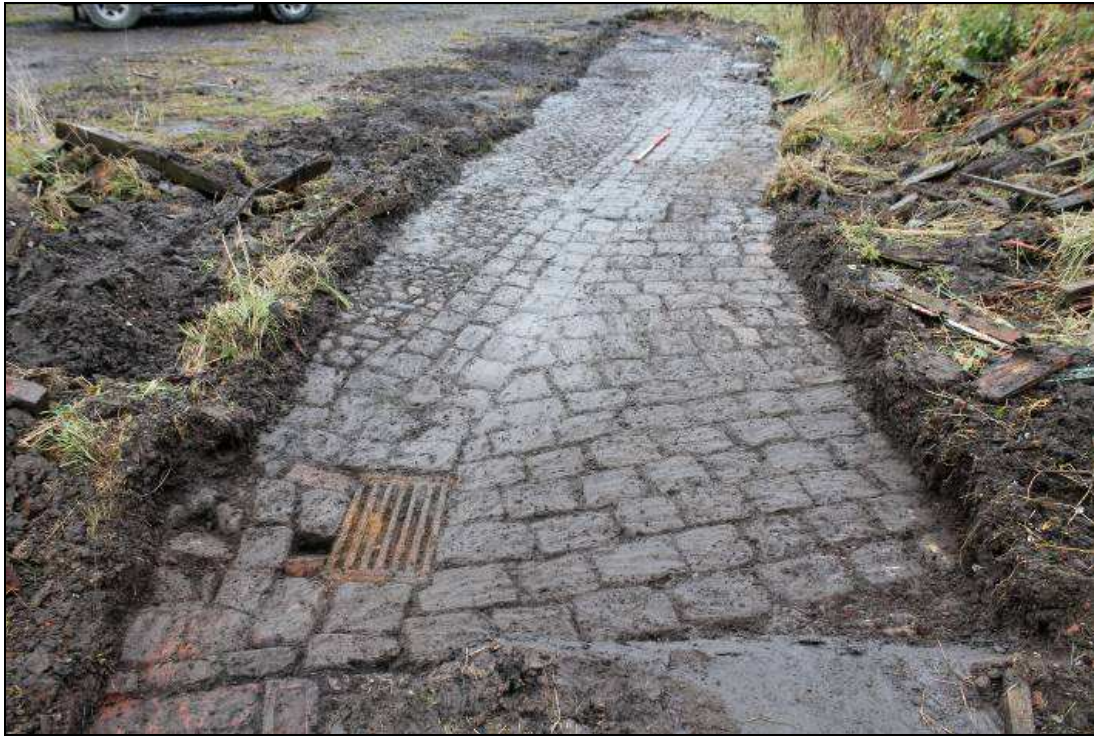
Plate 10: Set surface 305 with grid 306 at the end of the drainage run, looking north-east