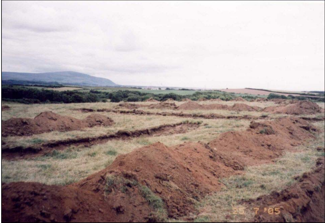
Plate 1: General view of trenches, facing eastwards