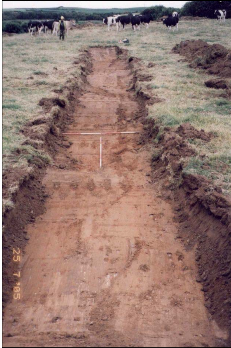
Plate 2: Trench 4