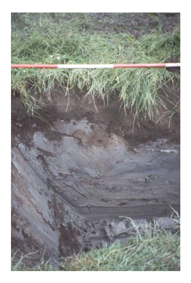
Plate 3: Pit 7, north-west-facing section showing clay only, no peat