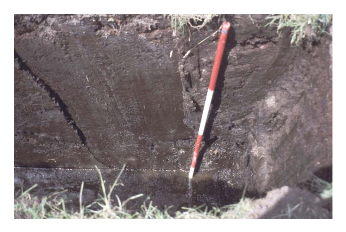
Plate 1: Pit 2, south-east-facing section