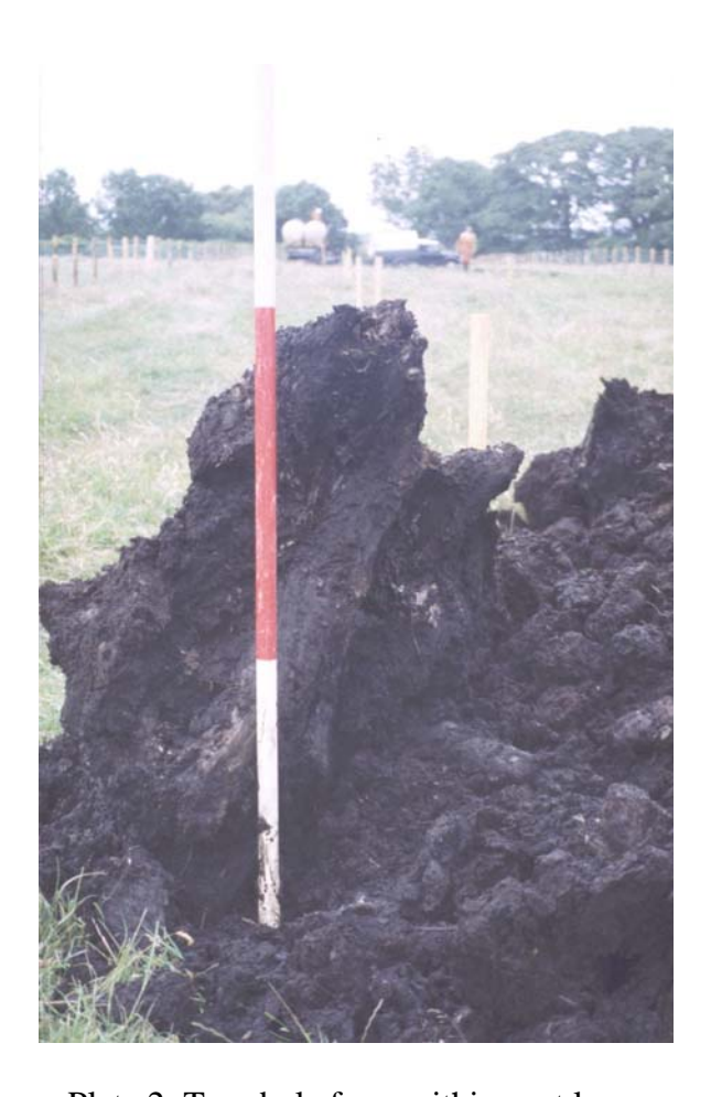
Plate 2: Tree-bole from within peat layer