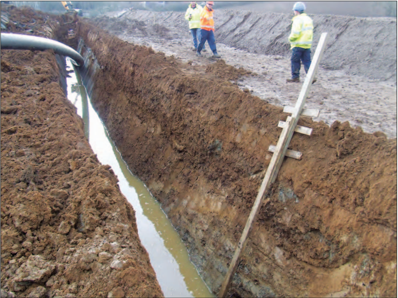
Plate 3: Glacial anomaly in side of new pipe trench