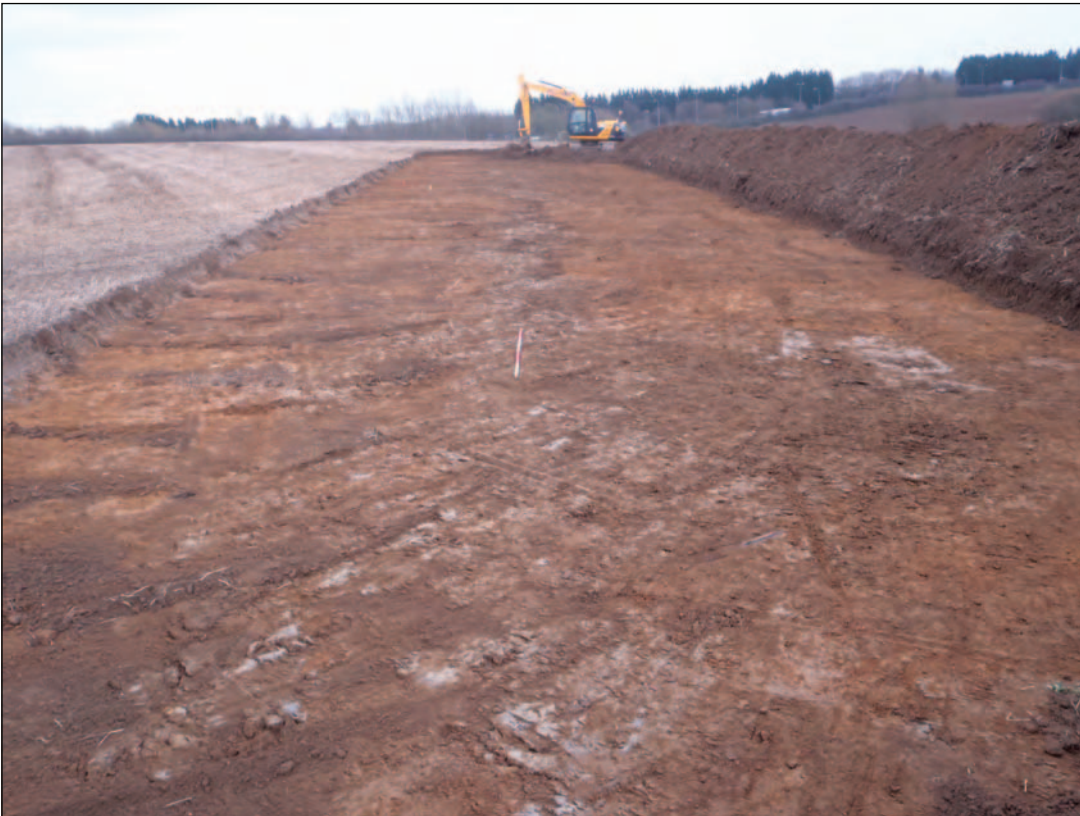
Plate 2: Easement top soil strip, north end of site, showing existing pipe trench