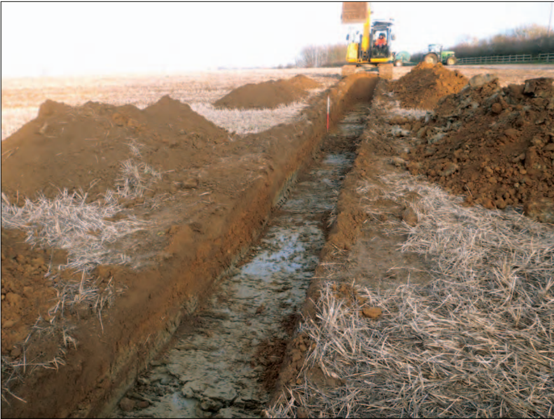
Plate 1: Trench 3