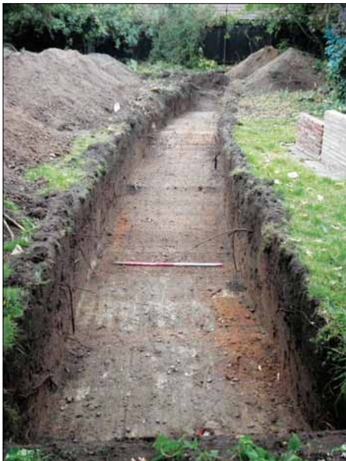
Plate 1: Trench 1 (looking south-east)