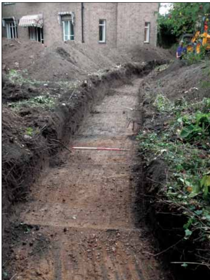
Plate 2: Trench 2 (looking north-northeast)