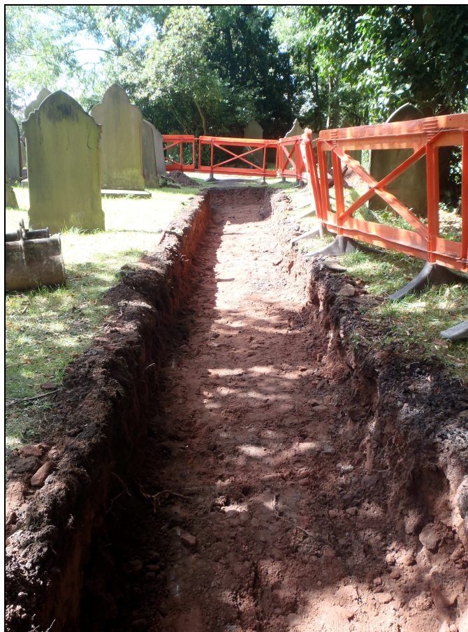
Plate 4: Trench 2 fully excavated. Viewed facing west.