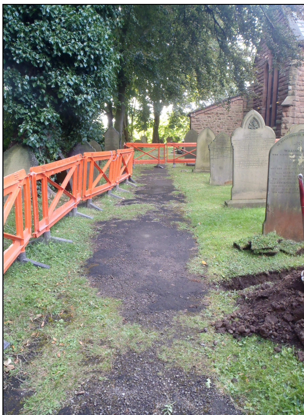
Plate 2: Location of drain through pathway facing east