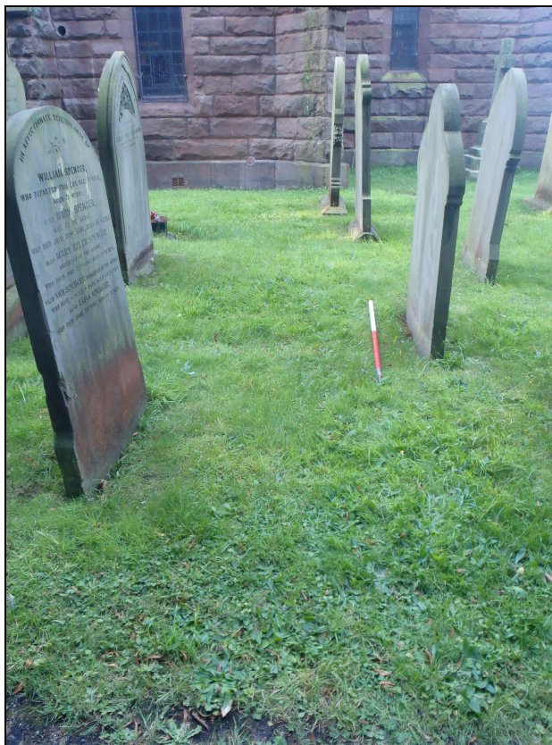
Plate 1: Location of drain through graveyard to the north of the church.