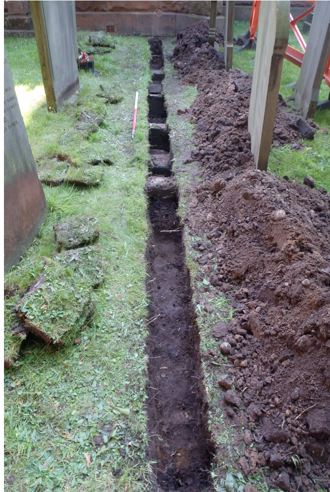
Plate 3: Excavated Trench 1 through the graveyard. Viewed facing south.