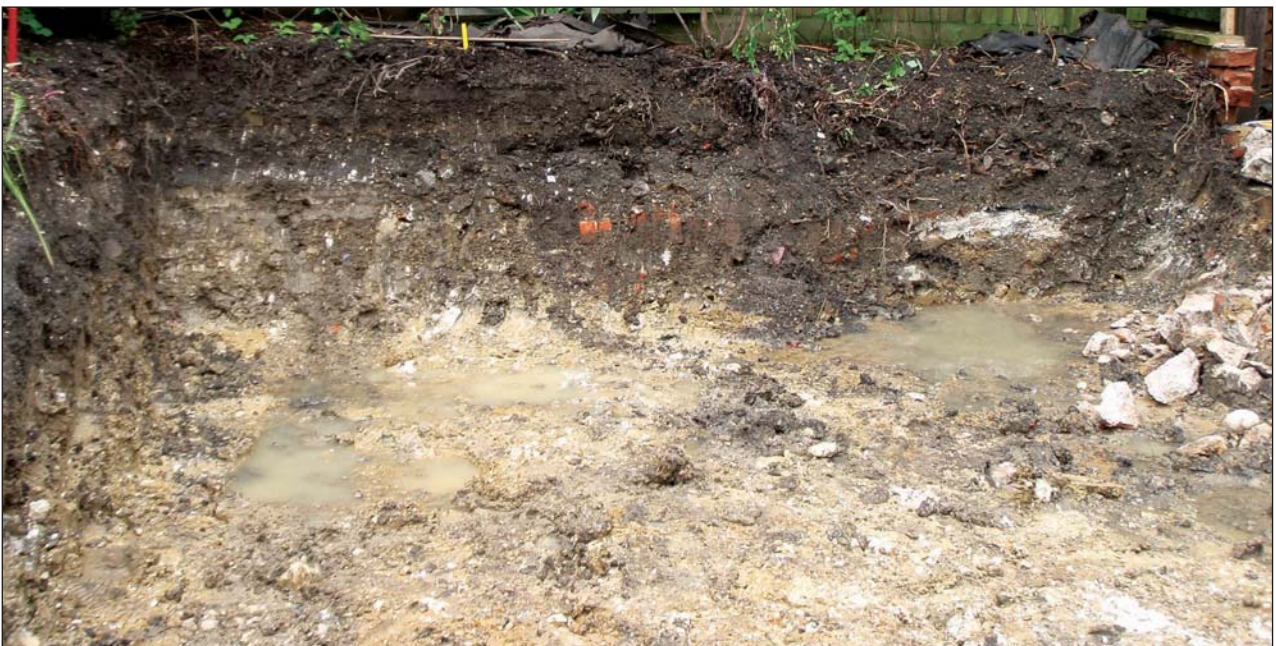
Plate 2: South-east facing soil profile