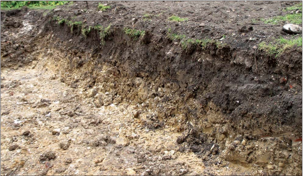
Plate 3: North-east facing soil profile