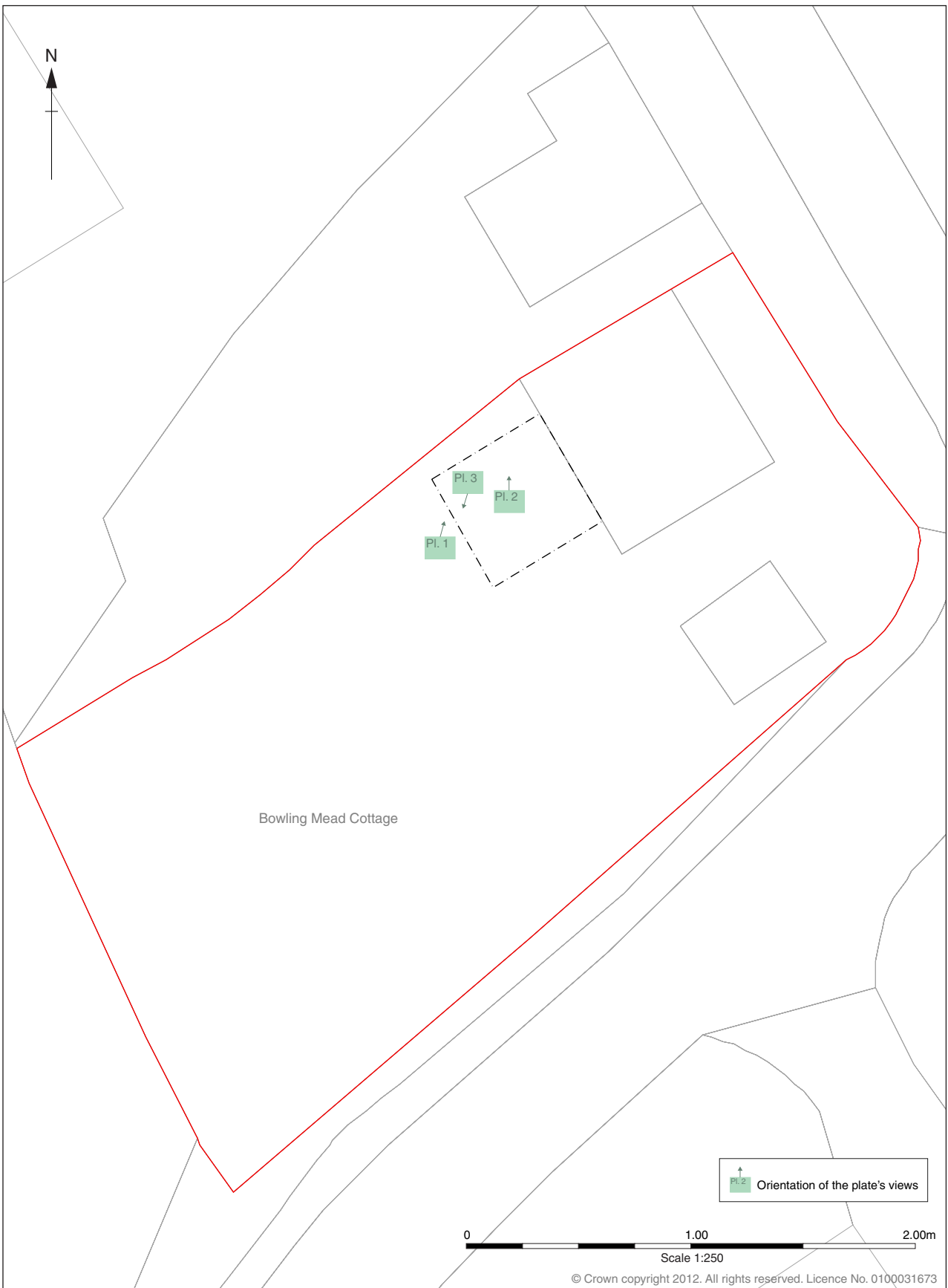
Figure 2: Plan of the sondage (black) with the development area outlined (red)