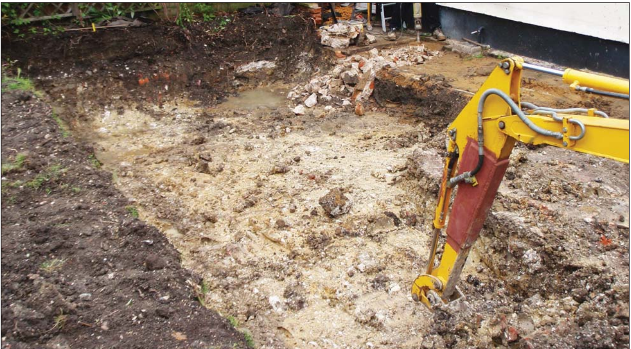
Plate 1: General shot of excavation