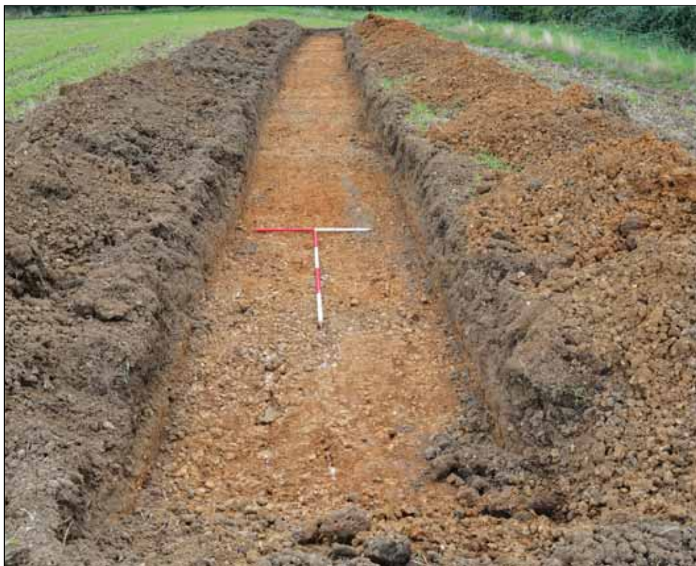
Plate 1: Trench 455 looking from north