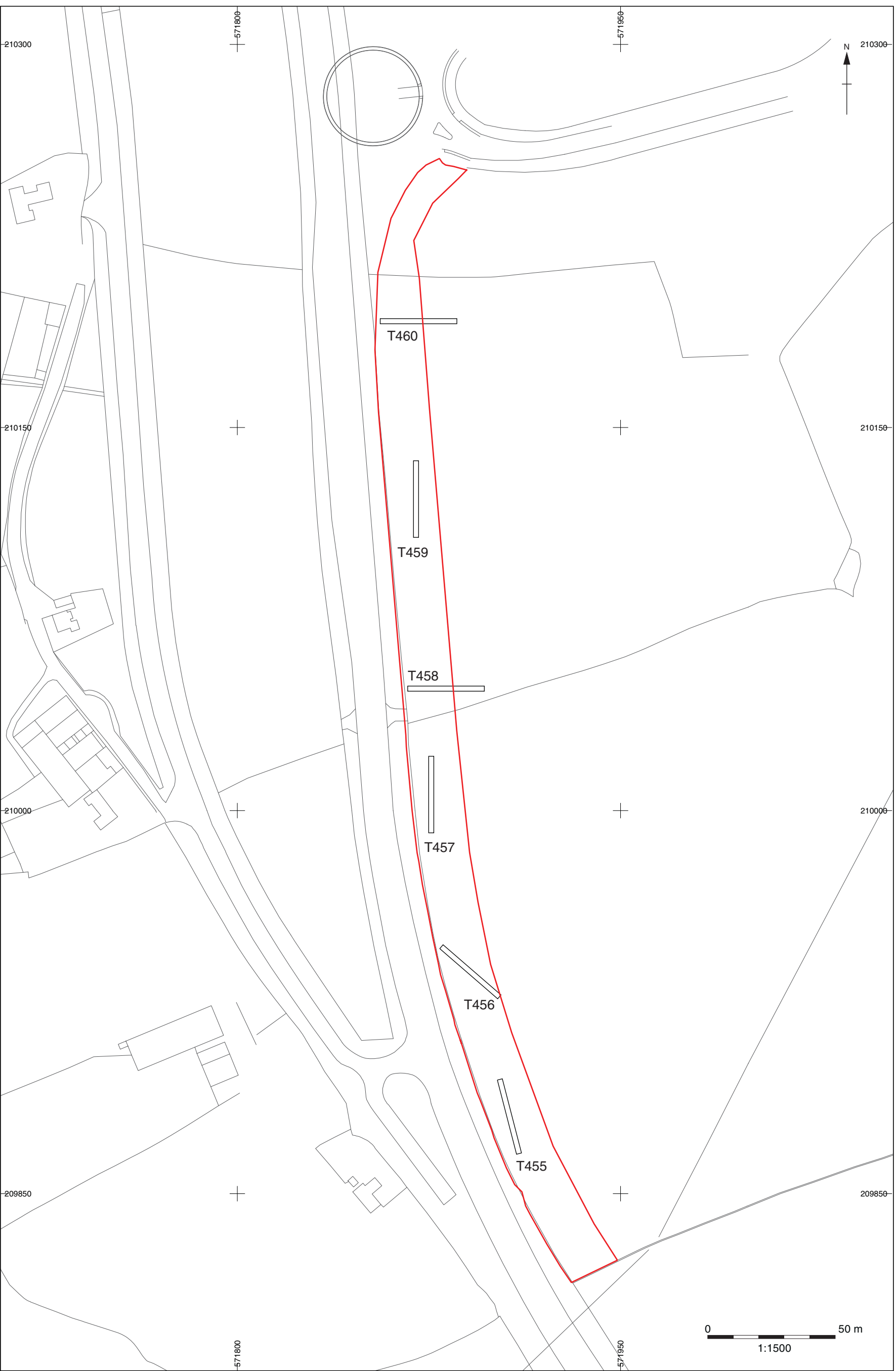
Figure 2: Plan of evaluation trenches.

Contains Ordnance Survey data © Crown copyright and database right 2015.