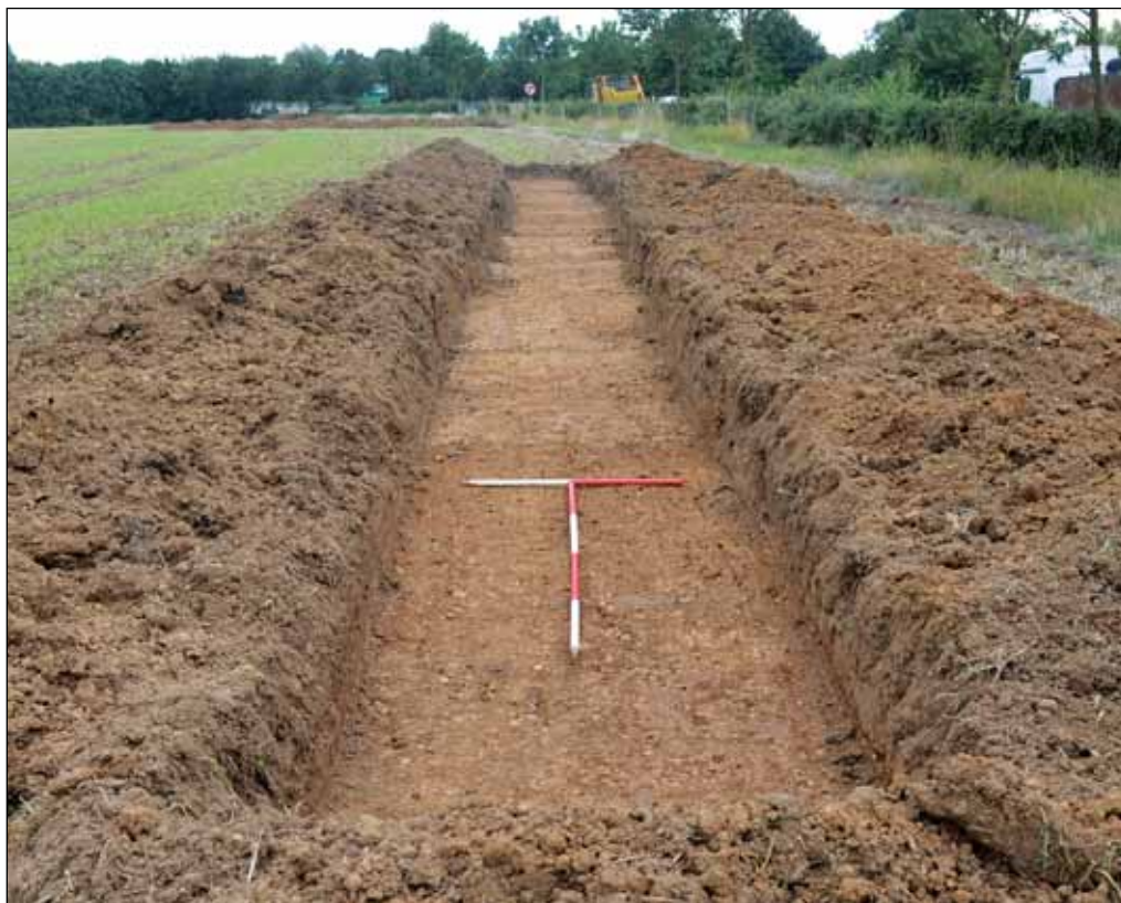
Plate 2: Trench 457 looking from north