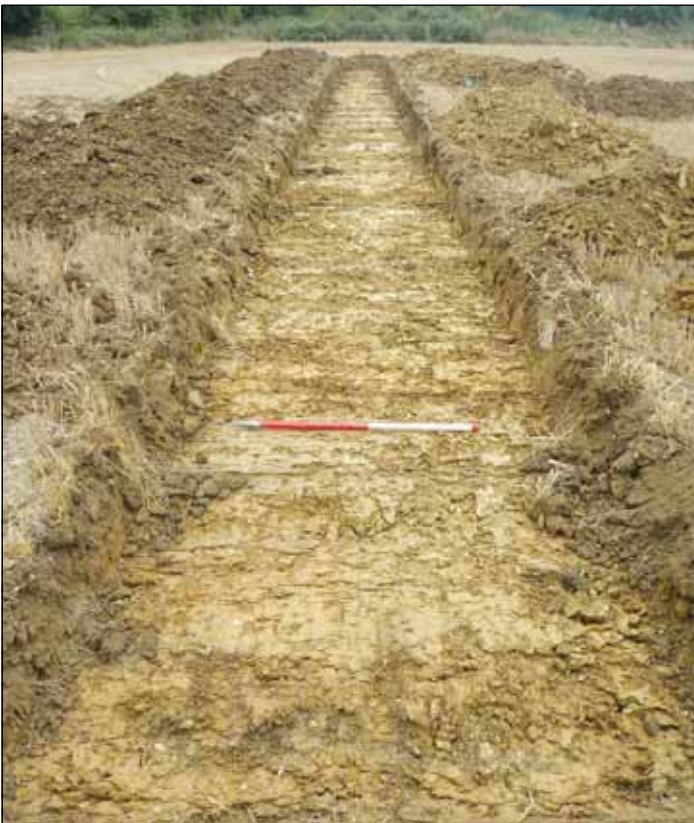
Plate 2: Trench 2, looking south-east