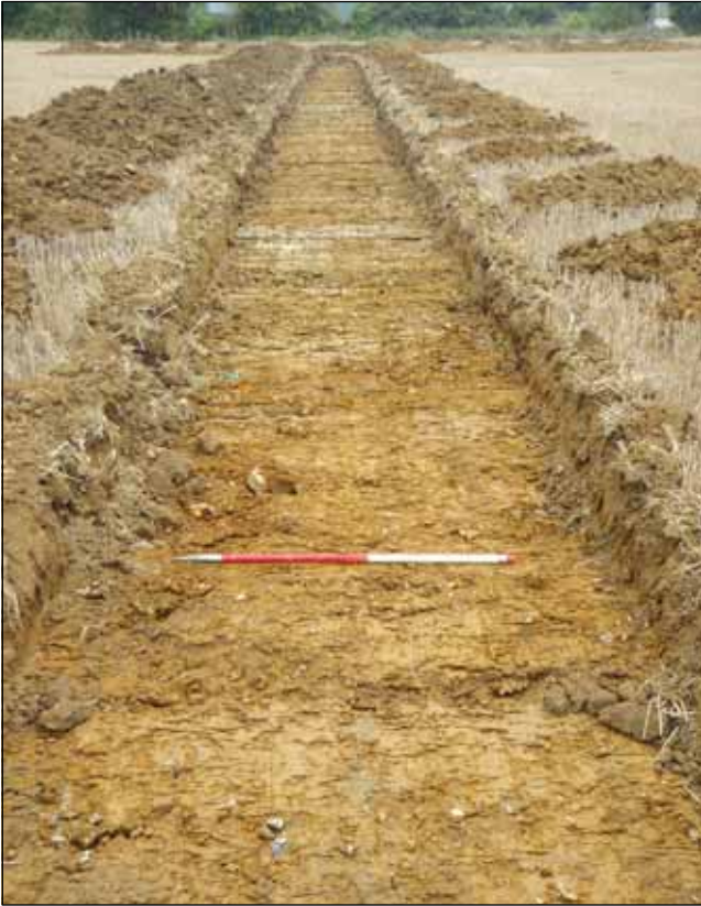
Plate 1: Trench 1, looking north-east