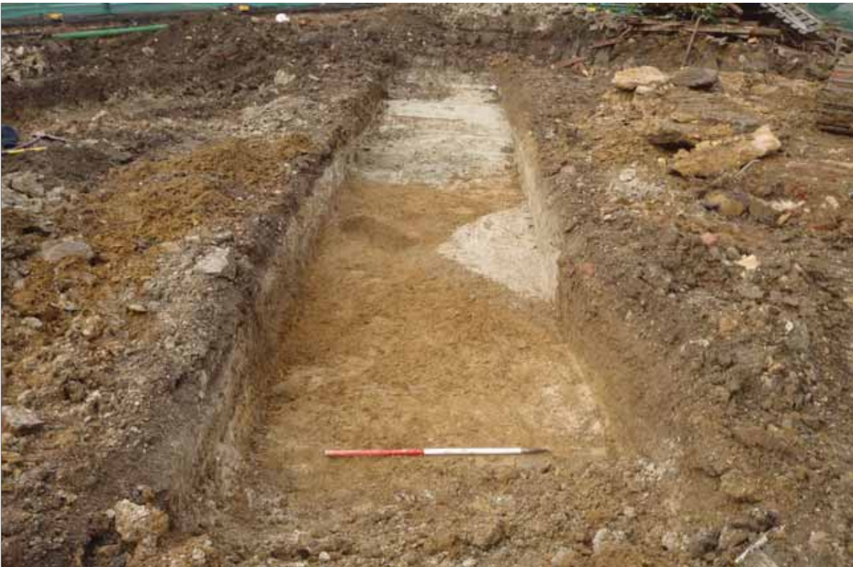
Plate 2: Trench 1. View southwest.