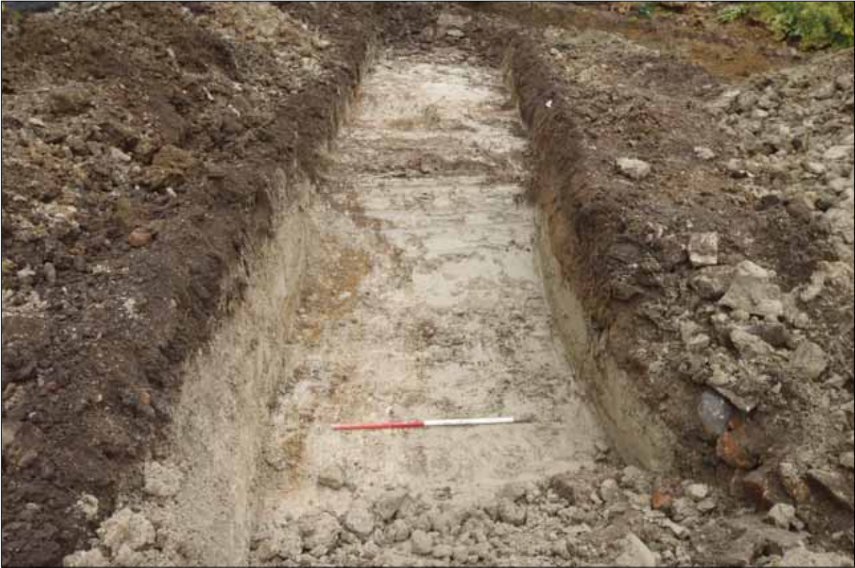
Plate 3: Trench 2. View west.