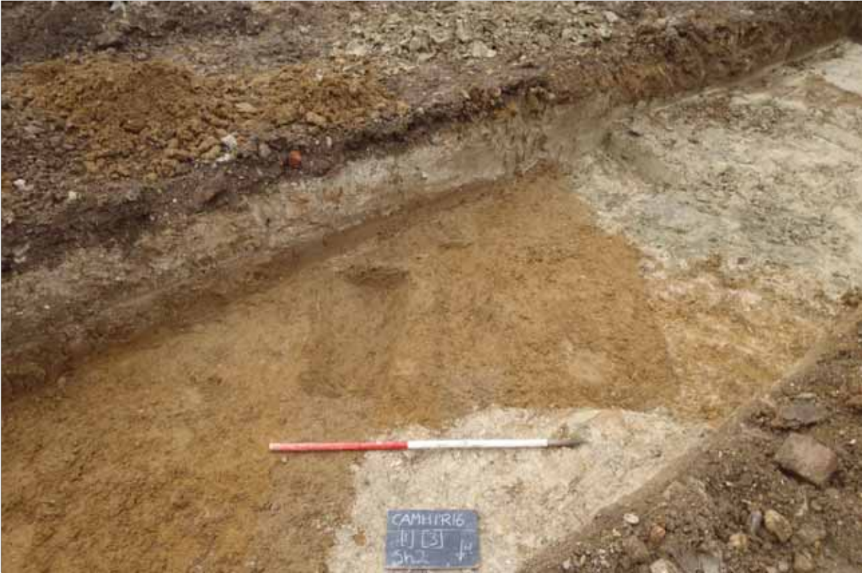
Plate 1: Gullies 1 and 3. View south.