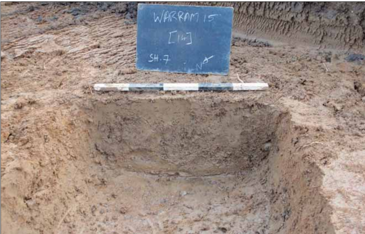
Plate 4: Photo of ditch 14. Photo taken from the north-west