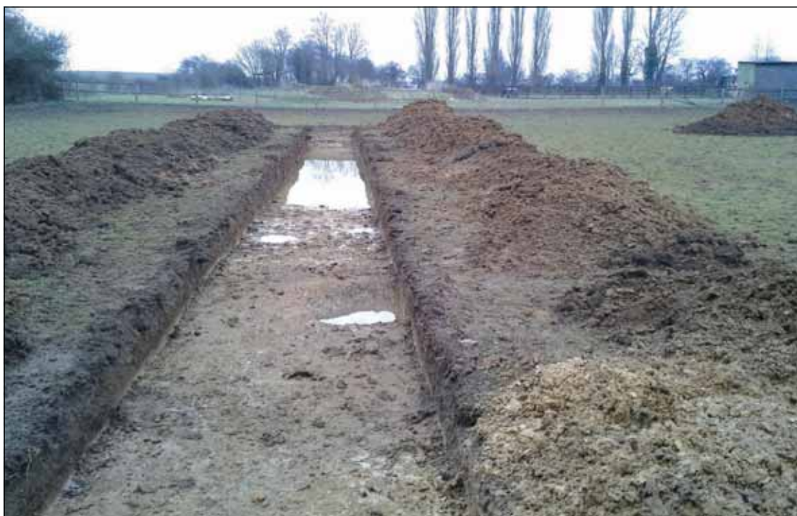
Plate 1: Photo of Trench 1, with the north-east half under water. Photo taken from the south-west