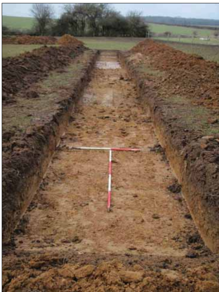
Plate 2: Photo of Trench 2. Photo taken from the north-west