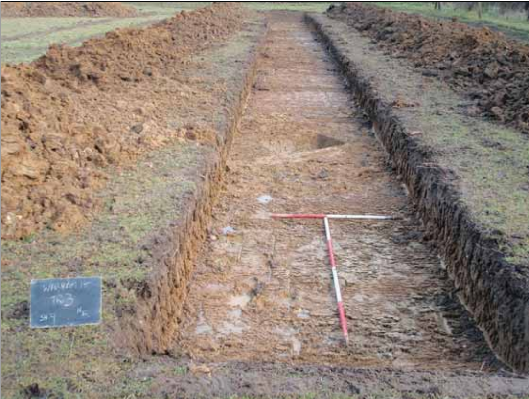
Plate 3: Photo of Trench 3, showing ditch 14 in the foreground. Photo taken from the west