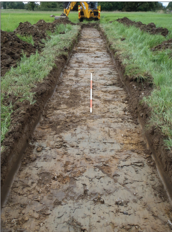
Plate 2: Trench 2, looking west