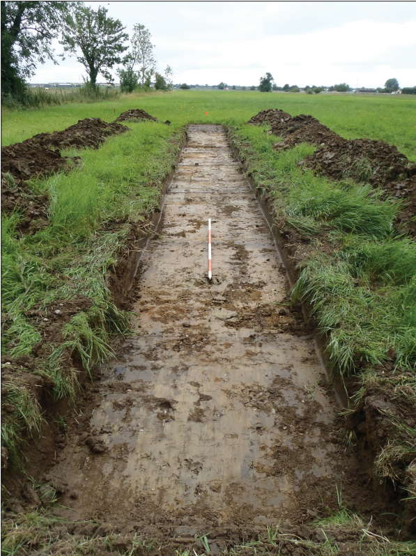
Plate 1: Trench 1, looking south