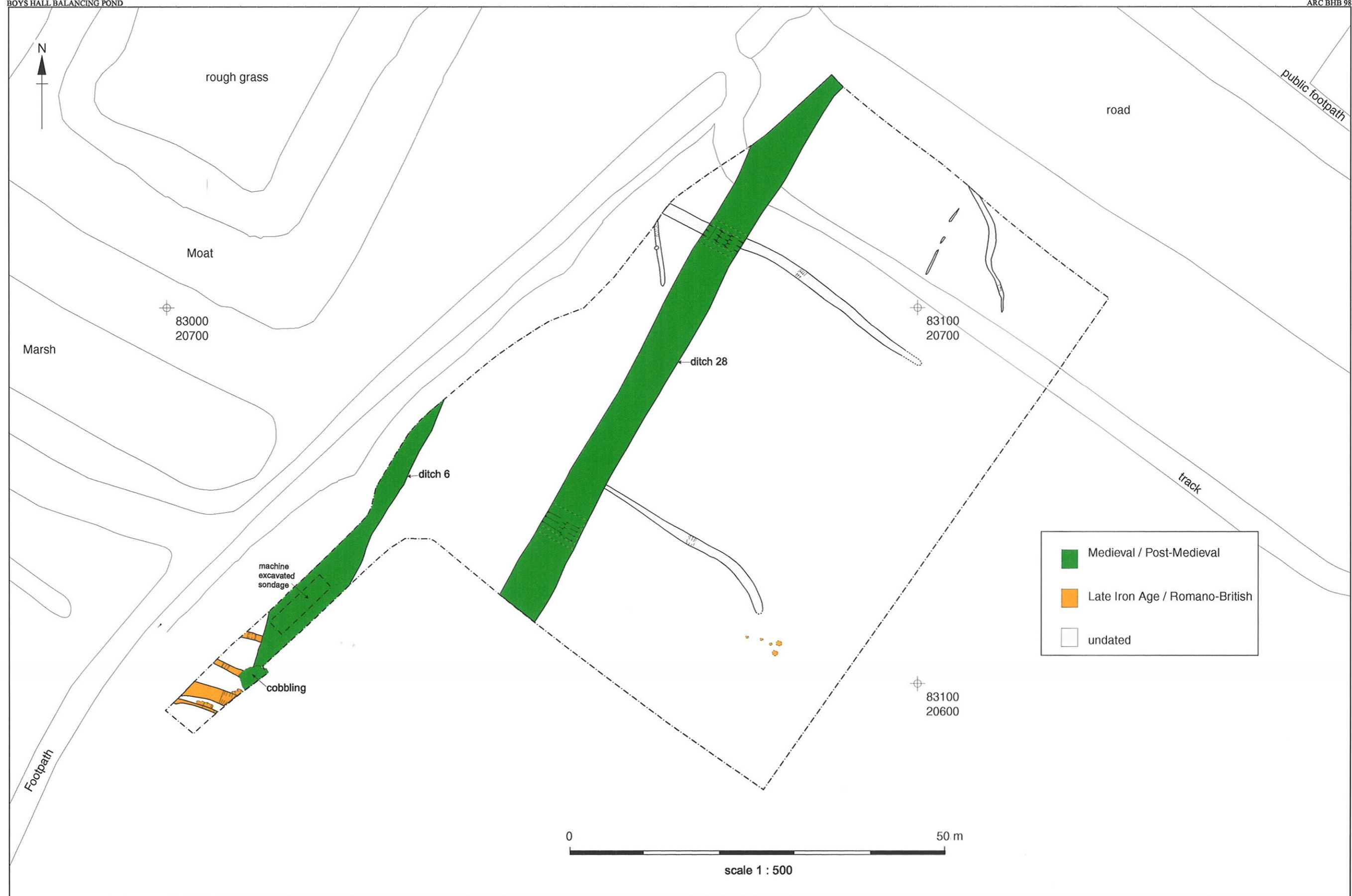
figure 2 : interpretative site plan