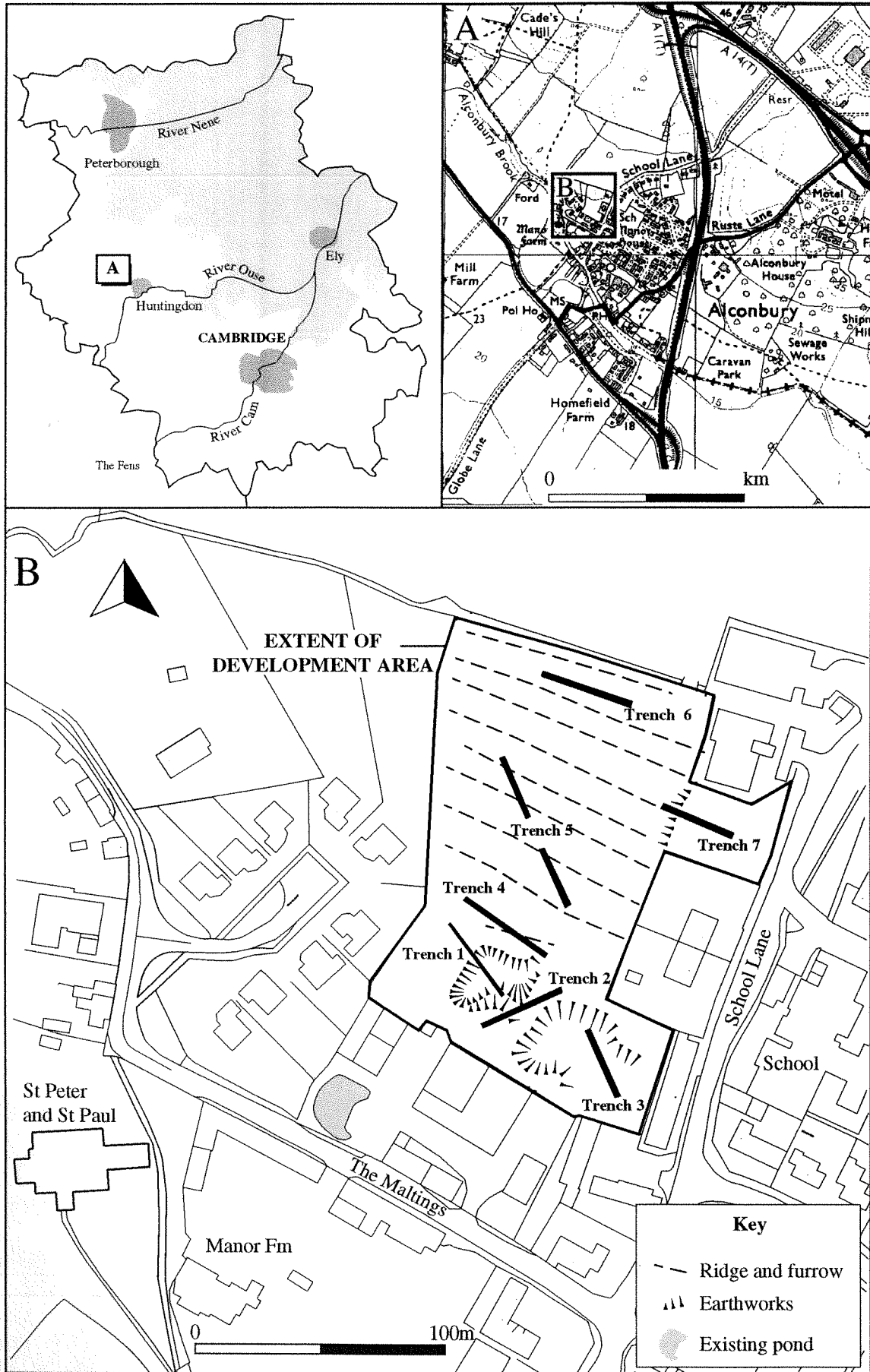
Figure 1 Trench location