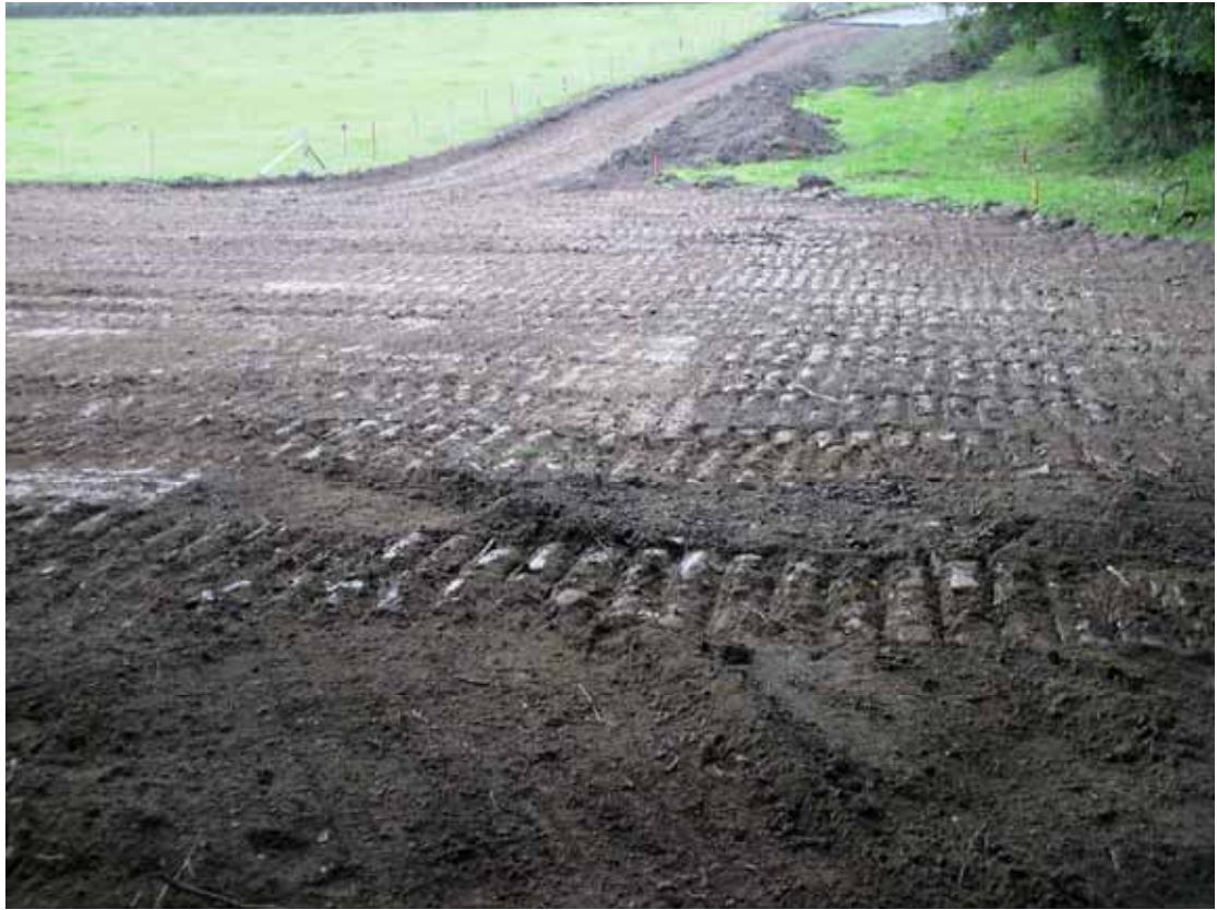
Plate 3: South-facing view of the north-west corner of Field 2