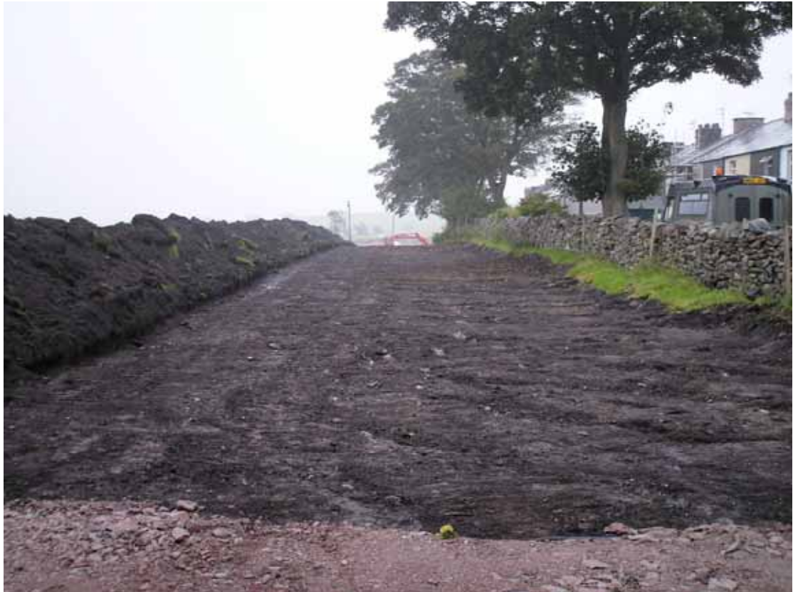
Plate 1: East-facing view of the west end of the east/west easement within Field 1