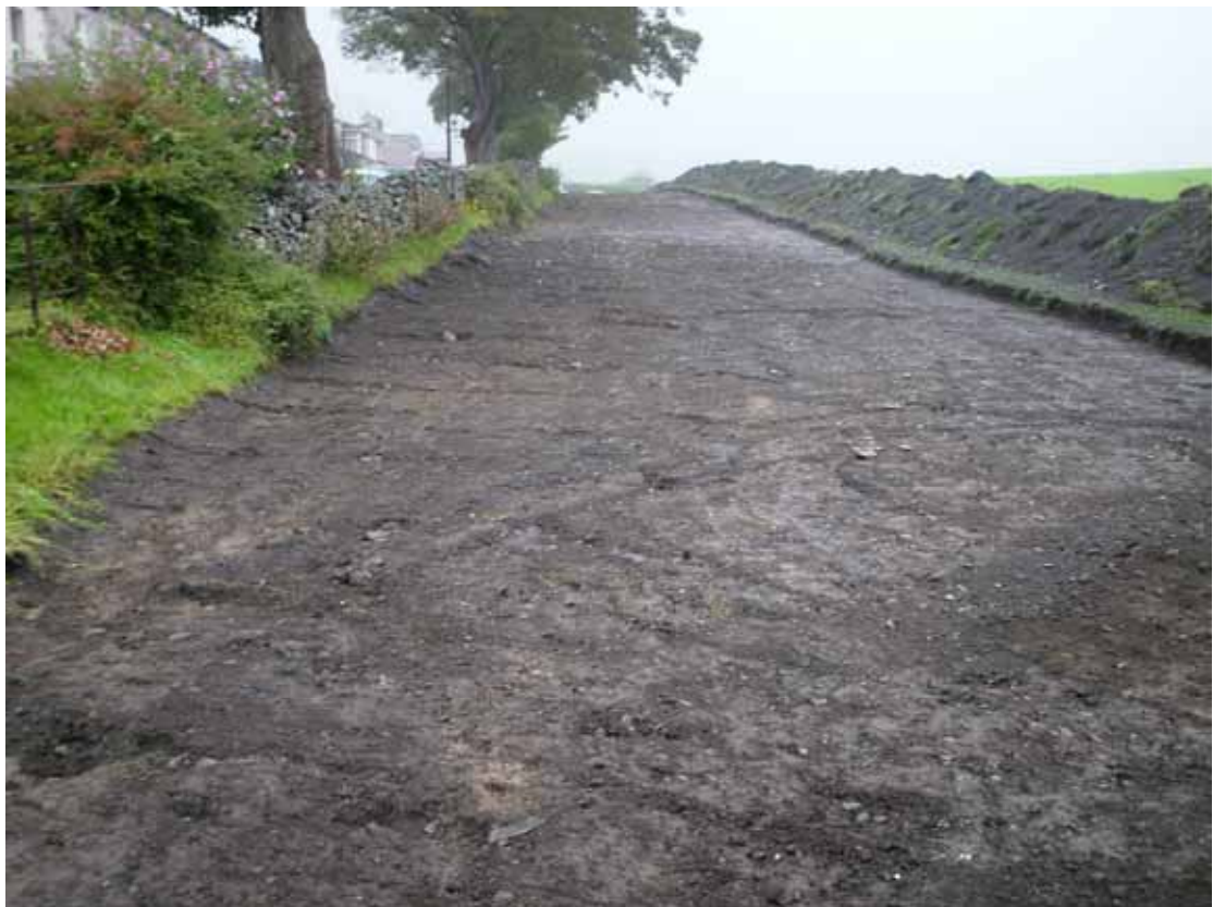
Plate 2: West-facing view of the east end of the east/west easement within Field 1